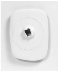
Gaylen Gerber Support , n.d. oil paint on Concetto Spaziale Cratere by Lucio Fontana, 1968, cast and hand-punctured porcelain 15 x 11.5 x 3 inches (38.1 x 29.21 x 3 cm)