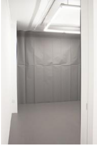
Gaylen Gerber Backdrop , 1999 background paper, aluminum pins dimensions vary with installation