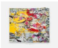
Gaylen Gerber with Adrian Schiess Support/Sunset , n.d., 2003 enamel, acrylic and polyurethane foam on canvas 19 \frac{3}{4} x 23 \frac{3}{4} inches (50 x 60 cm)