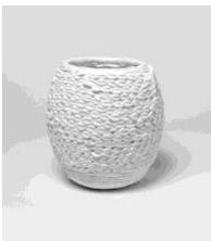
Gaylen Gerber Support , n.d. oil paint on Cowrie Shell Basket (Currency Basket) , Yoruba, Nigeria, 20 th century, vegetable fiber, cowrie shells and leather 10 x 10 x 11 inches (25.4 x 25.4 x 27.9 cm)