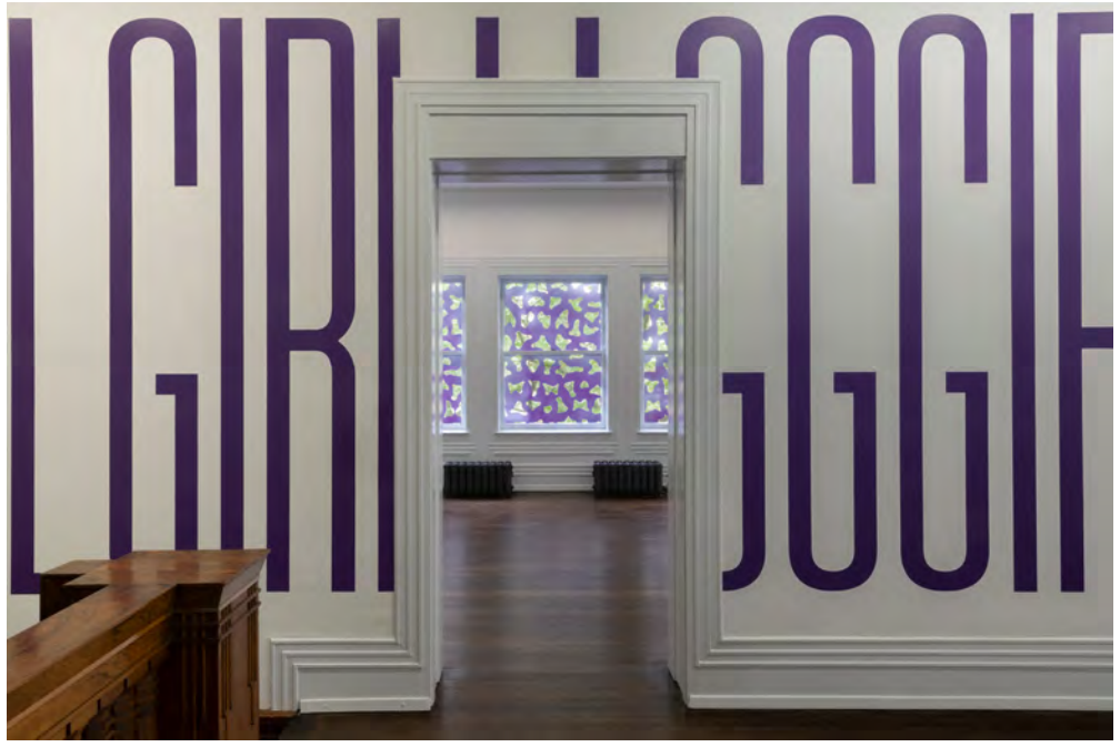
Images: View of Martine Syms: Incense Sweaters & Ice.