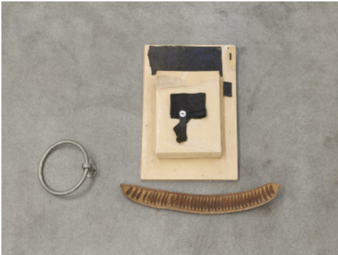
My Mind Wore Horse Pants 2017

Handwriting paper, plastic, palm pod, metal hand towel ring, black trash bag swatch, rubber line, horseback riding pant swatch 30 x 21 x 2.5"