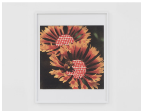
Memory Card: Bee On Flower 2018

Wood, cinder blocks, envelopes, archival print, temporary tattoos, paper clips, ziplock bag, cap shaper, tracing paper, handwriting paper, bird spikes, mouse pad, chalk, plaster, artificial squirrel 60 x 43 x 13"