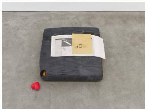
Impossible Window 2009 - 2014

Archival inkjet on cotton rag 32 x 40" Edition 2 of 5