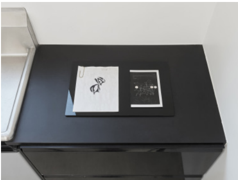
Left: Birds Eyes , 2019

Archival print, paper, cardboard, clear tape, masking tape, dust 10 x 1.5 x 12.5"