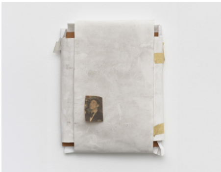
Conceal The Thought 2020

Handwriting paper, plastic, palm pod, metal hand towel ring, black trash bag swatch, rubber line, horseback riding pant swatch 30 x 21 x 2.5"