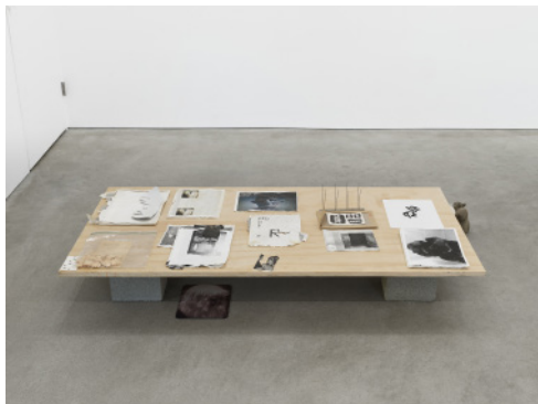
Piper At The Gates Of Dawn 2020 - 2024

Wood, cinder blocks, envelopes, archival print, temporary tattoos, paper clips, ziplock bag, cap shaper, tracing paper, handwriting paper, bird spikes, mouse pad, chalk, plaster, artificial squirrel 60 x 43 x 13"