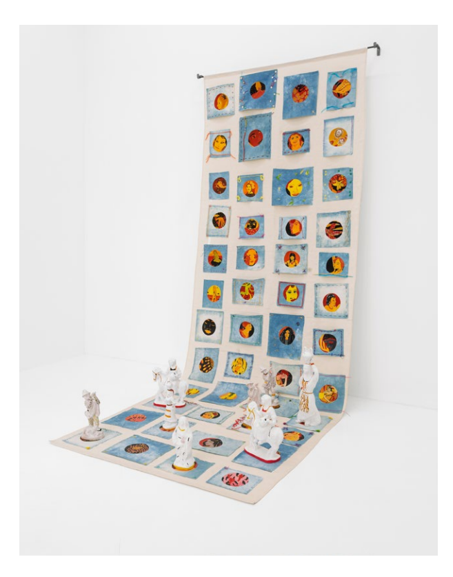
\label{eq:archeologia} \textit{Archeologia della Ninfa Marica} \ (2021), \ \text{acrylic on naturally dyed cotton sown onto linen support,} painted terracotta sculptures, 300 x 100 cm