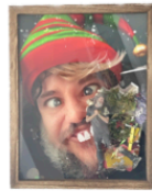
Jimmy Raskin FACIALITY (Awethenticute) Photo and mixed media in curiosities box 11 x 14 in