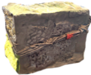
Kea de Buretel Untitled burlap, acrylic, and plaster 6.5 x 6 x 8 in