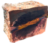
Kea de Buretel Untitled aquaresin and acrylic 6.5 x 6 x 8 in