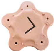
Maite Iribarren Vazquez Untitled Silicone 35 x 38 x 4 in