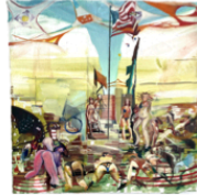
Alex Both Diplo Structure oil on canvas 8 x 8 in