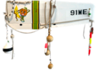
Darius Shaoul ripe fruits riddim airplane wing, gouache, assorted marine equipment 29 x 10 in

Aruga Fine Arts 68 SE 6TH St Miami, FL 33131