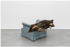
Michael E. Smith untitled , 2023 chair, ducks 106.7 x 106.7 x 106.7 cm 42 x 42 x 42 in