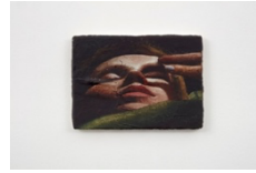
Joseph Yaeger A minute with seasons , 2023 watercolour on gessoed canvas 26.5 x 36.7 x 2 cm 10 3/8 x 14 1/2 x 3/4 in