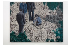
Michael Ho In Praying for Harvest to the Sun , 2024 oil and acrylic on canvas 230 x 295 cm 90 1/2 x 116 1/8 in