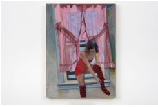
Michelle Uckotter Red Kira , 2024 oil pastel on panel 101.6 x 75.6 cm 40 x 29 3/4 in