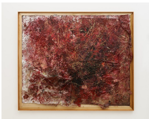
Jay Payton A Brief Moment of Lust and Oxytocin (Thank You For Loving Me) , 2024 Oil paint, plastic, aluminum on canvas, frame 86 x 100 inches