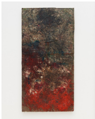
Jay Payton Anamnesis , 2024 Oil and paper on canvas, wood 70 x 35 inches