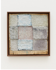
Magnus Maxine USA TODAY Monday, April 3, 2023, 2023-24 Oil on newspaper and paper pulp 24 x 23.25 x 2.125 inches