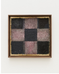
Magnus Maxine The New York Times Friday, October 9, 2020, 2020-24 Oil on newspaper and paper pulp 23 x 23 6/8 x 2.125 inches