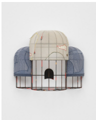
Greg Carideo NST , 2024 T-shirts, steel, enamel paint, acrylic paint, rust, silver brazing, lost/found shoe heel 23.125 x 18 x 13 inches