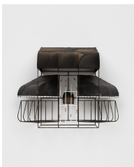
Greg Carideo FPR , 2024 T-shirt, found sheet metal, steel, enamel paint, acrylic paint, rust, silver brazing, lost/found shoe heel 17.25 x 21 x 12.25 inches