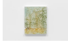
Chestnut Trees, 2024 oil on canvas 44 x 35.9 cm 17 3/8 x 14 1/8 in