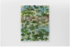
February 2024 (Hudson River), 2024 oil on canvas 170.2 x 137.2 cm 67 x 54 in