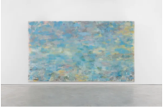
Clouds, 2024 oil on canvas 278 x 487.5 cm 109 1/2 x 191 7/8 in