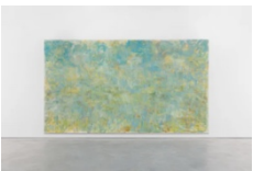
Grass, 2011 oil on canvas 277 x 486 cm 109 x 191 3/8 in