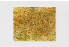
Leaf Mulch (1), 2023 oil on canvas 137.5 x 170 cm 54 1/8 x 66 7/8 in