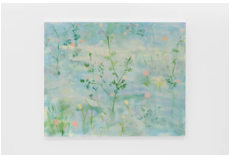
Roses, Dahlias, Daffodils, 2024 oil on canvas 137.5 x 170 cm 54 1/8 x 66 7/8 in