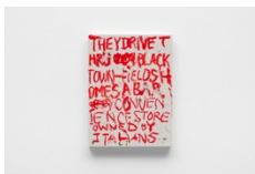
Pope.L Fields Homes Bar , 2020-21 oil stick, hair, PVA, epoxy and ink on panel 40.6 x 30.5 cm 16 x 12 in