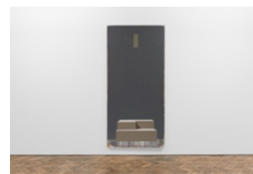
Michael Simpson Squint 77 , 2022 oil on canvas 230 x 108 cm 90 1/2 x 42 1/2 in