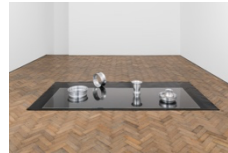
Phillip Lai Certain pressures , 2014 aluminium, rubber, acrylic 30 x 289 x 139.5 cm 11 3/4 x 113 3/4 x 54 7/8 in