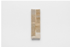
Sarah Rapson Total (New York Times sutra #17) , 2018/2024 Newspaper on linen 39.7 x 12.2 cm 15 5/8 x 4 3/4 in