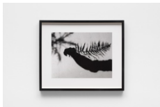
Collier Schorr Selbst portrait (Farn) , 2009 silver gelatin print 61.9 x 74.5 cm 24.4 x 29.3 in