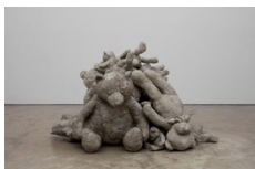
Josh Kline Indifference , 2017 polymerized gypsum, sand, gravel, urethane foam, steel, and acrylic 114 x 202 x 195 cm 44 7/8 x 79 1/2 x 76 3/4 in