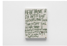
Pope.L Then She Was Talking , 2020-21 oil stick, hair, PVA, epoxy and ink on panel 40.6 x 30.5 cm 16 x 12 in