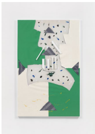
Untitled , 2019-2021 Acrylic, enamel, fabric, wood and linen on muslin 82 x 53 x 2.5 inches (208.3 x 134.6 x 6.4 cm) RA124