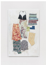
Delivery1 , 2022 Oil, wax, and charcoal on linen 82x53 inches (208.3 x 134.6cm) RA127