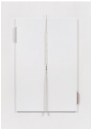
Untitled , 2022 Oil, wood, and fabric on linen 88 x 57 inches (223.5 x 144.8 cm) RA128