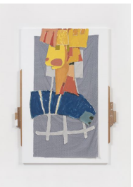
Untitled , 2020-2021 Oil, fabric, wood, and brass on linen 82 x 62 inches (208.3 x 157.5cm) RA126