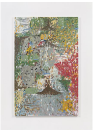
Garden , 2021 Oil and wax on linen 82 x 53 inches (208.3 x 134.6 cm) RA120