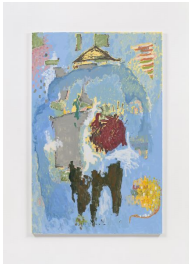
Untitled (Hamlet) , 2021-2022 Oil, wax, and charcoal on linen 82 x 53 inches (208.3 x 134.6 cm) RA121