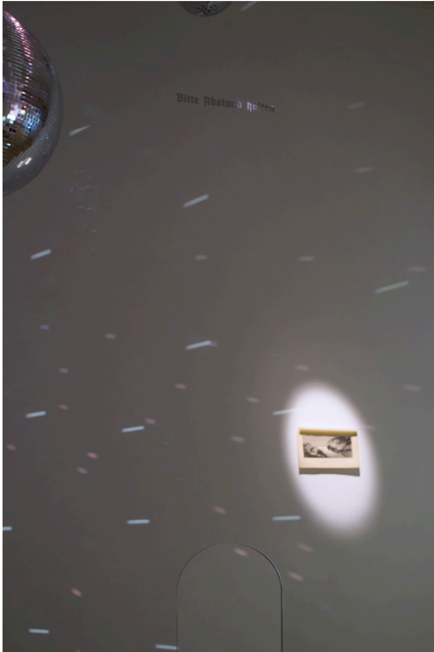
Installation view: Waltz of the Flowers, 2024 at Buzzer Reeves, Berlin