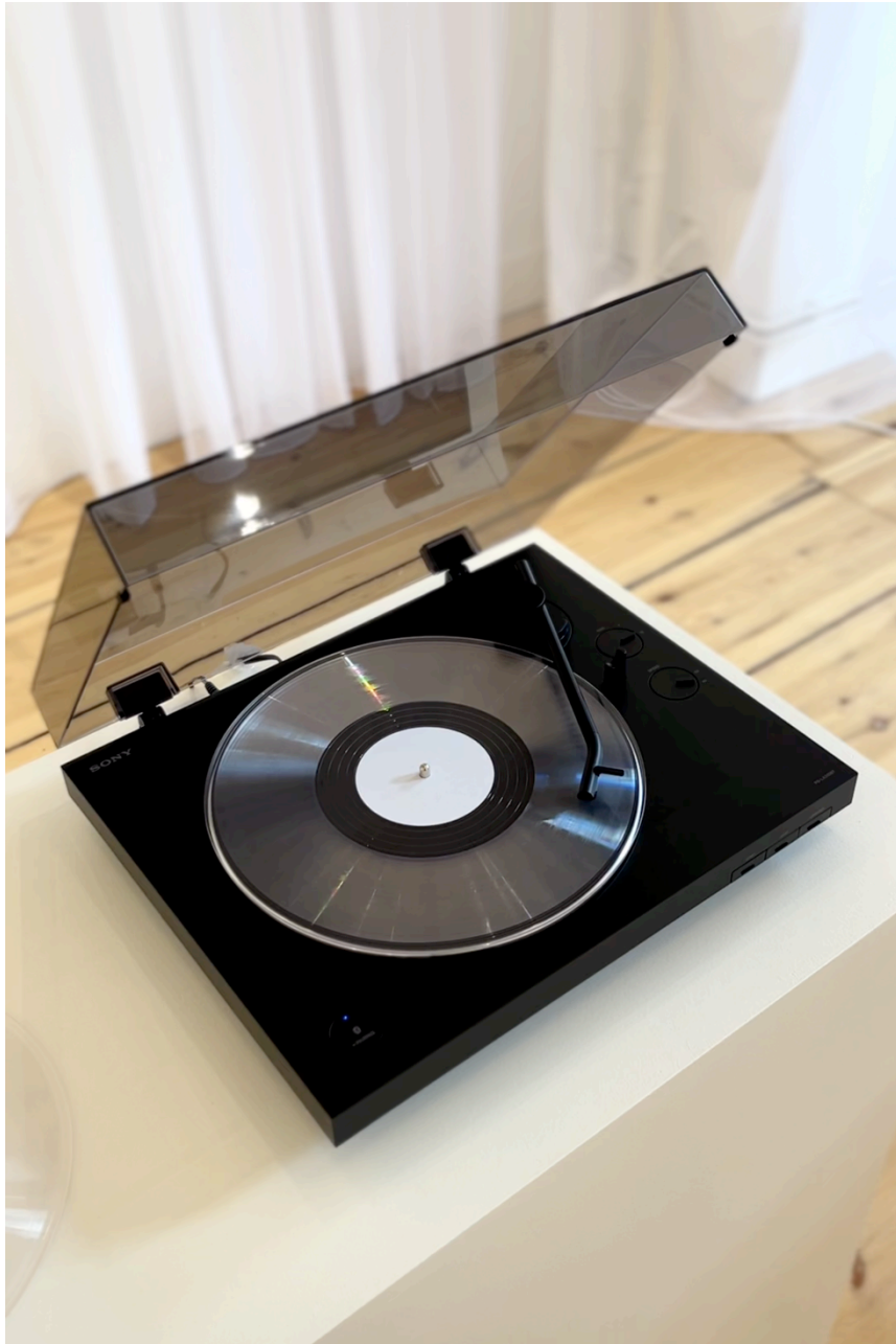
Untitled (No One Like You) , 2024, 3 LP records and LP player, Dimensions variable Installation view: Waltz of the Flowers , 2024 at Buzzer Reeves, Berlin