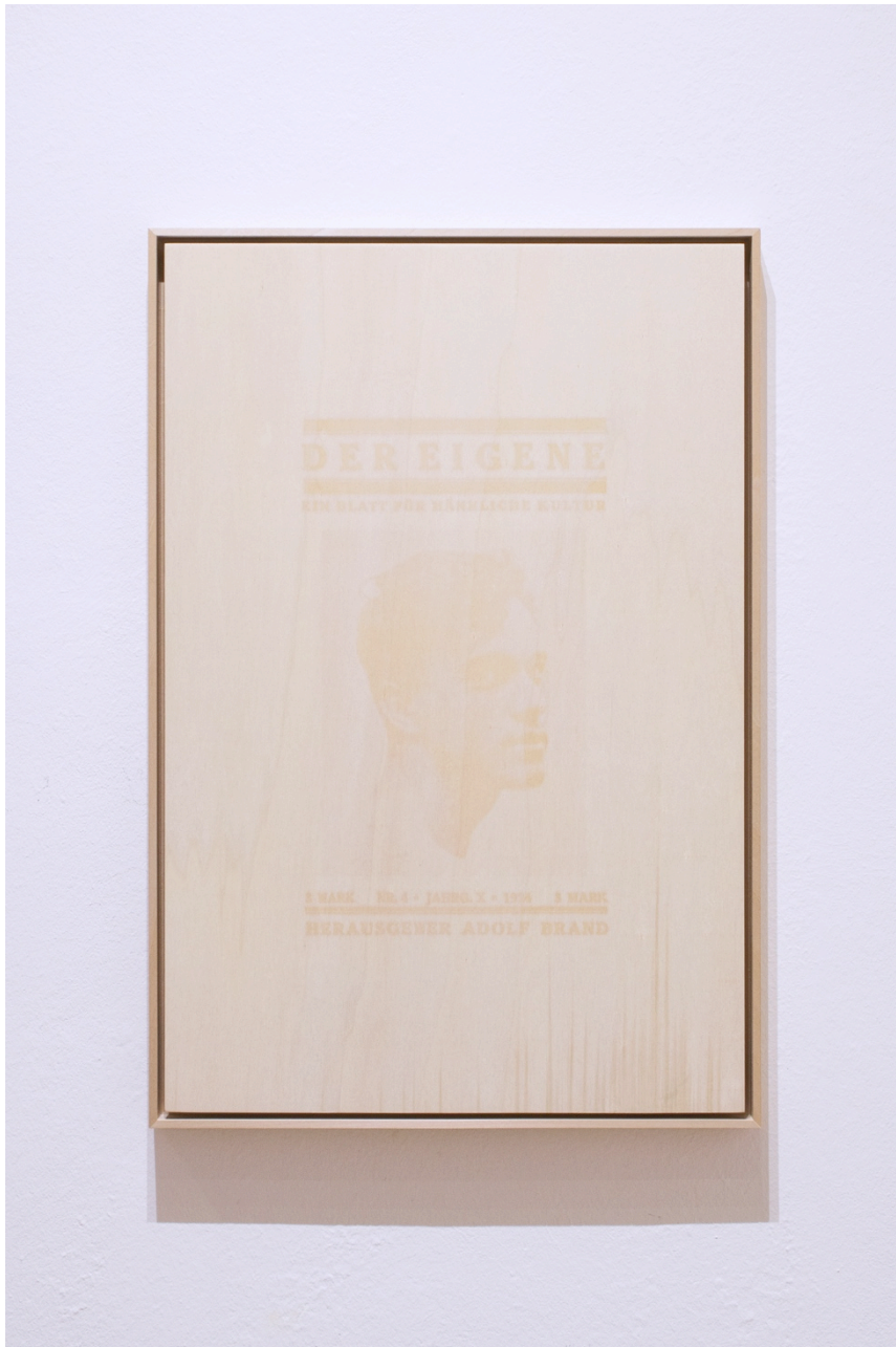
Untitled (Beautiful Days) , 2024, Sun-bleached wooden plate, anti-UV varnish, 62 x 42 x 3cm