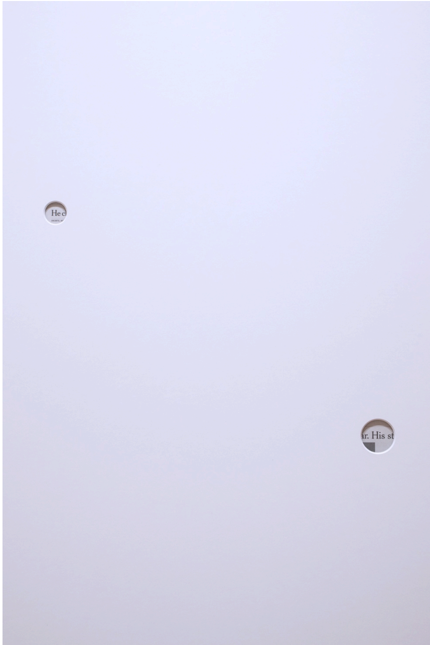
Detail of Untitled (It's Complicated) , 2024

Image: Courtesy of the artist and Buzzer Reeves, Berlin