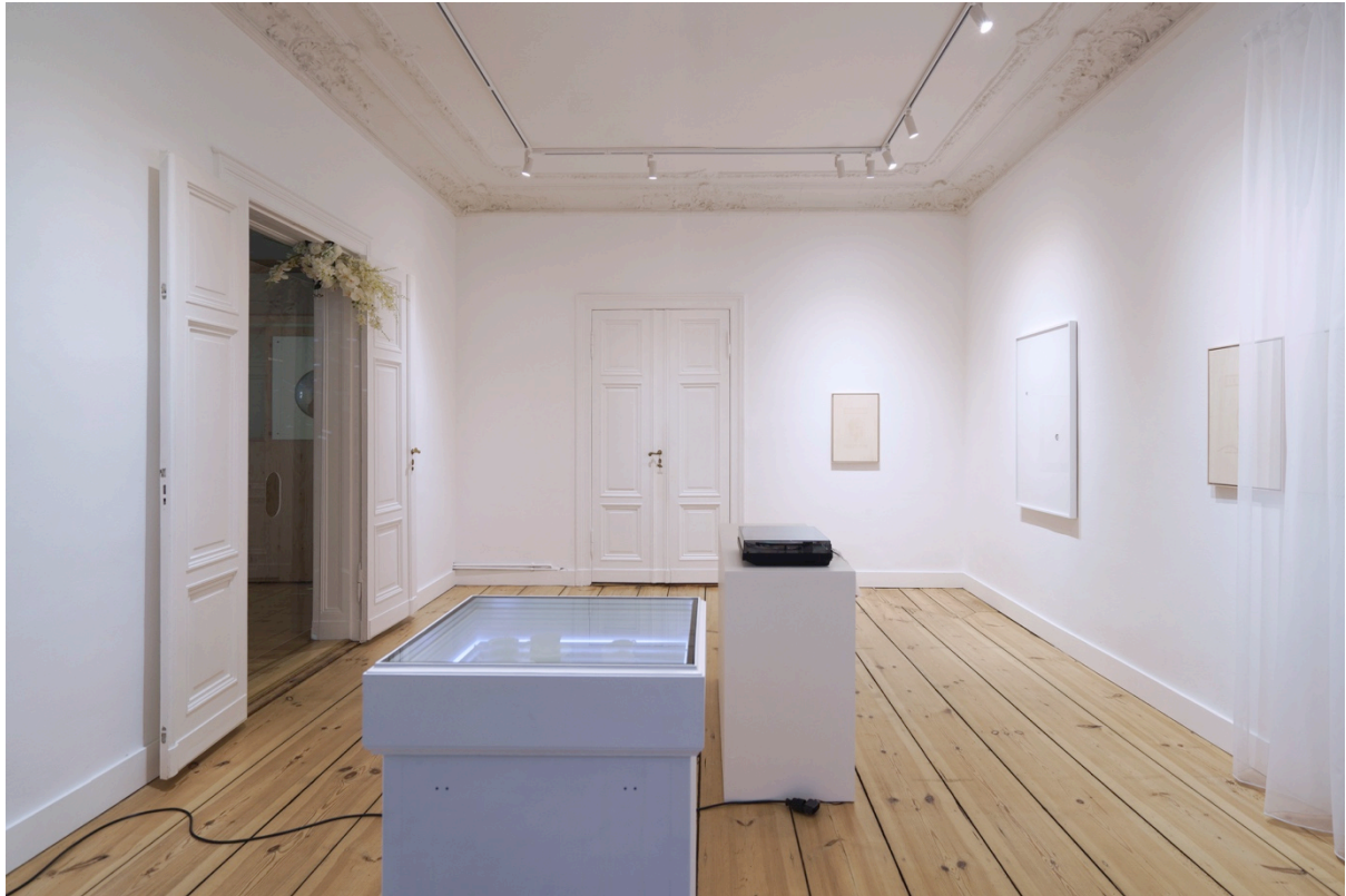
Installation view: Waltz of the Flowers, 2024 at Buzzer Reeves, Berlin