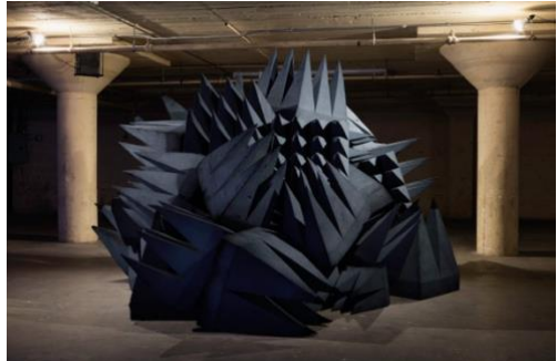
04. Lutz Bacher, Magic Mountain , 2015.jpg

Lutz Bacher Yamaha , 2010 Installation view The Whitney Museum of American Art, New York, 2012