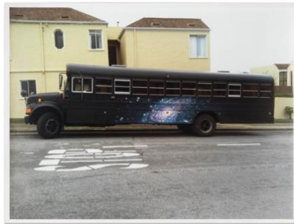
06. Lutz Bacher, The Bus , 2011.tif

Lutz Bacher Please , 2013–16 Installation view, 356 Mission Road, Los Angeles, 2016