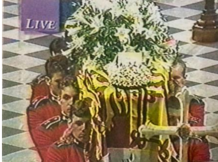
01. Lutz Bacher, Untitled (Diana) , 1997.jpg

For all press enquiries, and high resolution images, contact Sam Talbot e: sam@sam-talbot.com t: 07725184630