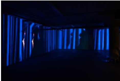
05. Lutz Bacher, Please , 2013–16.jpg

For all press enquiries, and high resolution images, contact Sam Talbot e: sam@sam-talbot.com t: 07725184630