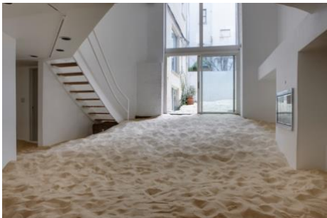
07. Lutz Bacher, The Book of Sand , 2011–12.tif

Lutz Bacher The Bus , 2011