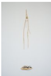
Truman Lowe Moiety , 1997 60h x 15w x 4d in 152.40h x 38.10w x 10.16d cm TL-97-11