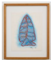
Truman Lowe Untitled (Arrow Head) , 1987 pastel on paper 14h x 11w in 35.56h x 27.94w cm TL-87-01