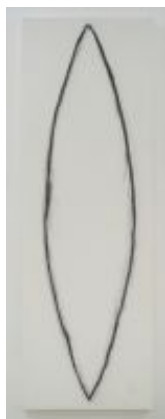
Truman Lowe Untitled (Canoe Form) , n.d. (c. 1997) pigment, white gesso on stretched canvas 72h x 24w x 2d in 182.88h x 60.96w x 5.08d cm TL-ND-06