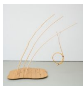
Truman Lowe Water Spirit #3 , 1992 milled pine, peeled willow sticks, pigment, rawhide, bark 58h x 32w x 40d in 147.32h x 81.28w x 101.60d cm TL-92-08