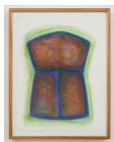
Truman Lowe Copper , n.d. pastel/rives on paper 30h x 22w in 76.20h x 55.88w cm TL-ND-04