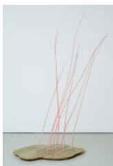
Truman Lowe Water Spirit #16 , 1991 milled pine, peeled willow sticks, Luma color, pastel 67h x 35.63w x 24.13d in 170.18h x 90.49w x 61.28d cm TL-91-09