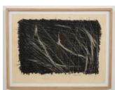
Truman Lowe Untitled (Bird on Branch, Night) , n.d. pastel on paper 22h x 30w in 55.88h x 76.20w cm TL-ND-05