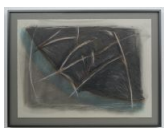
Truman Lowe Obsidian , 1992 pastel on paper 22h x 30w in 55.88h x 76.20w cm TL-92-03