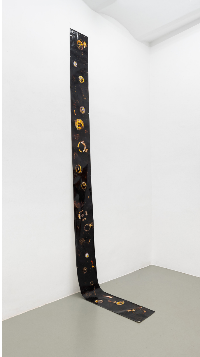
Ryan Foerster Black Garden, 2024 C-Print unique 500 x 40 cm