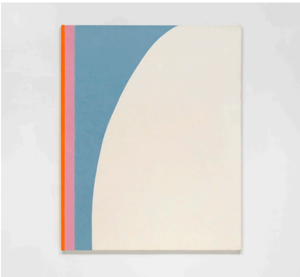
Nan Montgomery Trajectory II , 2007 Oil on Linen 60" H x 48" W (NANM006)