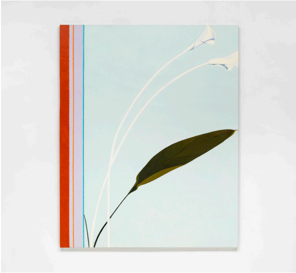
Nan Montgomery Resolution , 2009 Oil on Linen 60" H x 48" W (NANM001)