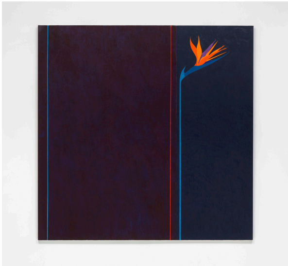
Nan Montgomery Lumenesce , 2012 Oil on Linen 60" H x 60.125" W (NANM002)