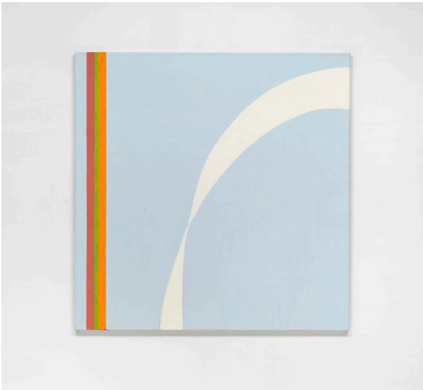
Nan Montgomery Trajectory , 2005 Oil on Linen 50" H x 50" W (NANM004)