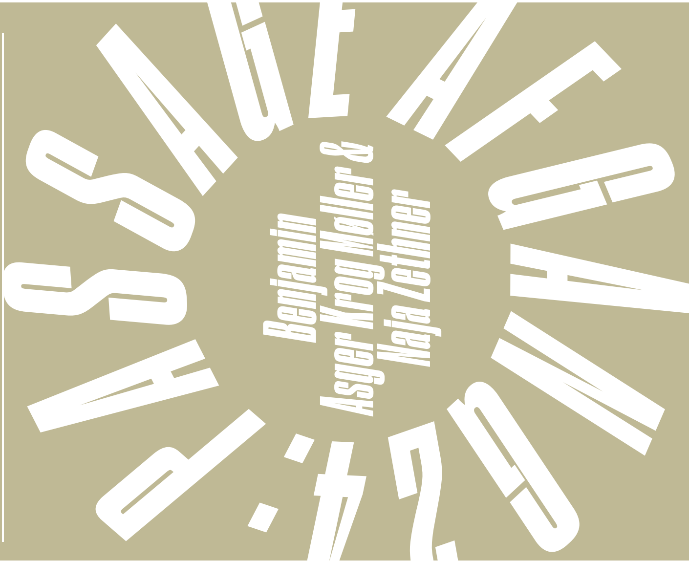
Benjamin Asger Krog Møller & Naja Zethner

The different meanings of the word 'passage' question where everything ends and begins and invite us to be the artists' works in the exhibition, to be open to change and reorganization. It allows us to step in and view the art and the circumstances of its creation in the light of these processes.