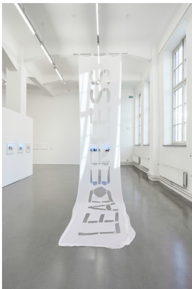
Isaac Chong Wai, Leaderless , 2020–2021, Kunsthaus Hamburg 2024, Courtesy the artist, Zilberman and Kulturakademie Tarabya, Photo: Antje Sauer