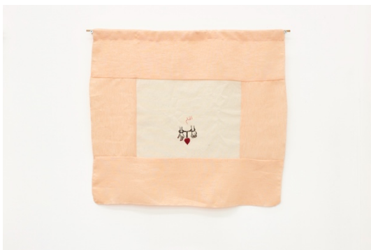
Mounira Al Solh, In Love in Blood, al khulm (Loving bond) , 2023, Courtesy die Künstlerin und Sfeir-Semler Gallery Beirut/ Hamburg