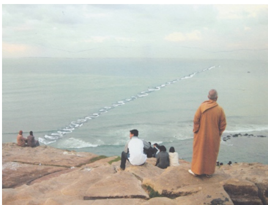
Francis Alÿs, Miradores, 2008