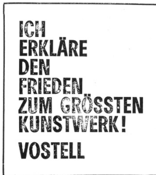
Wolf Vostell, ICH ERKLÄRE DEN FRIEDEN ZUM GRÖSSTEN KUNSTWERK! , 1979, © VG Bild Kunst, Bonn 2024 / The Wolf Vostell Estate