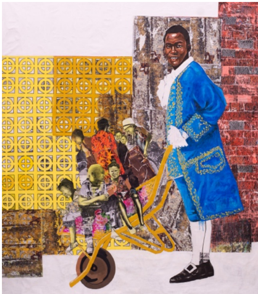
Nicholas Odhiambo Mboya, Burden of Honour I , 2024, Courtesy the artist