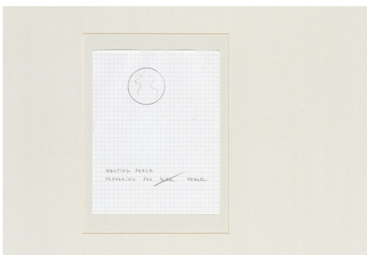
Robert Filliou, Untitled , 1985, Courtesy Edition Block, Photo: Uwe Walter