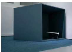
Stella Zhong CHIP2023 - Splits, 2023 Single-channel video ("Loss of coherence"), projector, acrylic, tin foil, mirror, aqua-resin, oil paint, string, mylar, wool, wood, foam, sand, epoxy, pigment, magnet, epoxy clay, wire, beads Dimensions variable Video: 6:30 Collection of Liv Barrett and Patrick Collins