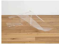
Olga Balema Loop 12, 2023 Polycarbonate sheeting, solvent 12 × 27 × 25 inches

GROUND FLOOR CLOCKWISE FROM THE ENTRANCE