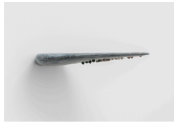
Stella Zhong Tilted Airs, 2022 string, various clays, steel mesh, sand, resin, tint, wood 11h x 6 1/2w x 2d inches Collection of Amy Adams