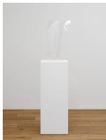
Olga Balema Loop 36, 2023 Polycarbonate sheeting, solvent 23 1/2 × 14 × 5 inches