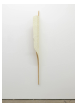
Stella Zhong Strategy to Alternate *Outside of Expected Range, 2022 mylar, paper, string, wire, various clays, plastic, oil paint, resin, fiberglass, tint, wood 78h x 13w x 8d inches