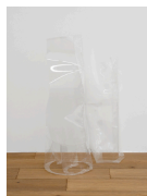
Olga Balema Loop 53, 2023 Polycarbonate sheeting, solvent 36 1/2 × 28 × 22 inches