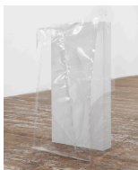
Olga Balema Loop 10010, 2023 Polycarbonate sheeting, solvent Sculpture: 55 × 31 × 21 inches