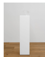
Olga Balema Loop 7, 2023 Polycarbonate sheeting, acrylic paint, solvent 7 × 9 × 10 3/4 inches