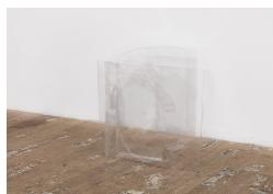
Olga Balema Loop 13735, 2023 Polycarbonate sheeting, solvent Sculpture: 22 × 24 × 23 inches