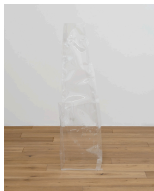
Olga Balema Loop 6, 2023 Polycarbonate sheeting, solvent 47 1/2 × 14 1/2 × 13 1/2 inches