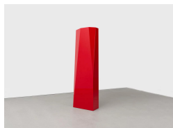
John McCracken Chieftain, 1992 Polyester resin, fiberglass, and plywood 96 1/8 × 29 7/8 × 17 inches