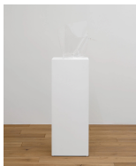
Olga Balema Loop 25, 2023 Polycarbonate sheeting, acrylic paint, solvent 17 × 15 × 13 1/2 inches