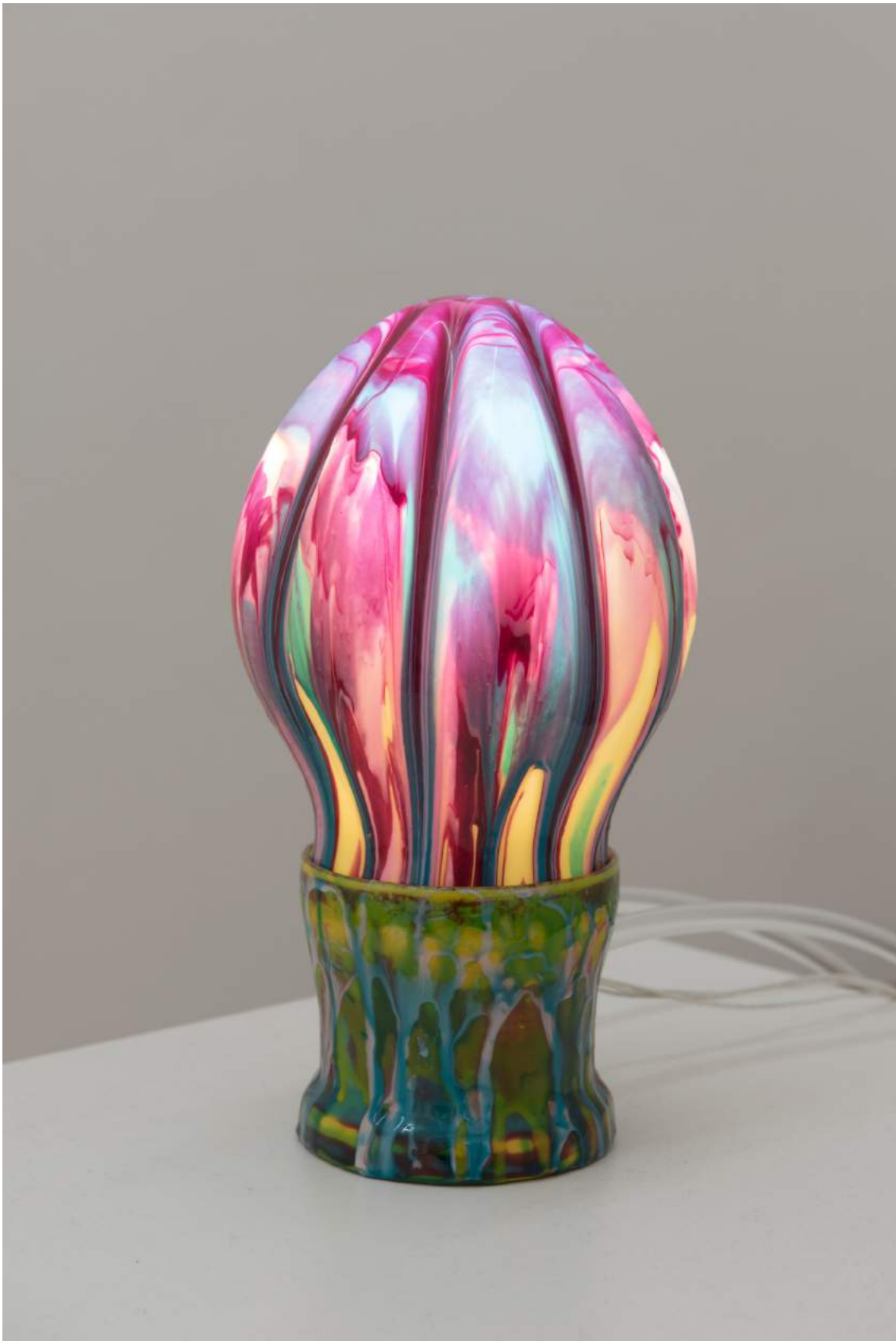
Antoine Catala Logo to First Sexual Experience (color drips) , 2018 Silicone, polyamide, LED light, pump, tubing, valves, electronics Lamp 10 x 10 x 23 cm