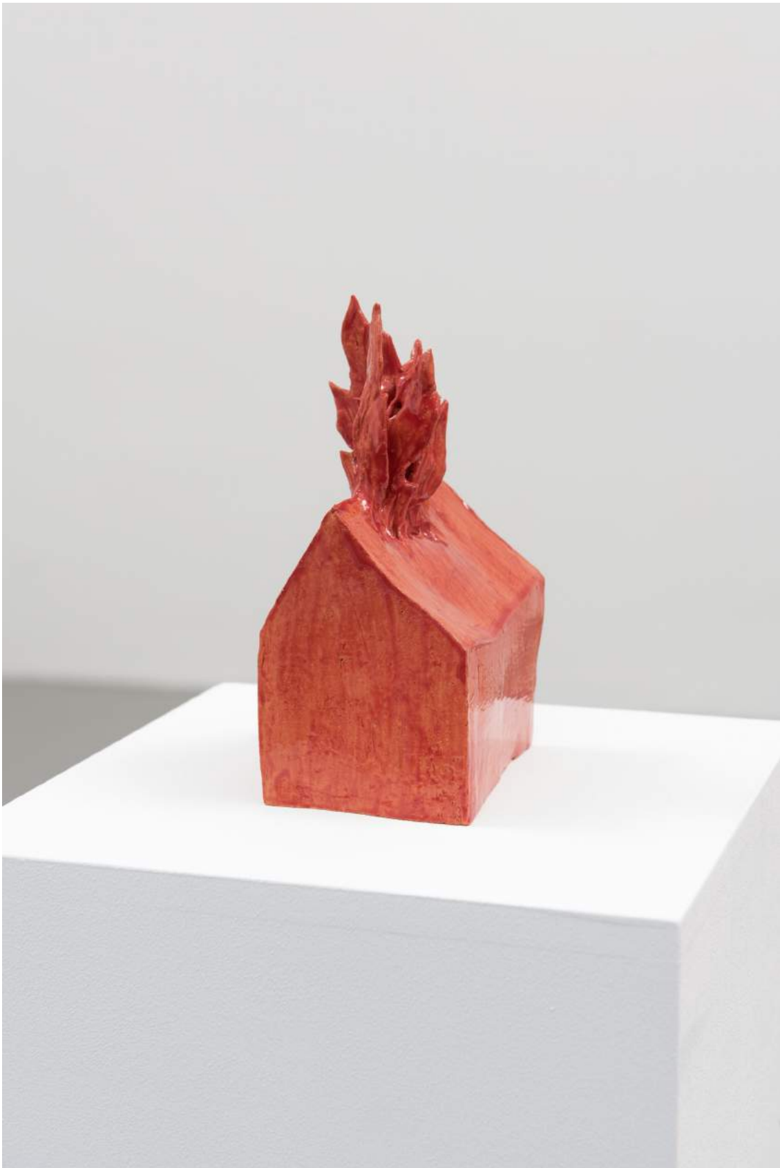
Anne Rößner Brennendes Haus , 2017 Glazed ceramic 17 x 8 x 11 cm