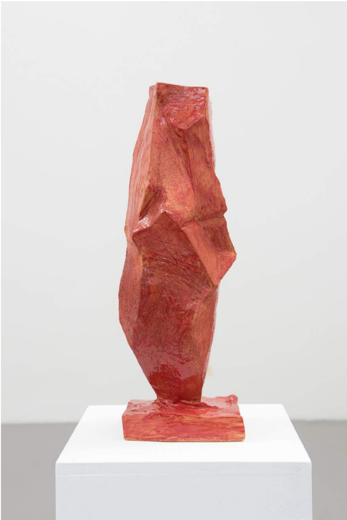
Anne Rößner Something red , 2017 Glazed ceramic 37 x 13 x 13 cm