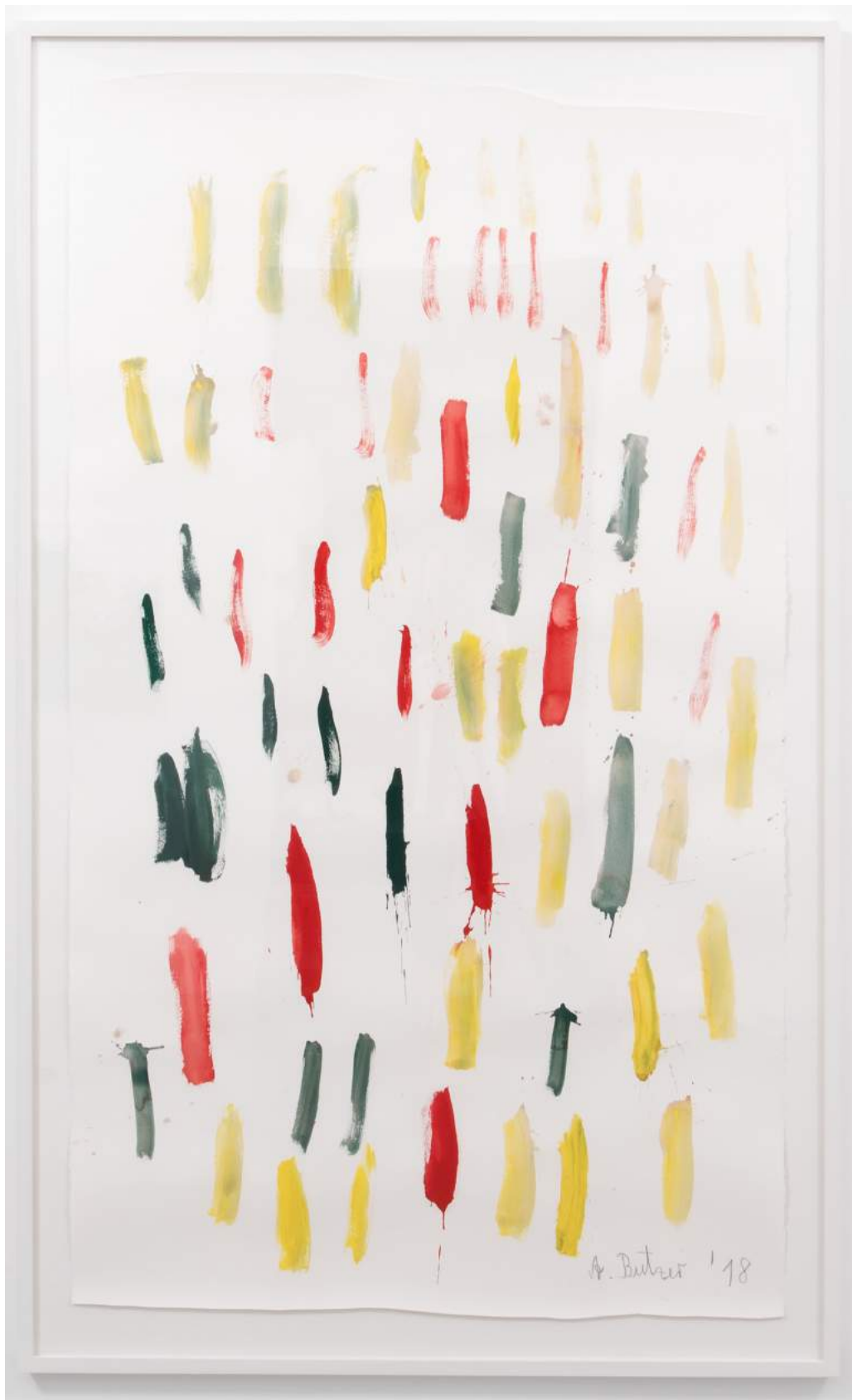
André Butzer Untitled , 2018 Watercolour on paper 195 x 114 cm