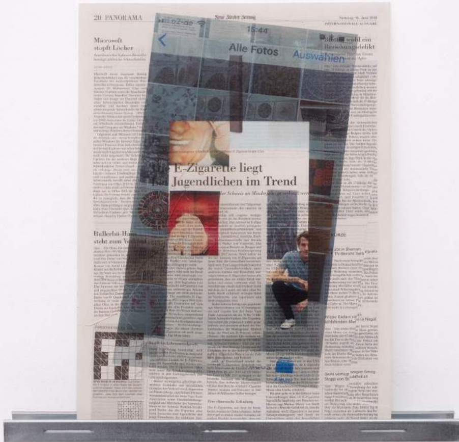
Aribert von Ostrowski Chronicles (Alle Fotos Ferdinand_E-Zigarette bei Jugendlichen im Trend) , 2018 Acrylic fixative, colour laser copy on NZZ-page on polypropylene board 49,5 x 34,5 cm