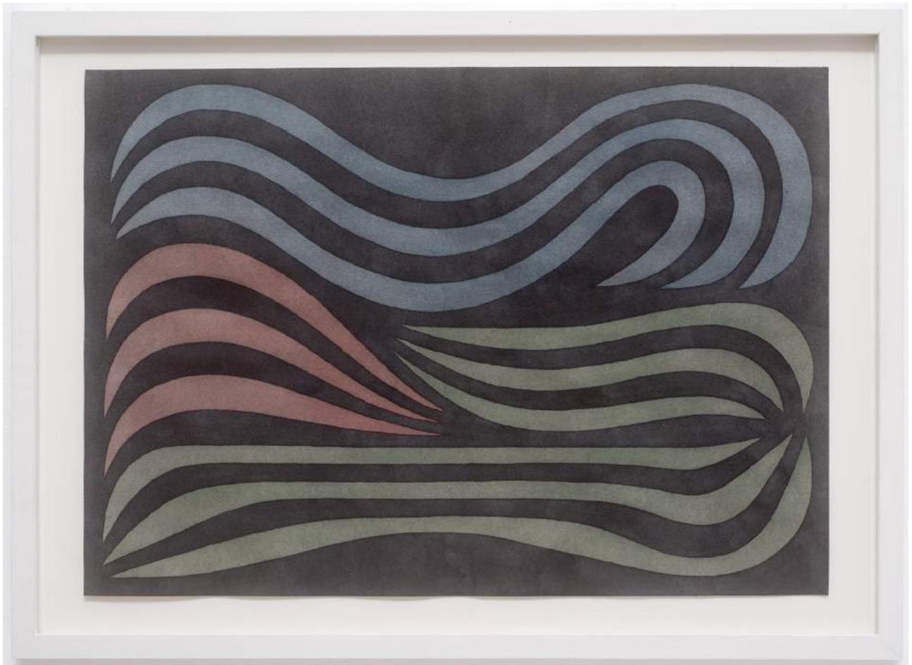
Berthold Reiß Tafel , 2018 Watercolour on paper 29,5 x 42 cm