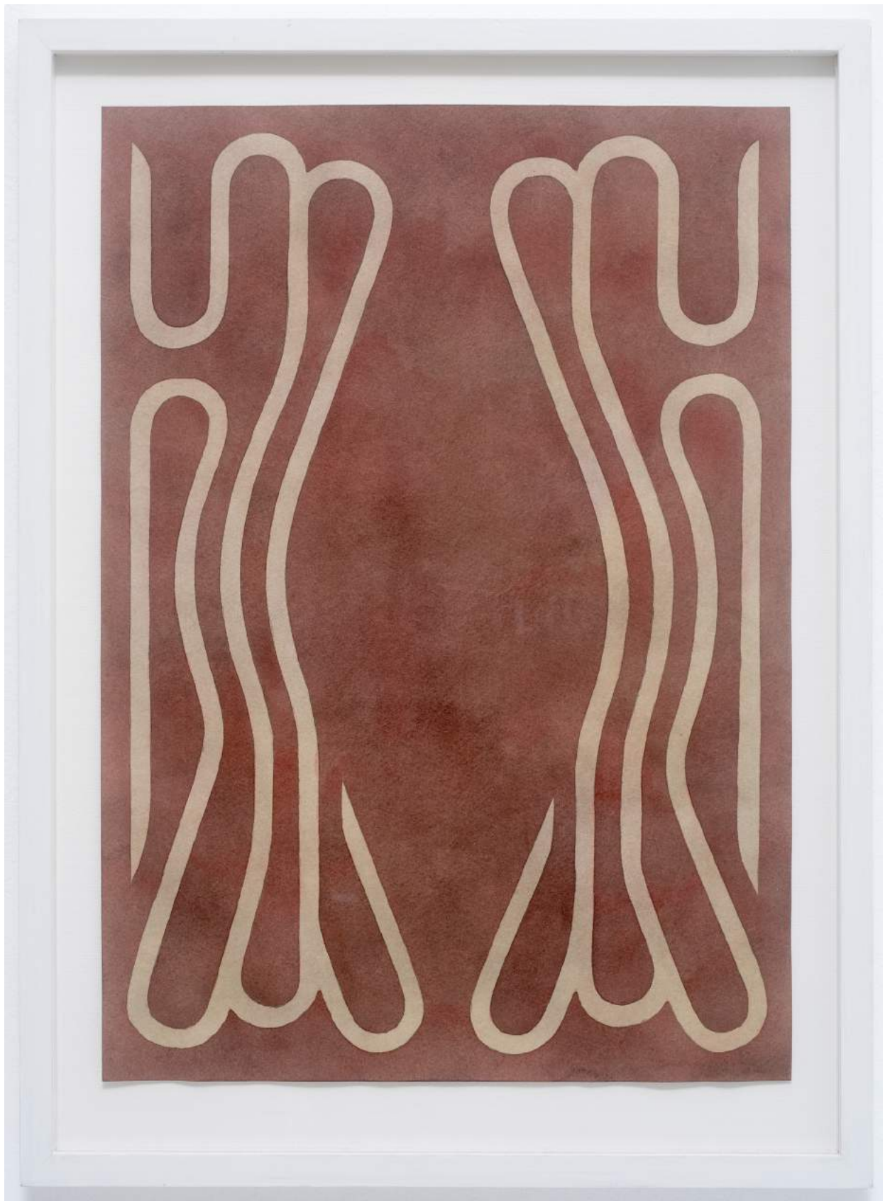
Berthold Reib Schild , 2018 Watercolour on paper 42 x 29,5 cm