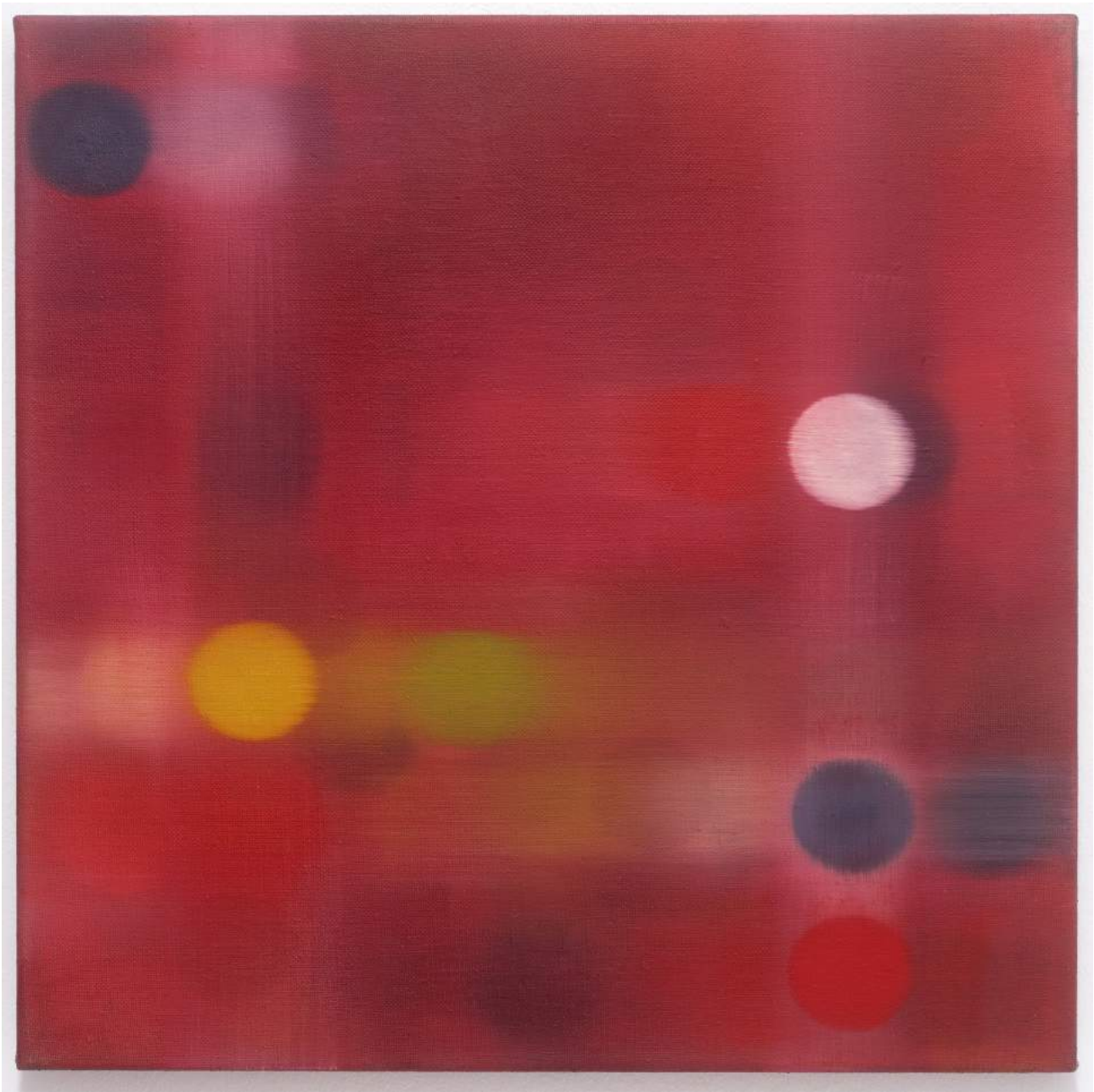
Silva Reichwein Untitled , 1999 Oil on canvas 45 x 45 cm