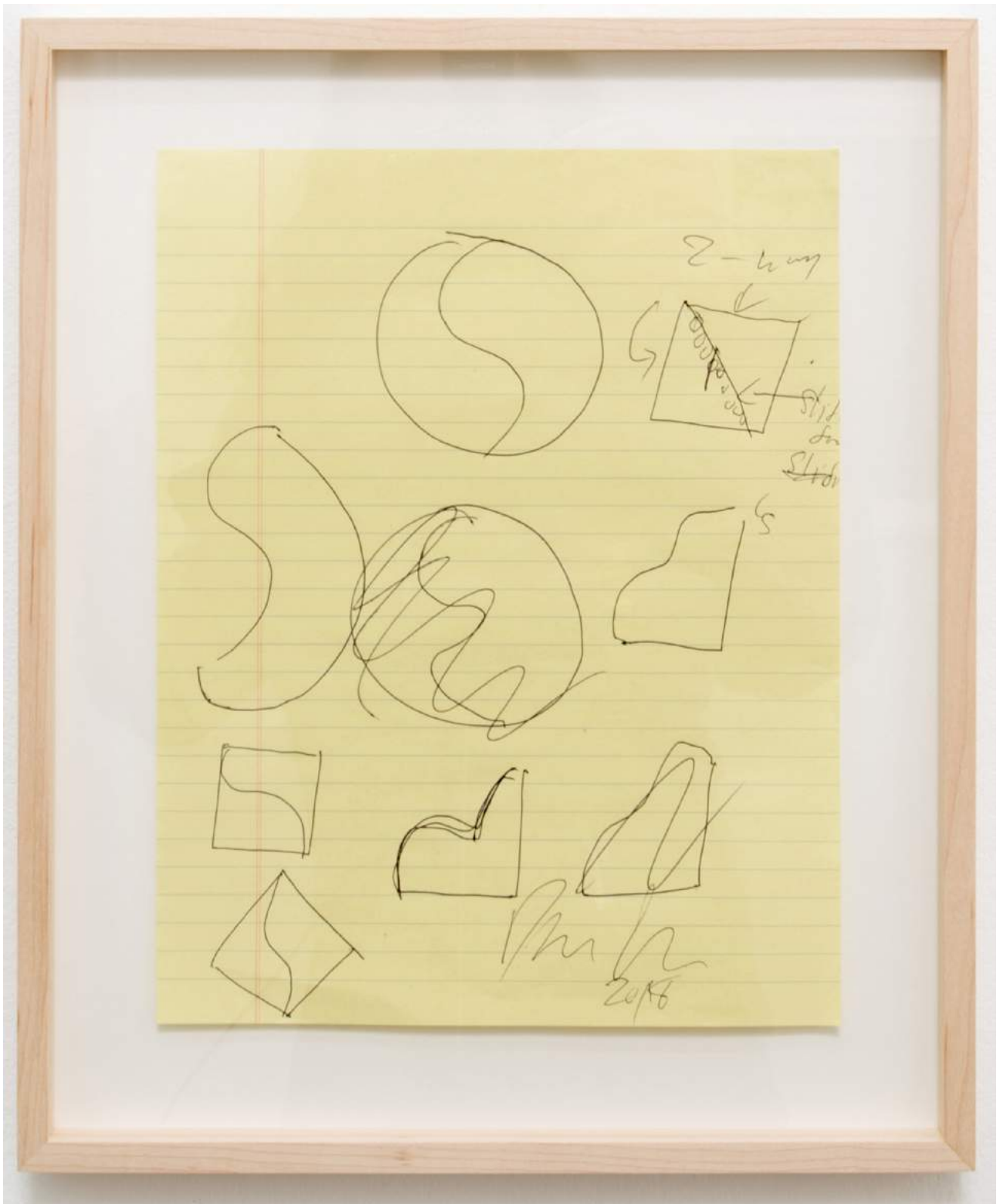
Dan Graham Untitled , 2018 Pen on paper, framed 27, 5 x 21 cm