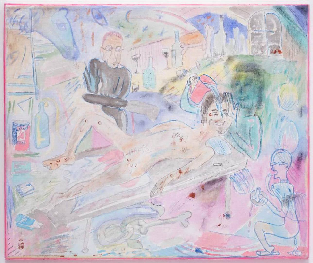
Mahlergruppe Ferne Musik , 2018 Acrylic on canvas, plexiglas frame 50 x 60 cm