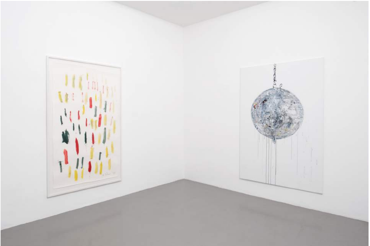
Installation view: Island of Lost Souls, Galerie Christine Mayer, 2018