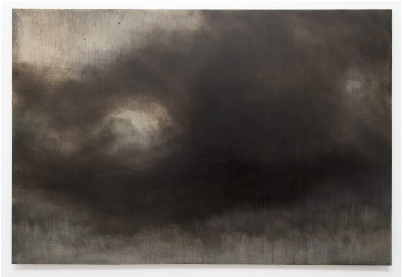
Franka Kaßner Hallo, du schöne Zukunft! , 2018 Linoleum, pigment, oil on wood 69 x 103 cm