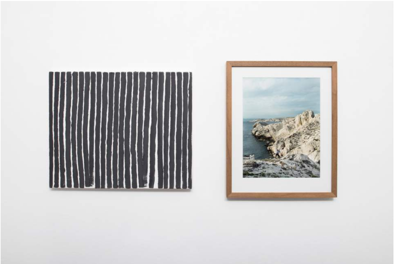
Hank Schmidt in der Beek Auf den Iles de Frioul , 2014 Acrylic on canvas 50 x 60 cm Fine art print (shot by Fabian Schubert), framed, 42,5 x 52,5 cm