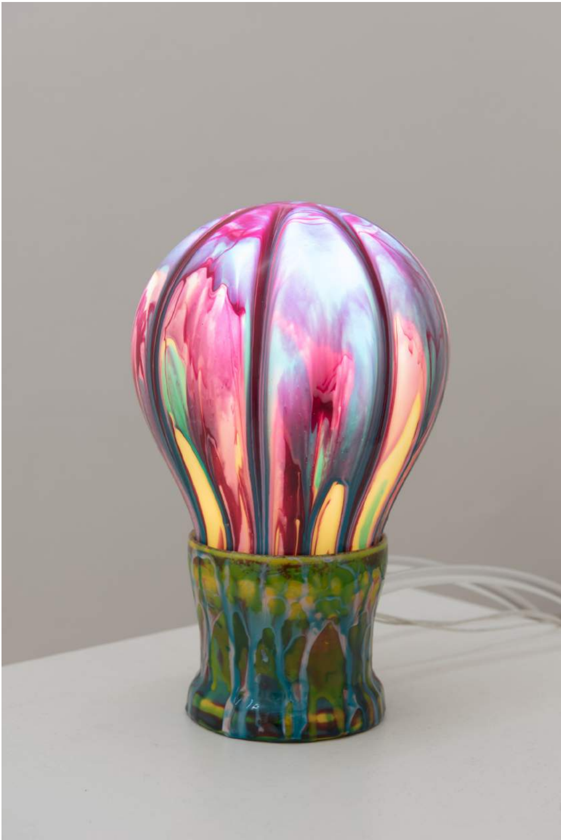
Antoine Catala Logo to First Sexual Experience (color drips) , 2018 Silicone, polyamide, LED light, pump, tubing, valves, electronics Lamp 10 x 10 x 23 cm