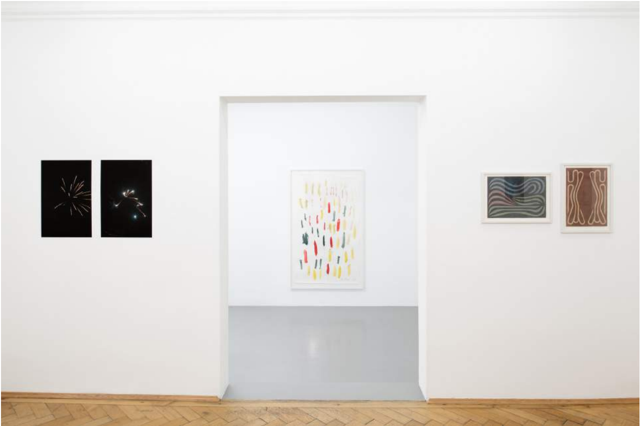
Installation view: Island of Lost Souls, Galerie Christine Mayer, 2018