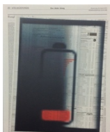
Chronicles #5, 2017 Colour laser copy on NZZ-pages on polypropylene board 49,5 x 34,5 cm