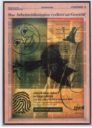
Chronicles (Das Arbeitseinkommen verliert an Gewicht) , 2017 UV-direct print on 20mm honeycomb cardboard, aluminium frame 36,2 x 51,5 x 4 cm Edition 3 + 2 AP