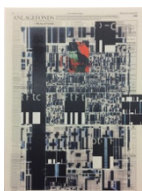
Chronicles #8, 2017 Colour laser copy on NZZ-page on polypropylene board 49,5 x 34,5 cm