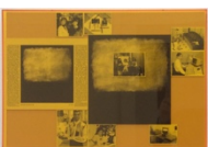
1993_(Works) , 2017 Transparent yellow acrylic glass cover on small box-object from 1993: black and white copy on finnish wooden cardboard, yellow textile-tape 30,9 x 45,5 x 8,4 cm