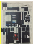
Chronicles #10, 2017 Colour laser copy on NZZ-page on polypropylene board 49,5 x 34,5 cm