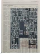
Chronicles #4, 2017 Colour laser copy on NZZ-page on polypropylene board 49,5 x 34,5 cm