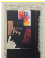
Chronicles #11, 2017 Colour laser copy on NZZ-page on polypropylene board 49,5 x 34,5 cm