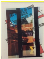
Chronicles #19, 2017 Colour laser copy on NZZ-page on polypropylene board 49,5 x 34,5 cm