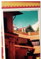
Image of a Poster, 2017

Latex print on Erfurt digital non-woven wallpaper 3 strips of wallpaper 365 x 236 cm (size variable) Multiple of 5 + 2 AP