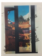
Chronicles #20, 2017 Colour laser copy on NZZ-page on polypropylene board 49,5 x 34,5 cm