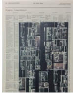
Chronicles #1, 2017 Colour laser copy on NZZ-page on polypropylene board 49,5 x 34,5 cm