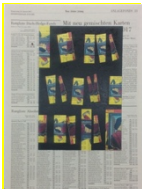
Chronicles #15, 2017 Colour laser copy on NZZ-page on polypropylene board 49,5 x 34,5 cm