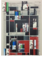
Chronicles #13, 2017 Colour laser copy on NZZ-page on polypropylene board 49,5 x 34,5 cm