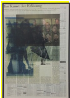
Chronicles (Die Kunst der Erlösung) , 2017 Colour laser copy on NZZ-pages on 20mm honeycomb cardboard, aluminium frame 36,5 x 51,7 x 4 cm