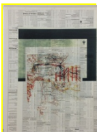
Chronicles #14, 2017 Colour laser copy on NZZ-page on polypropylene board 49,5 x 34,5 cm