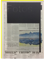
Chronicles #7, 2017 Colour laser copy on NZZ-pages on polypropylene board 49,5 x 34,5 cm