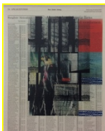
Chronicles #9, 2017 Colour laser copy on NZZ-page on polypropylene board 49,5 x 34,5 cm