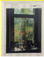
Chronicles #12, 2017 Colour laser copy on NZZ-page on polypropylene board 49,5 x 34,5 cm