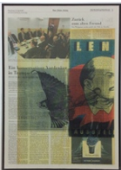
Chronicles (Zurück zum alten Freund) , 2017 Colour laser copy on NZZ-page on 20mm honeycomb cardboard, aluminium frame 36,5 x 51,5 x 4 cm