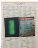
Chronicles #6, 2017 Colour laser copy on NZZ-pages on polypropylene board 49,5 x 34,5 cm