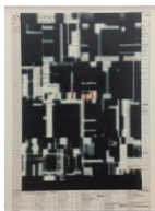
Chronicles #18, 2017 Colour laser copy on NZZ-page on polypropylene board 49,5 x 34,5 cm