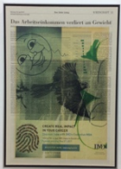
Chronicles (Das Arbeitseinkommen verliert an Gewicht) , 2017 Colour laser copy on NZZ-page on 20mm honeycomb cardboard, aluminium frame 36,2 x 51,6 x 4 cm