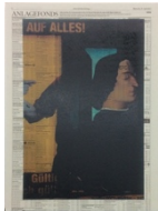
Chronicles #16, 2017 Colour laser copy on NZZ-page on polypropylene board 49,5 x 34,5 cm