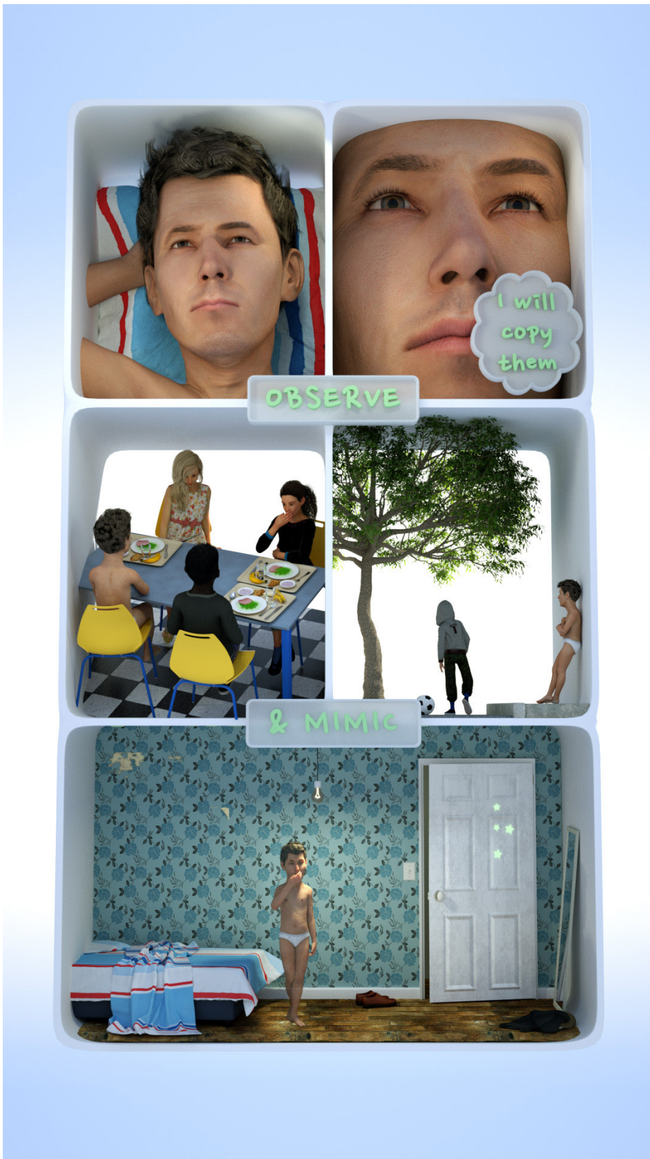
Observe and Mimic , 2017 TV, scrunchie, USB key Video, color, silent 1 min loop 124 x 72 x 4 cm Edition 3 + 1 closed Edition + 2 AP