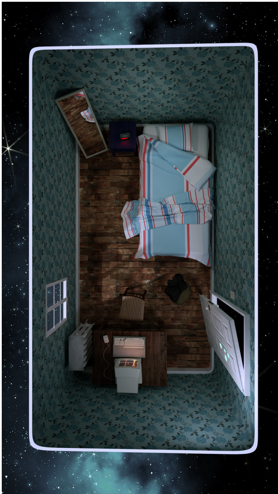
Bedroom , 2017 TV, scrunchie, USB key Video, color, silent 30s loop 124 x 72 x 4 cm Edition 3 + 1 closed Edition + 2 AP