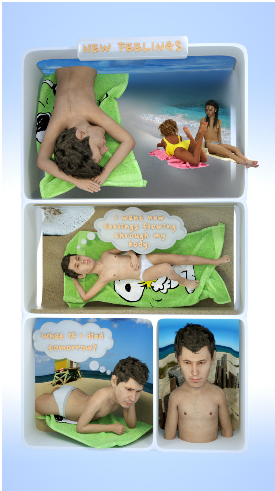
New Feelings , 2017 TV, scrunchie, USB key Video, color, silent 30s loop 124 x 72 x 4 cm Edition 3 + 1 closed Edition + 2 AP