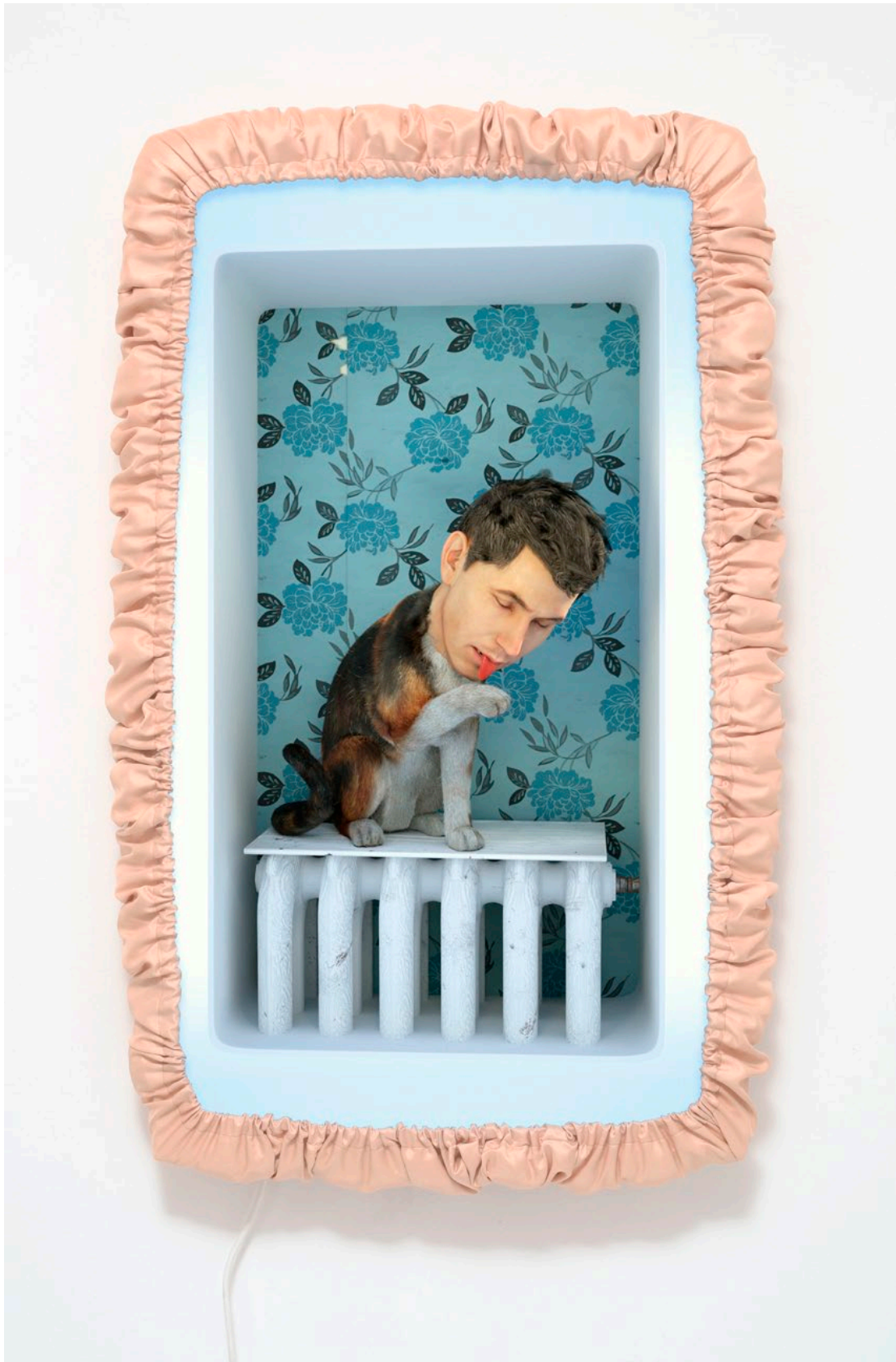
Installation view: Cat-ala , Theory of Mind, Galerie Christine Mayer, 2017