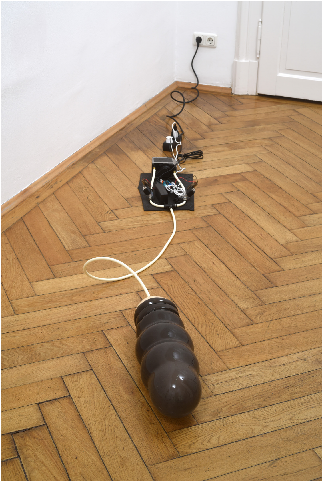
Logo to Our Repressions, 2017