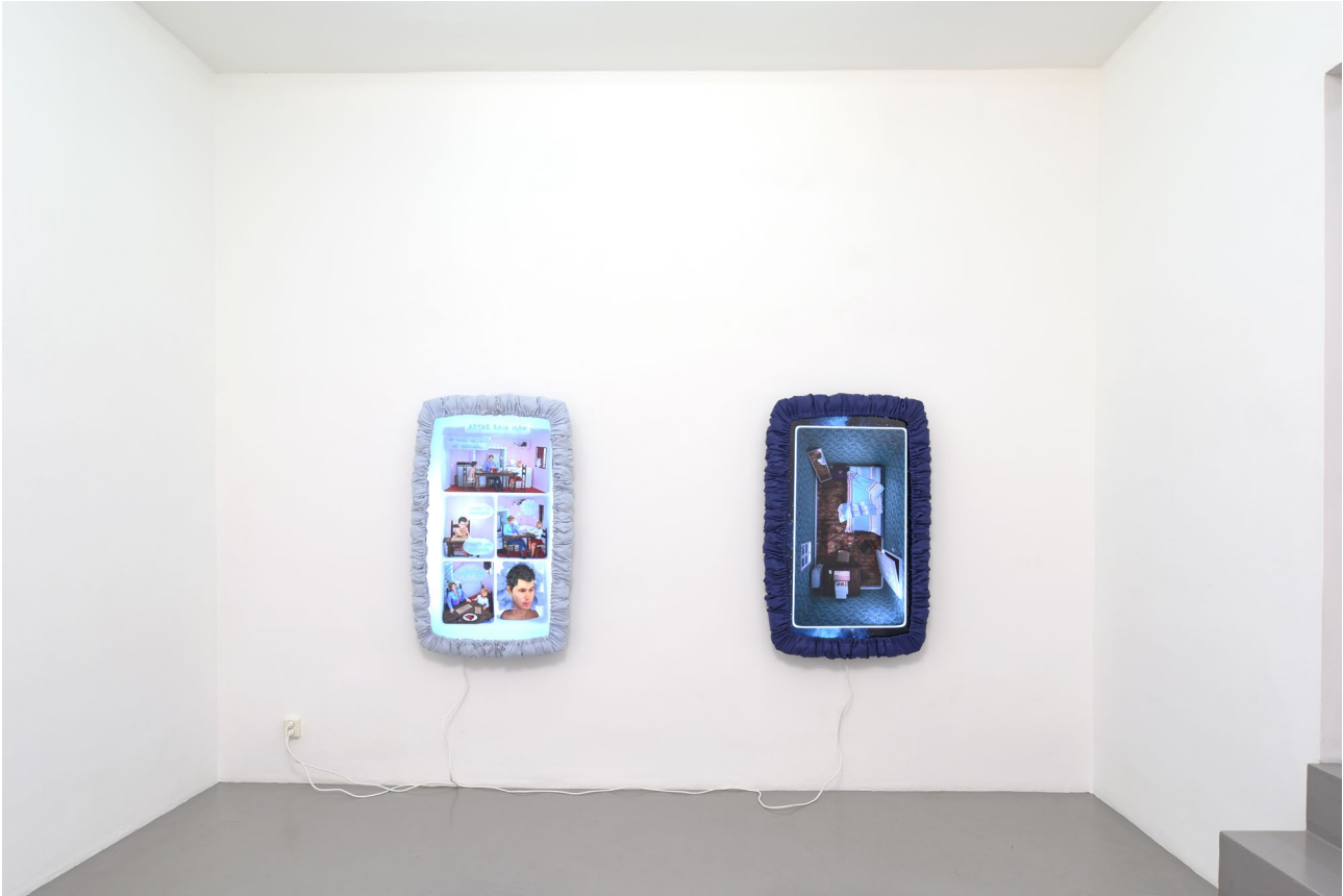
Installation view: Theory of Mind, Galerie Christine Mayer, 2017