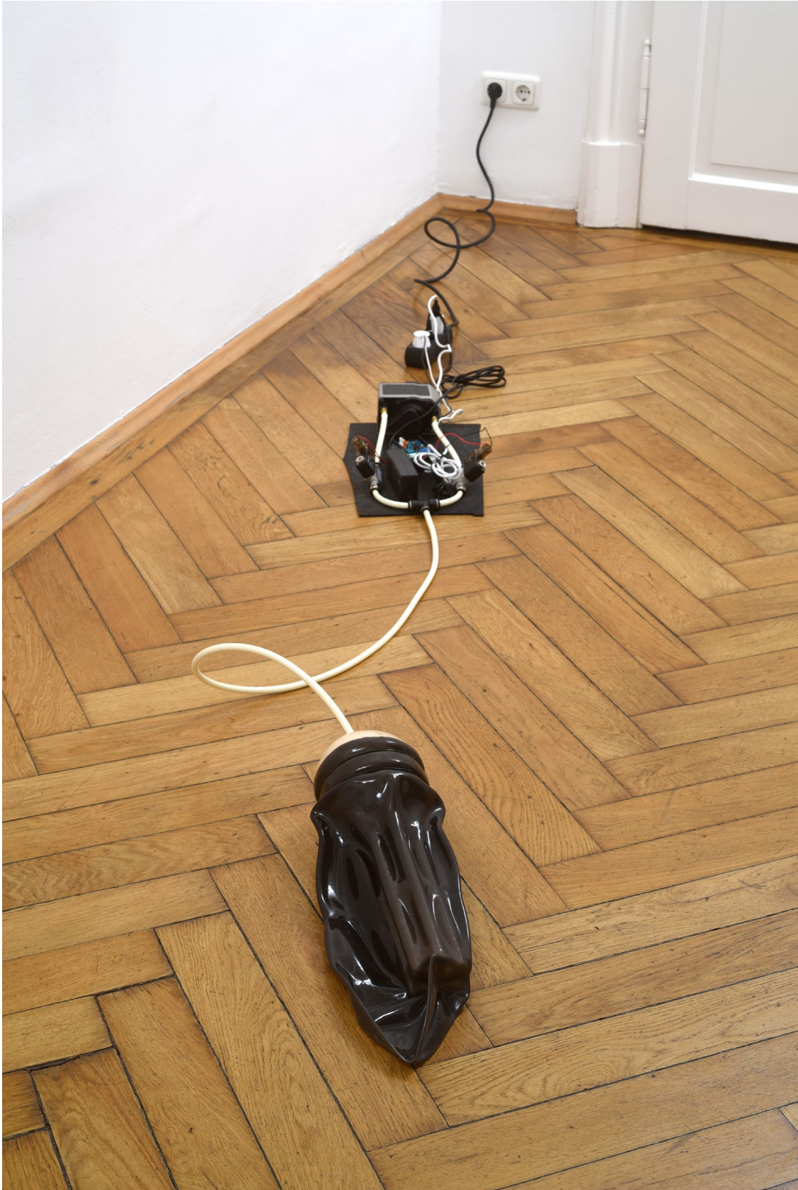
Logo to Our Repressions, 2017 Silicone, foam coated in epoxy, pump, tubing, valves, electronics 43 x 15 x 15 cm