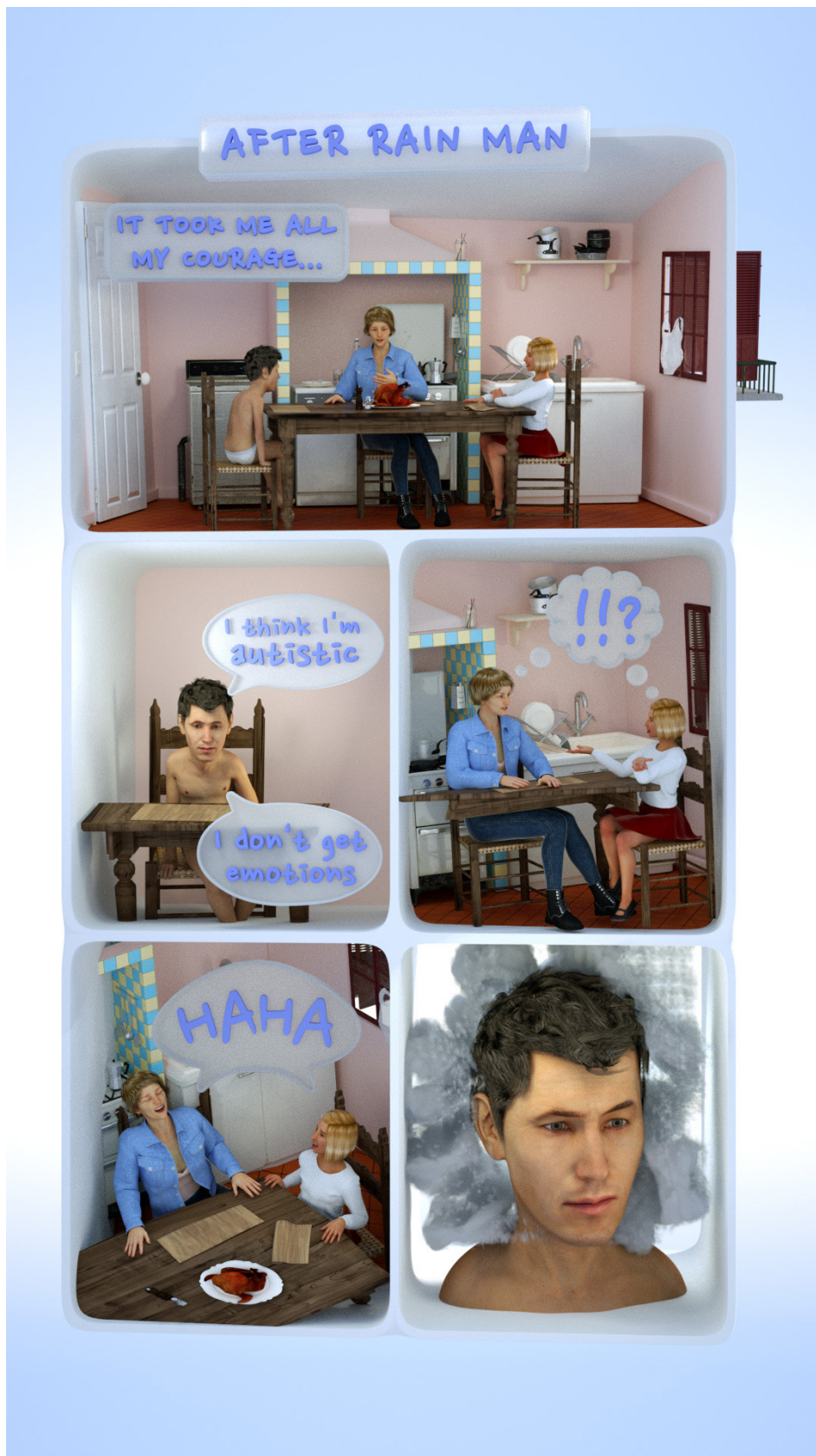
After Rain Man, 2017 TV, scrunchie, USB key Video, color, silent 30s loop 124 x 72 x 4 cm Edition 3 + 1 closed Edition + 2 AP