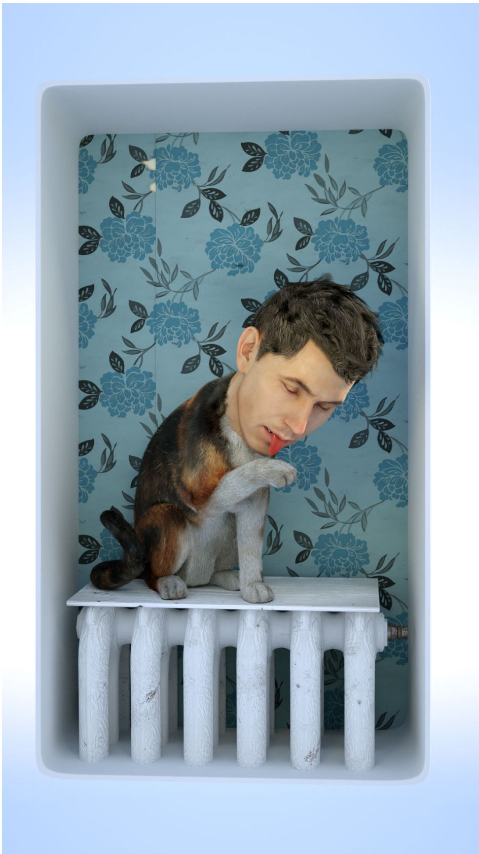
Cat-ala , 2017 TV, scrunchie, USB key Video, color, silent 30s loop 124 x 72 x 4 cm Edition 3 + 1 closed Edition + 2 AP