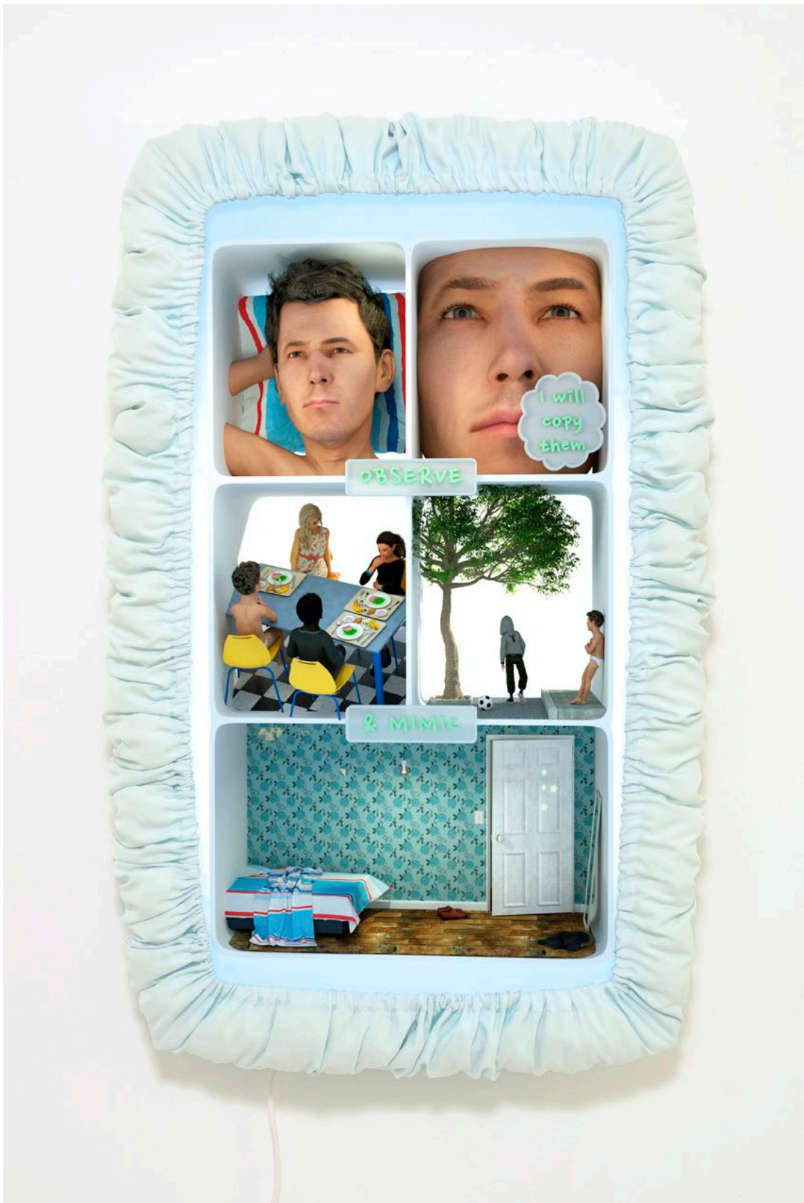
Installation view: Observe and Mimic , Theory of Mind, Galerie Christine Mayer, 2017