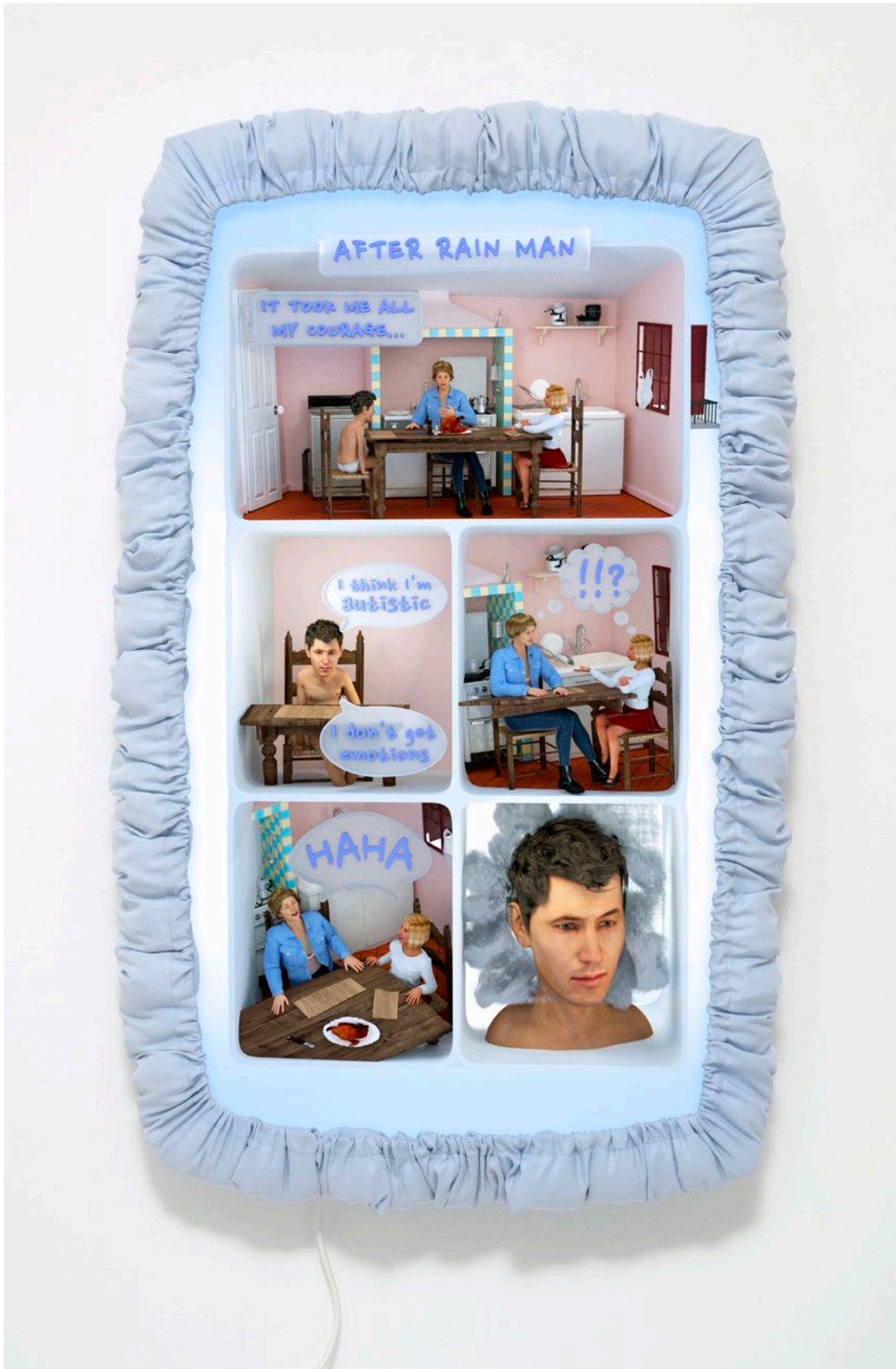
Installation view: After Rain Man , Theory of Mind, Galerie Christine Mayer, 2017