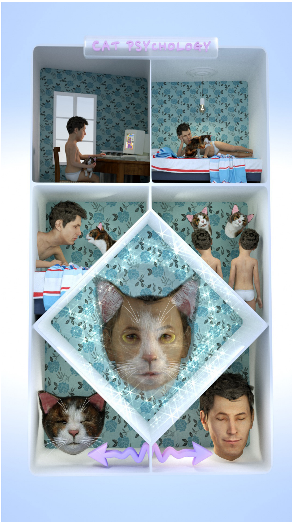
Cat Psychology , 2017 TV, scrunchie, USB key Video, color, silent 1 min loop 124 x 72 x 4 cm Edition 3 + 1 closed Edition + 2 AP