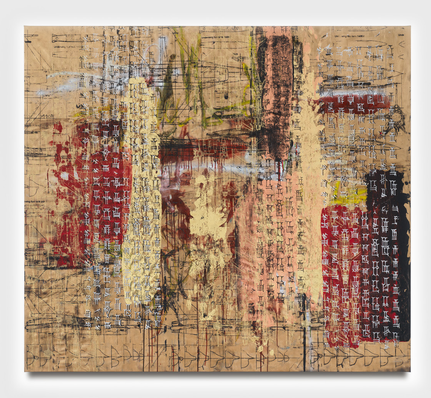
Gold 2024 Oil paint, acrylic spray and screen print on canvas 70.86 x 78.75 inches 180 x 200 cm (LY 24/013)