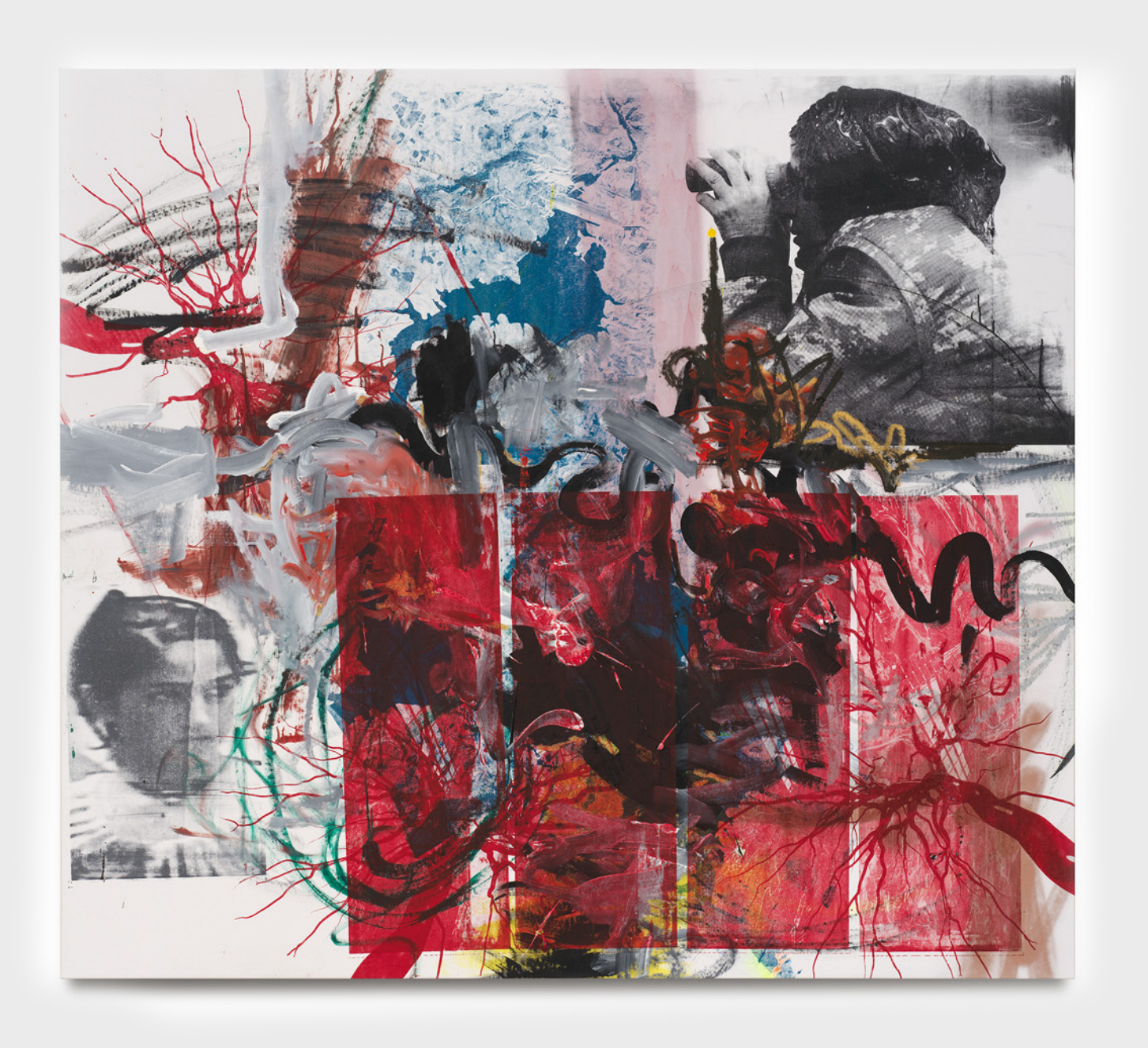
Tigris 2024 Oil paint, acrylic spray and screen print on canvas 70.86 x 78.75 inches 180 x 200 cm (LY 24/005)