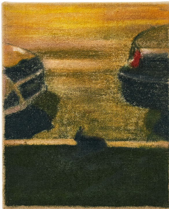
Lukas Müller, Ohne Titel , 2024 Soft pastel on linen 40 x 30 cm