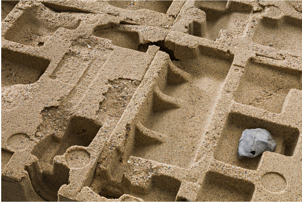
Dennis Siering, Archaeologies of Waste , 2022-23 Single Channel HD Videos, Sand, epoxy resin, microplastics, pyroplastics (Polyethylene, Polypropylene), Dimensions variable © Dennis Siering, Photo: Ivan Murzin