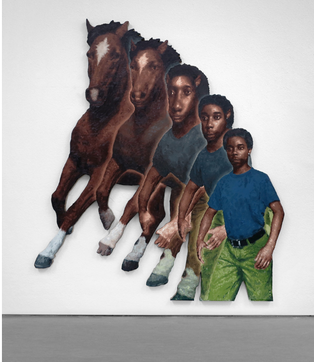
Shaun Motsi, Tell Me, We Both Matter, Don't We? , 2021, oil on linen, shaped canvas, 180 x 160 cm