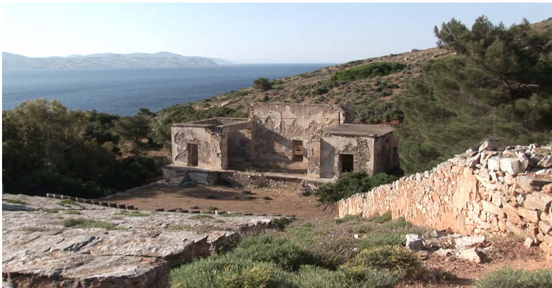
Franziska Wildt, Antigoneproben , edited version 2024, video installation, film still