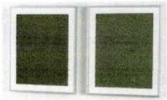
Liz Deschenes Photograph #22, 2004 Gelatin silver photogram 19 x 15 in. (frame) Obj. 198965