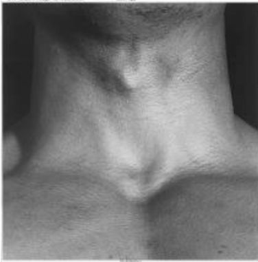
Robert Mapplethorpe Neck , 1988, Gelatin silver print 60 x 50 cm (23 5/8 x 19 11/16 in) Gift of Boardroom, Inc. 1992.714