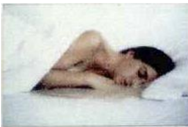
Jeanne Dunning Puddle 2 , 1997 Cibachrome mounted to Plexiglas and frame 73.6 x 108.6 cm (29 x 42 3/4 in) Jacob and Bessie Levy Art Encouragement Fund 1999.298