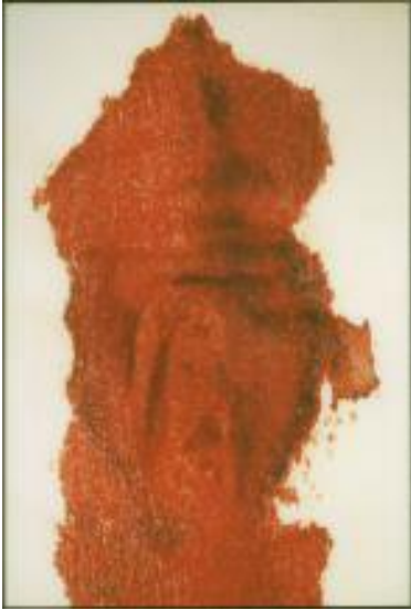
Andres Serrano Red River #3 , 1989 Silver dye-bleached print 115 x 83 x 1.5 cm (45 5/16 x 32 11/16 x 5/8 in.) Gift of Boardroom, Inc. 1992.714