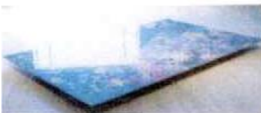
Adrian Schiess Malerei , 2006 Digital inkjet print and rainbow lacquer on aluminum 200 x 300 cm (78 3/4 x 118 7/64 in) Collection of the Indianapolis Museum of Art 92.2009