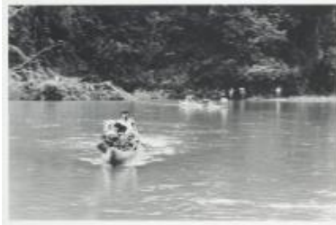
Lothar Baumgarten Yanomami , 1979 Gelatin silver print 50.8 x 60.8 cm (21 31/32 x 23 15/16 in) Gift of David C. Sarajejan Ruttenberg 1999.407