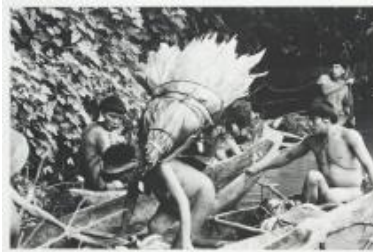
Lothar Baumgarten Yanomami , 1979 Gelatin silver print 50.8 x 60.8 cm (21 31/32 x 23 15/16 in) Gift of David C. Sarajejan Ruttenberg 1999.406