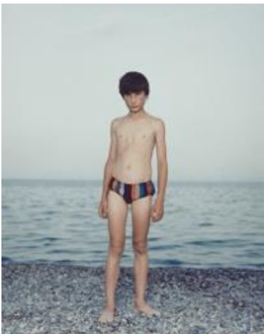
Rineke Dijkstra "Jalta Ukraine, July 29, 1993" Chromogenic print from an edition of six with two artist's proofs 162 x 136 cm (63 13/16 x 53 9/16 in.); 168 x 141 x 4.2 cm (66 3/16 x 55 9/16 x 1 11/16 in.) framed Gift of LaSalle Bank 2003.89.10