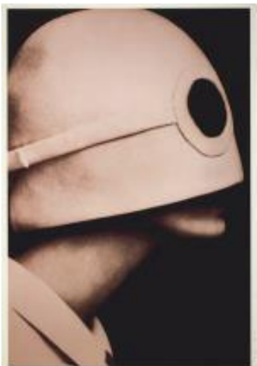
Richard Prince American Untitled (Fashion Helmet) , 1982 Chromogenic print 60.9 x 50.8 cm (24 x 20 in) Gift of Boardroom, Inc. 1992.708