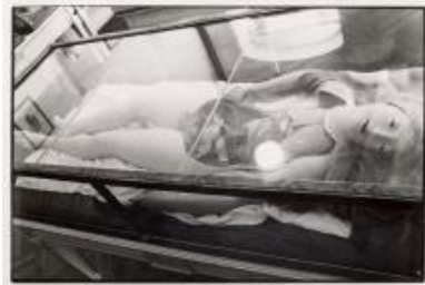
Zoe Leonard Wax Anatomical Model with Pretty Face , 1990 Gelatin silver print, Edition of 6/6 71.1 x 104.1 cm (28 x 41 in.) Claire and Gordon Prussian Fund for Contemporary Art 2006.174