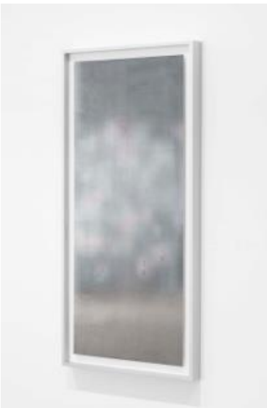
Liz Deschenes Horizontal/Vertical Photograph #1 , 2009 gelatin silver photogram 46.5 x 106 cm (18 5/16 x 41 3/4 in) Restricted gift of Robin and Sandy Stuart 2009.131