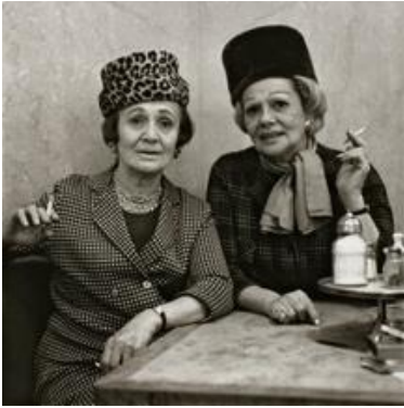
Diane Adams Two Ladies at the Automat (New York City) , 1966 stabilized chromogenic print, with paper, printed 1977 Gelatin silver print, printed by Neil Selkirk 50.5 x 40.5 cm (19 15/16 x 16 in) Gift of Theodore Collyer 1981.557