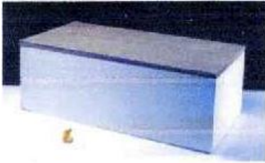
Heimo Zobernig Untitled , 1998 Four Benches Styrofoam and carpet 60.9 x 121.9 x 60.9 cm (24 x 48 x 24 in) each Courtesy of the Renaissance Society 95.2009