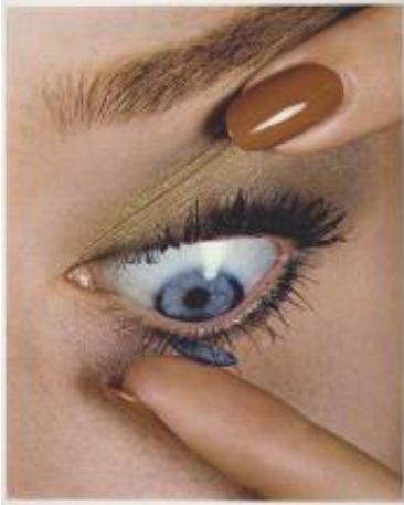
Irving Penn American Contact Lens, New York, 1981 Dye imbibition print, printed 1984 57.8 x 47.4 cm (22 13/16 x 18 11/16 in) Gift of Irving Penn 1996.247