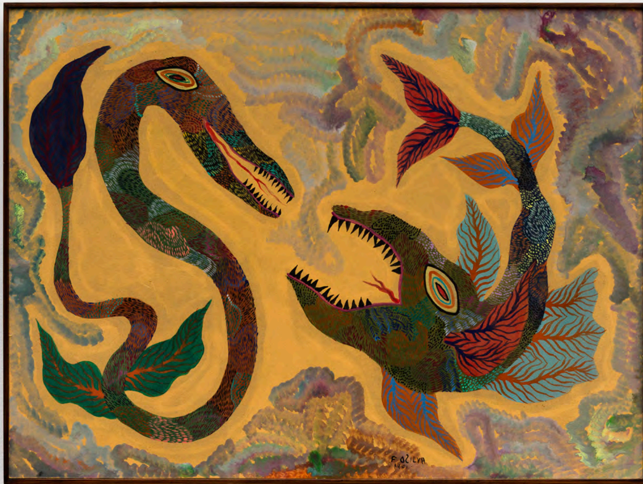
Chico da Silva, Fishes , 1966, gouache on cardstock mounted on hardboard, 56 x 77 cm | 22 x 30 1/4 in, MW.CDS.024