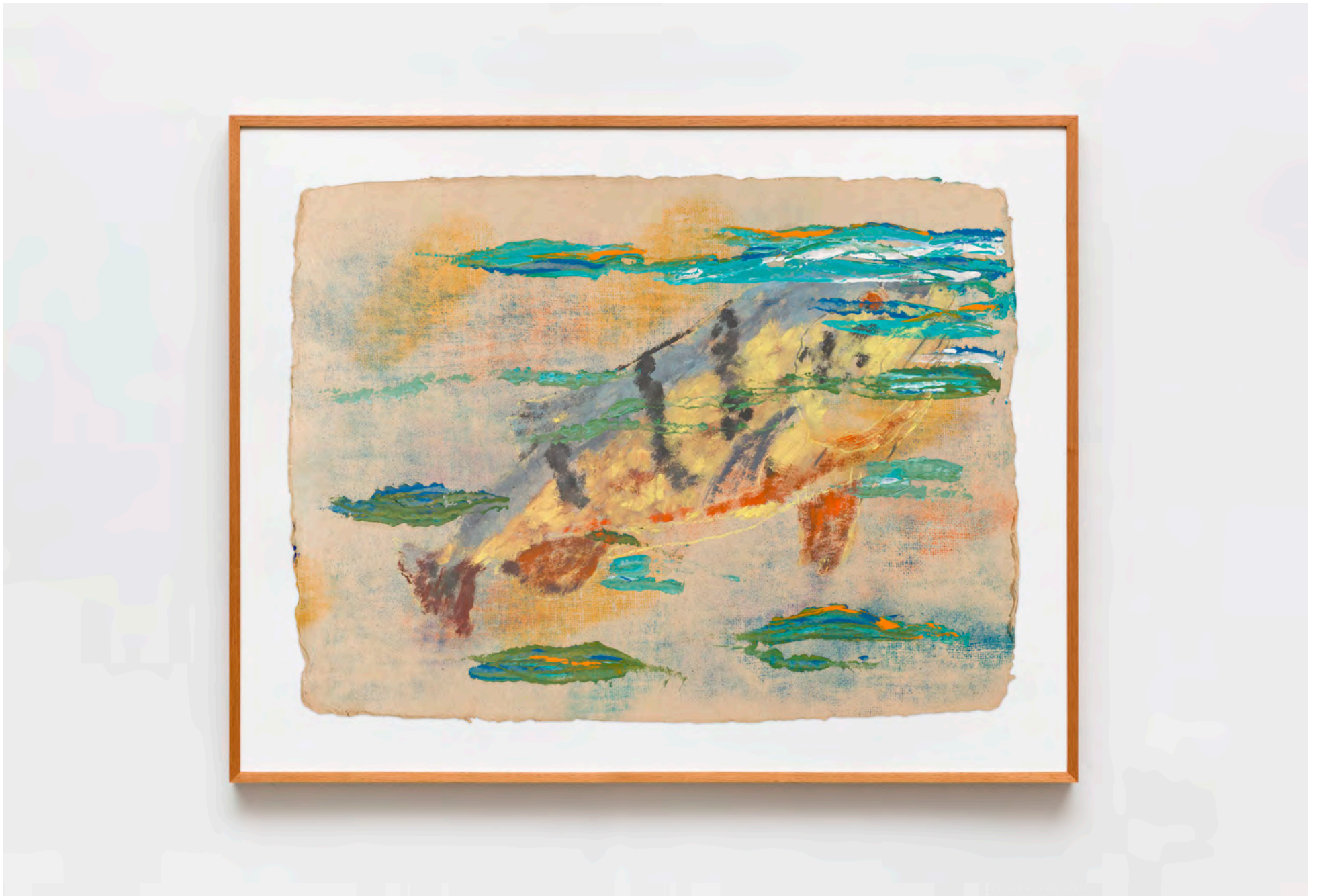
Alvaro Barrington, Fisherman Cove, 4, Paris, Oct 2024, 2024 , acrylic and oil on paper, 61 x 81 cm | 24 x 31 7/8 in, MW.ABA.073