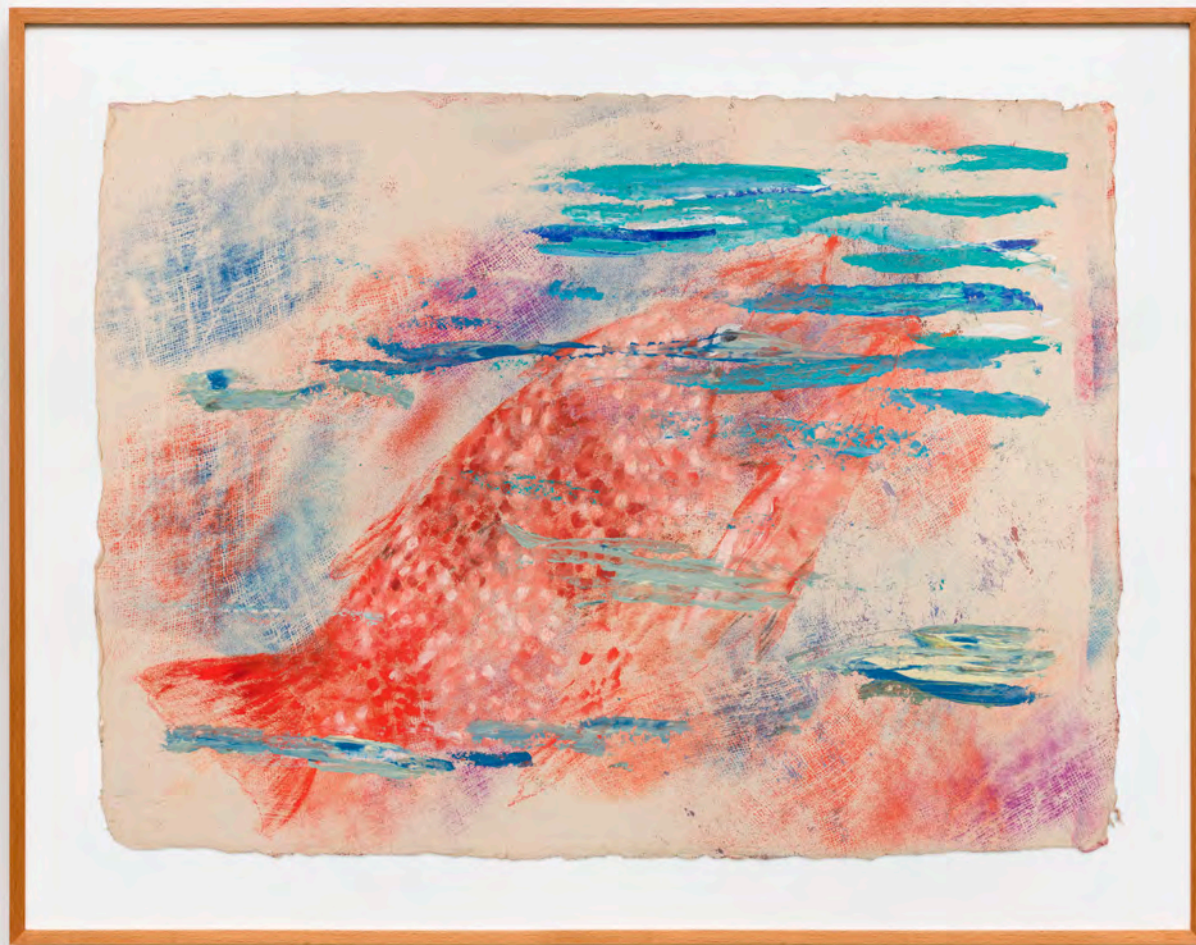
Alvaro Barrington, Fisherman Cove, 1, Paris, Oct 2024 , 2024, acrylic and oil on paper, 60 x 80 cm | 23 5/8 x 31 1/2 in, MW.ABA.069