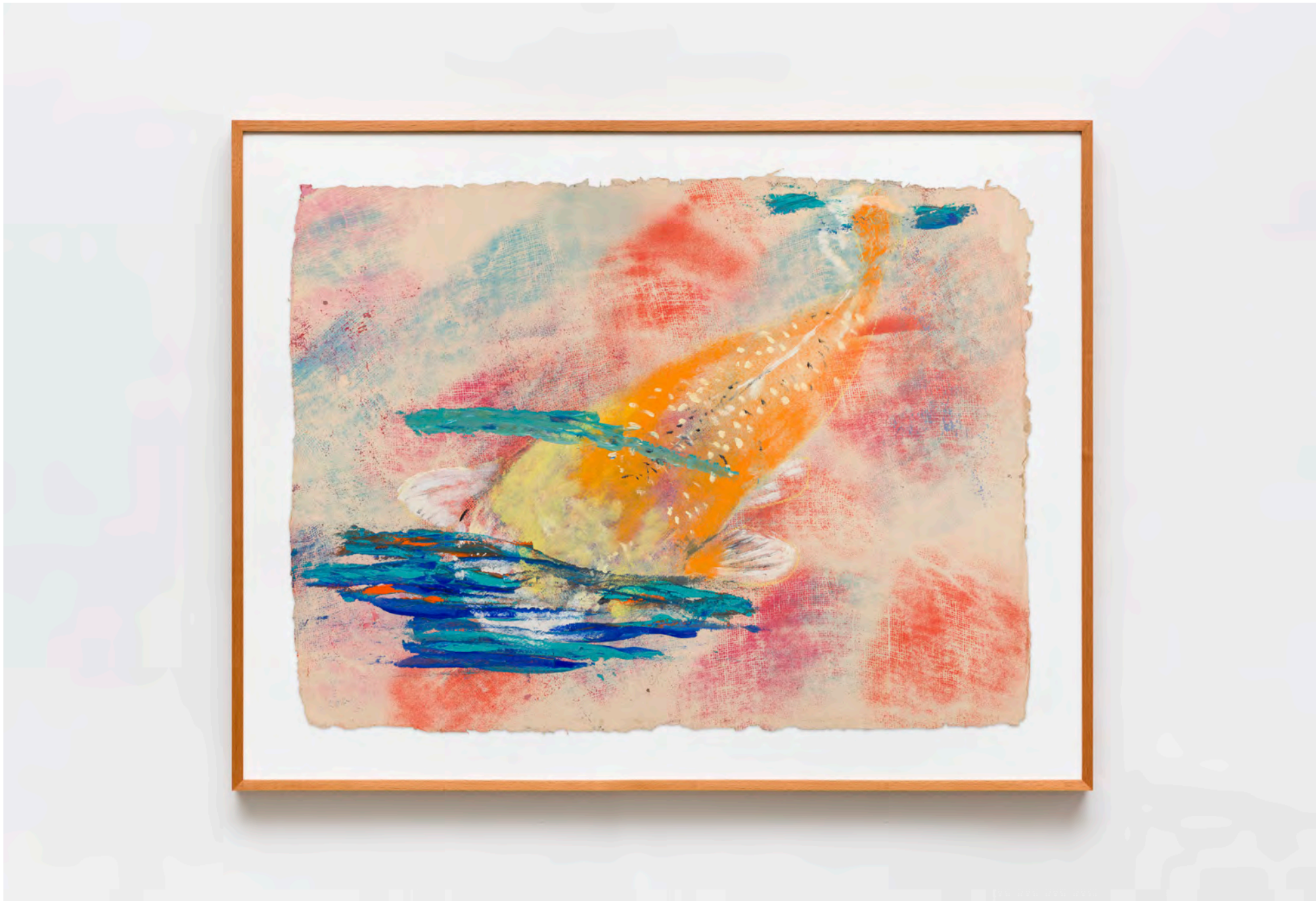
Alvaro Barrington, Fisherman Cove, 2, Paris, Oct 2024 , 2024, acrylic and oil on paper, 59.5 x 80 cm | 23 3/8 x 31 1/2 in, MW.ABA.072