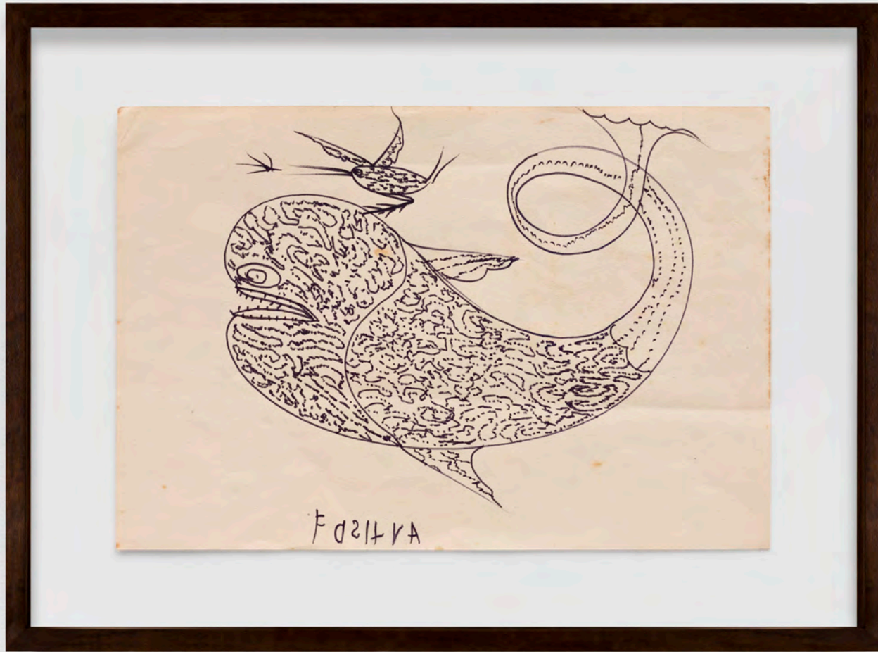
Chico da Silva, Untitled , n.d., marker on paper, 22 x 32.5 cm | 8 5/8 x 12 3/4 in, MW.CDS.038