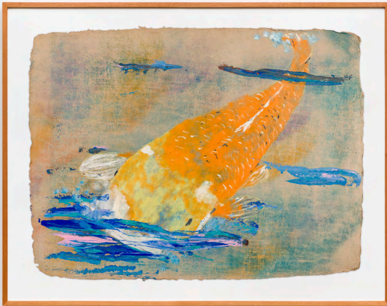
Alvaro Barrington, Fisherman Cove, 5, Paris, Oct 2024 , 2024, acrylic and oil on paper, 60.5 x 80 cm | 23 7/8 x 31 1/2 in, MW.ABA.071