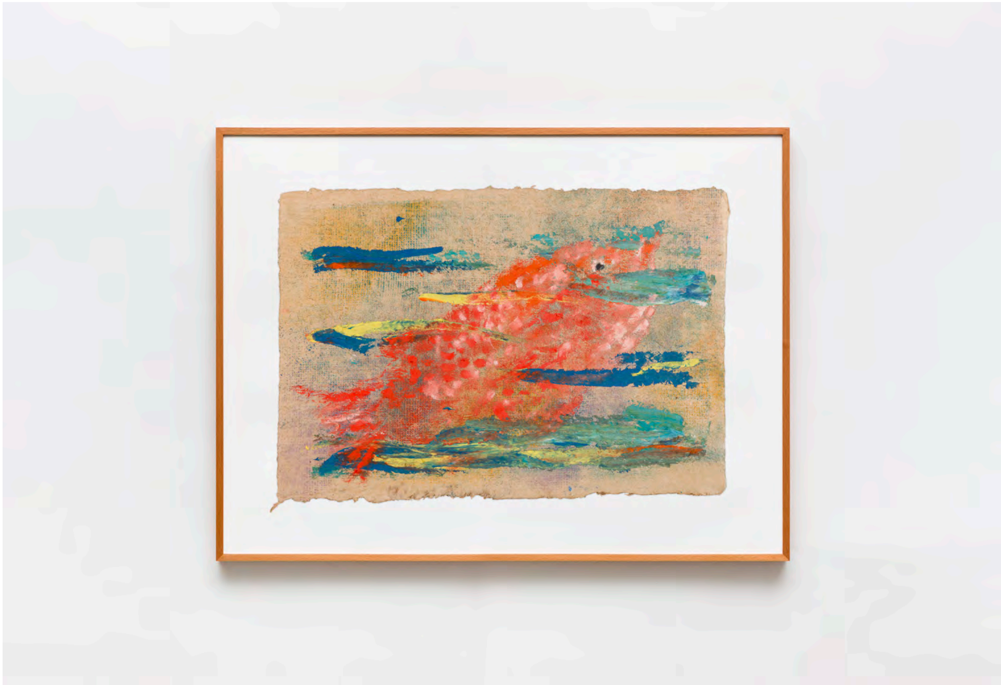
Alvaro Barrington, Fisherman Cove, 3, Paris, Oct 2024, 2024 , acrylic and oil on paper, 32 x 46 cm | 12 5/8 x 18 1/8 in, MW.ABA.070