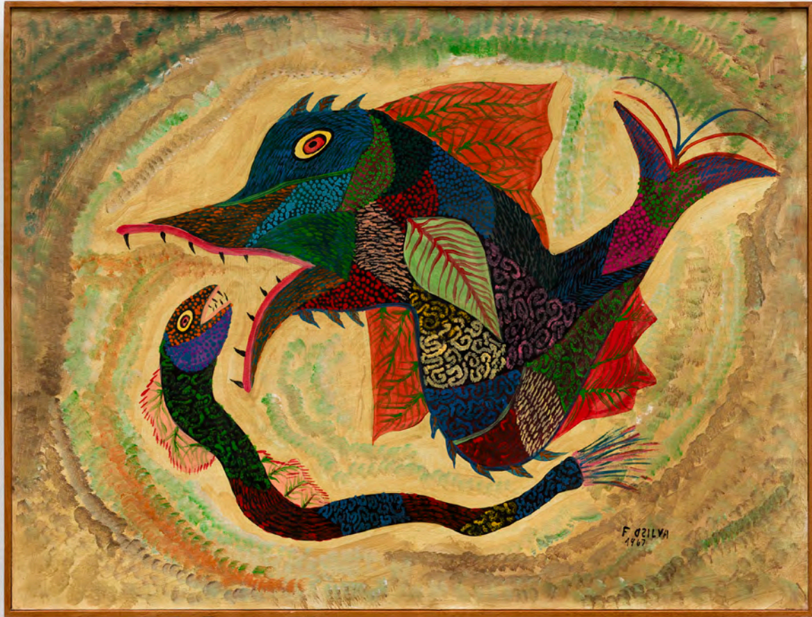
Chico da Silva, Untitled , 1967, gouache on cardstock, 50 x 66 cm | 19 3/4 x 26 in, MW.CDS.025