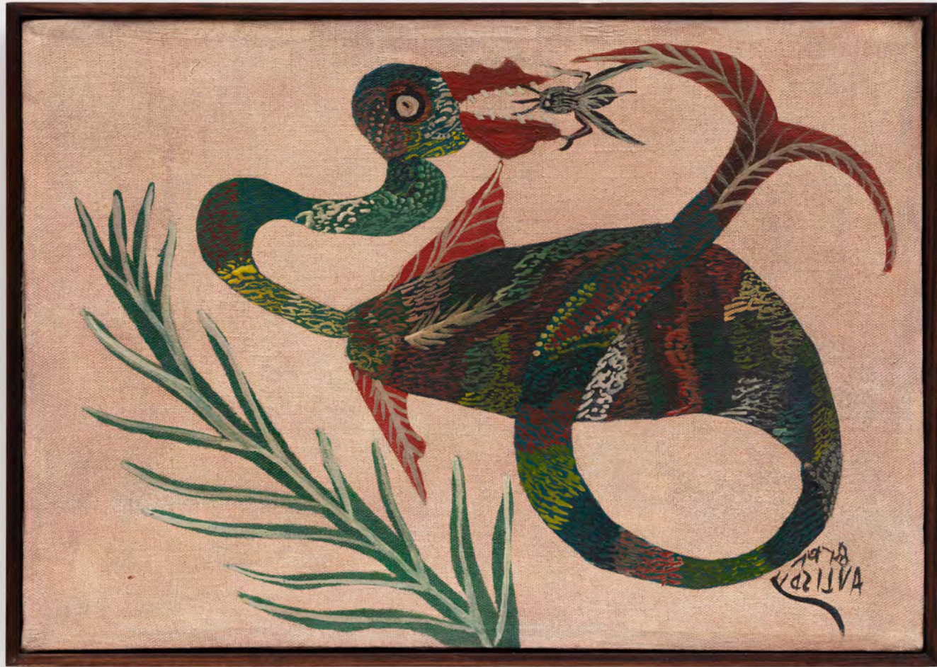
Chico da Silva, Untitled , 1978, oil and gouache on canvas, 31 x 44 cm | 12 1/4 x 17 3/8 in, MW.CDS.023