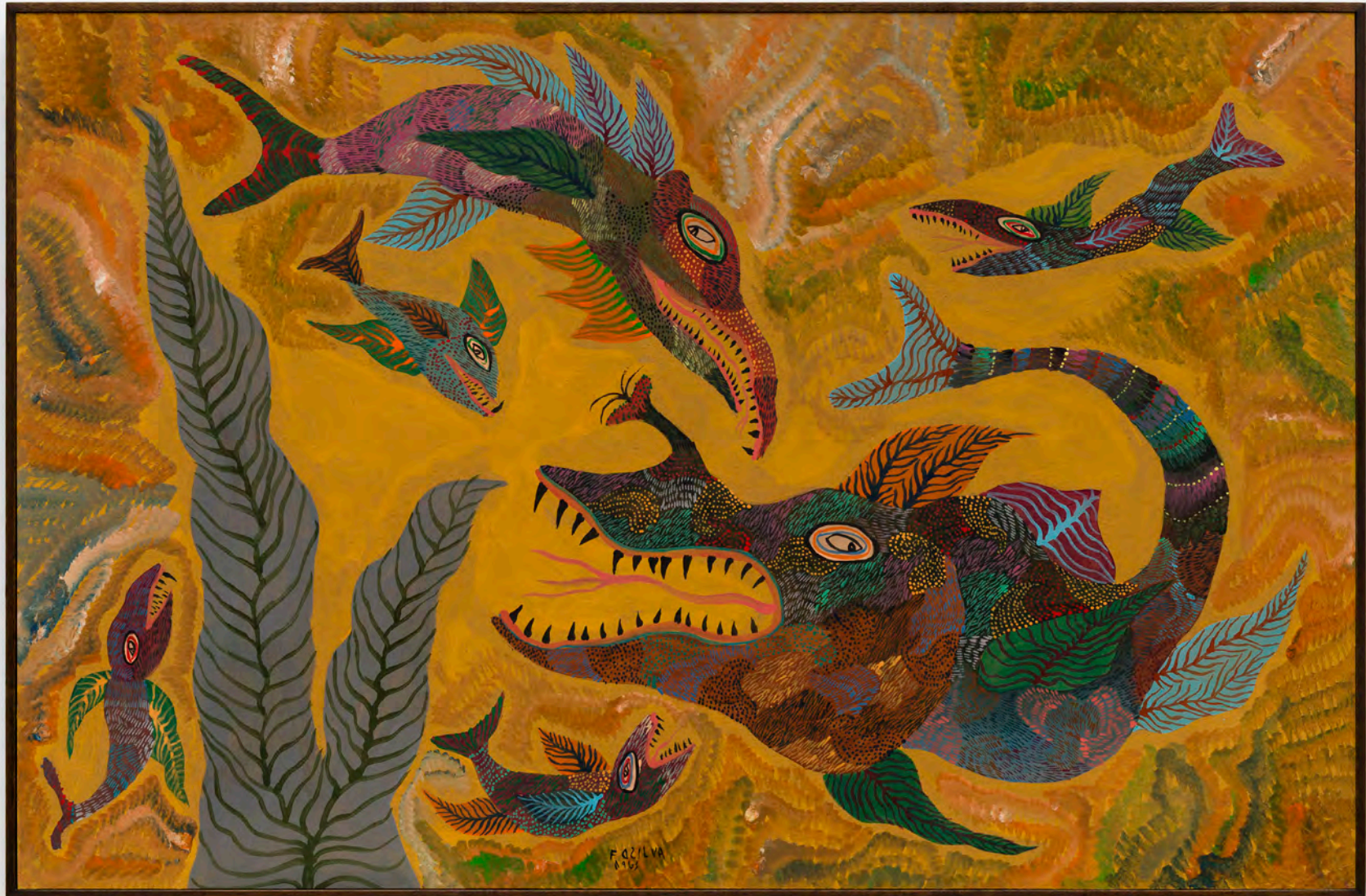
Chico da Silva, Seabed , 1963, oil on industrialized wood, 66 x 100 cm | 26 x 39 3/8 in, MW.CDS.013