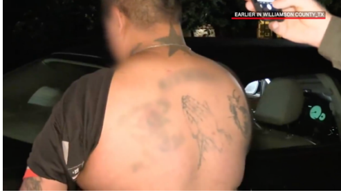
Sable Elyse Smith, LAUGH TRACK, OR WHO'S THAT PEEKING IN MY WINDOW , 2021 High-definition video, color, sound, 7:56 mins, Edition of 3 © Sable Elyse Smith 2025, courtesy the artist and Carlos/Ishikawa, London and Regen Projects, LA.