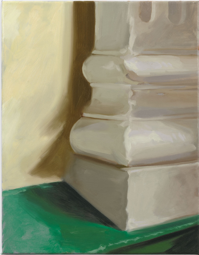
Wall piece #30 (Ugh! Give Me Any Other Century), 2024 Oil on canvas 50 x 39 cm