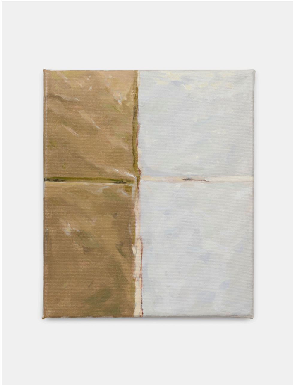
Wall piece #20 (My Rabbi Never Heard Of Him), 2023 Oil on canvas 35 × 30 cm