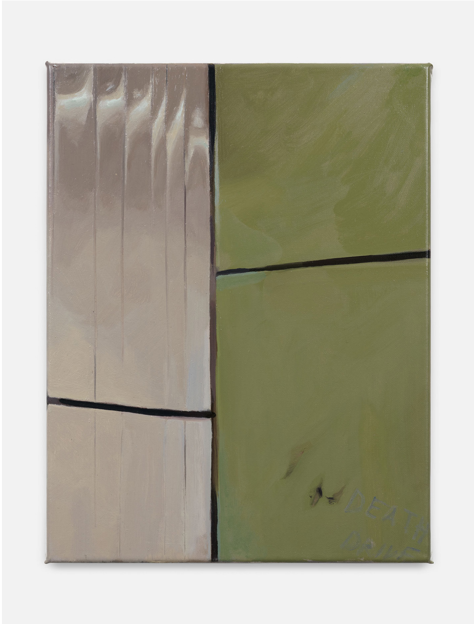
Wall piece #25 (Marker Of Limits), 2024 Oil on canvas 43 x 33 cm