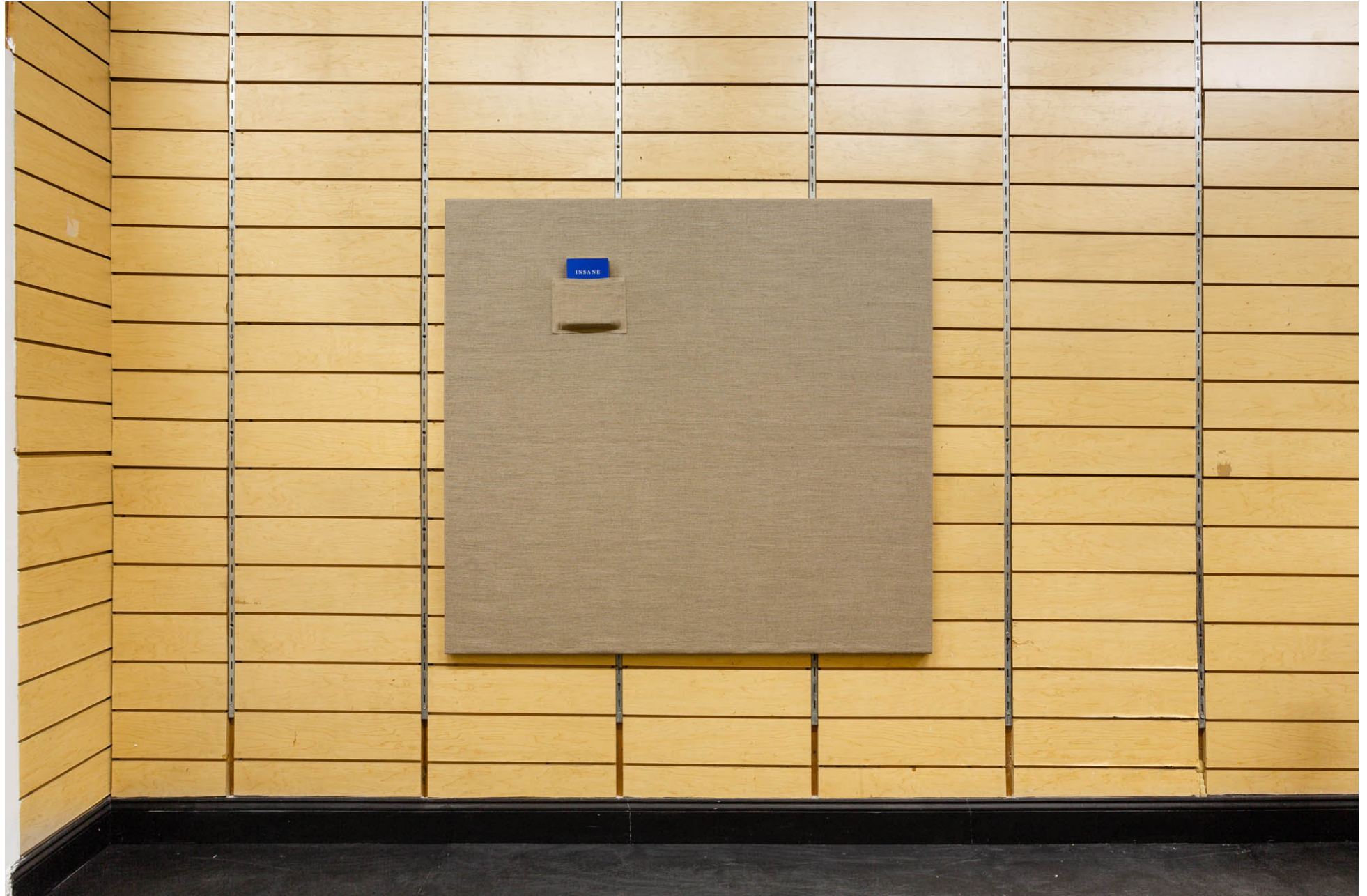
Dry Painting 1 (Vigilance) , 2022, Raw linen and used book, 140 x 150 cm