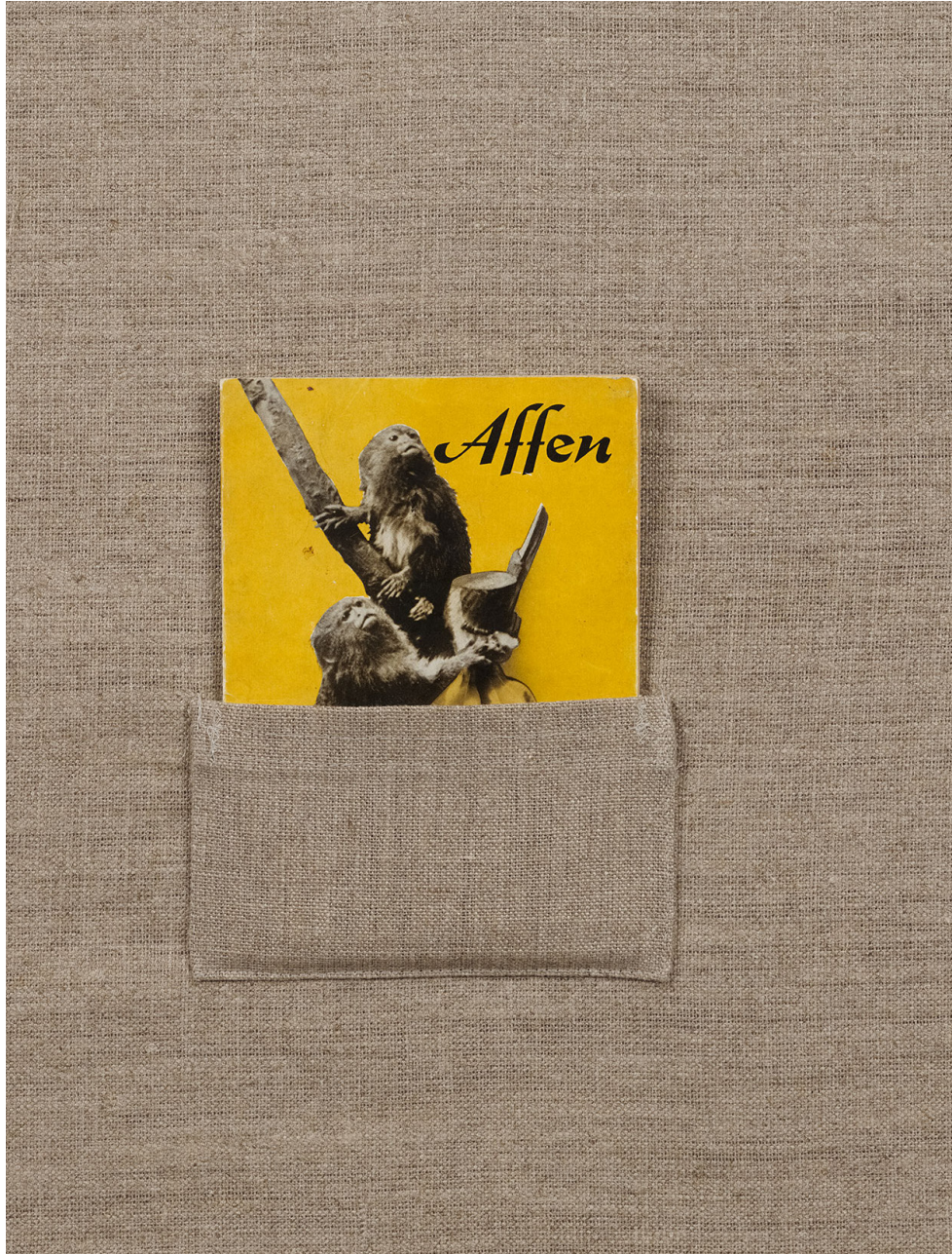
Dry Painting 4 (Helpless At Last), 2024