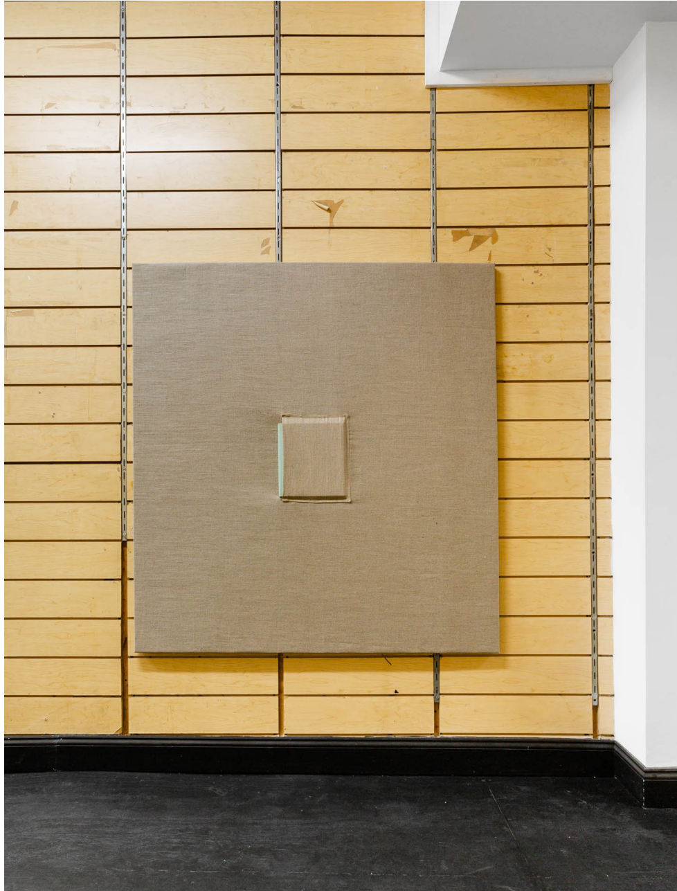
Dry Painting 3 (Hysterical Realism) , 2024 Raw linen and used book 150 x 140 cm