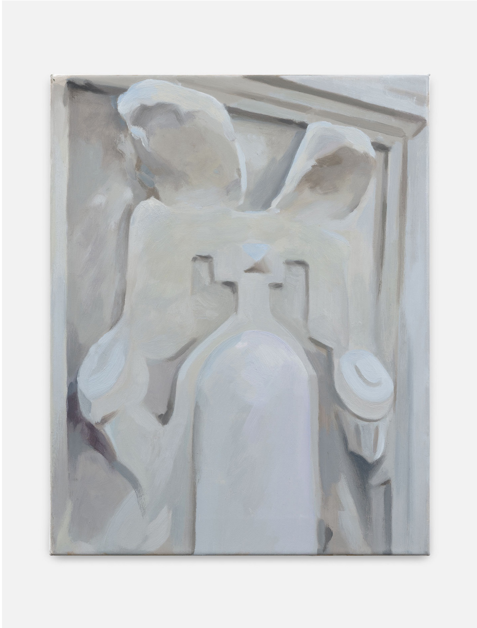
Wall piece #31 (Untitled), 2024 Oil on canvas 53 x 42 cm