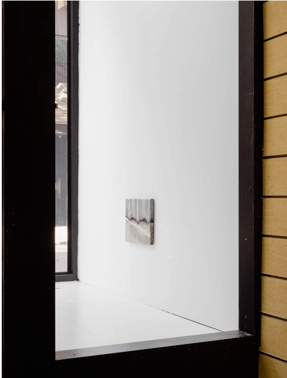
Wall piece #11 (I Believe In Stone), 2023 Oil on canvas 24 × 30 cm