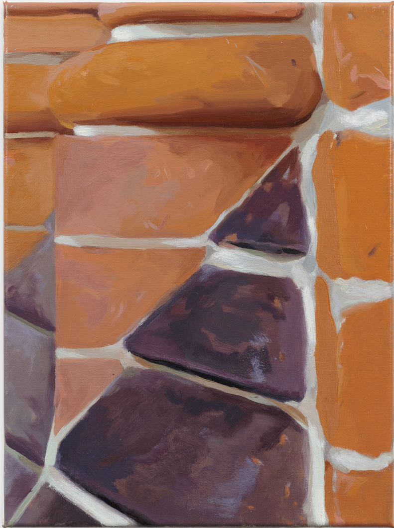
Wall piece #26 (For D.H. Johnson), 2024 Oil on canvas 46 x 34 cm