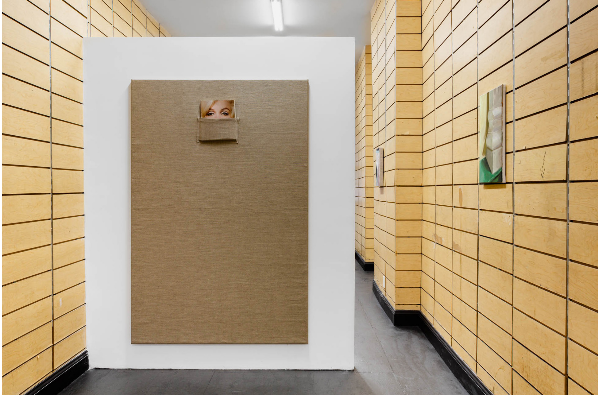
Dry Painting 2 (Soft Machine) , 2024, Raw linen and used book, 180 x 120 cm