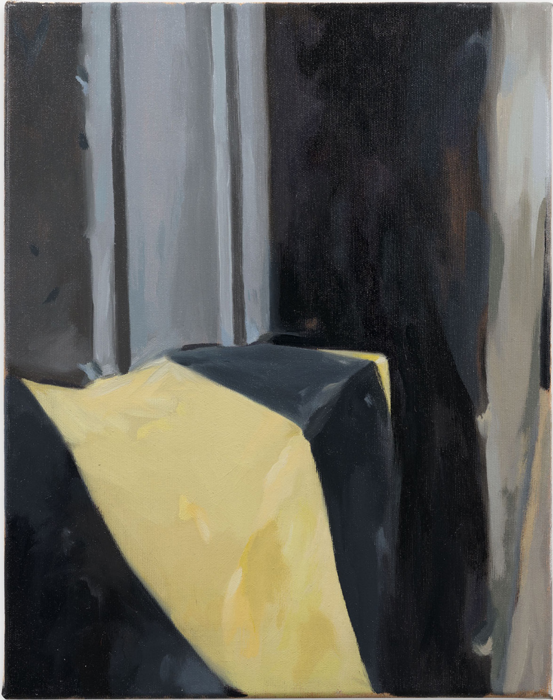
Wall piece #24 (Concrete And Paint Quartet), 2024 Oil on canvas 50 x 39 cm