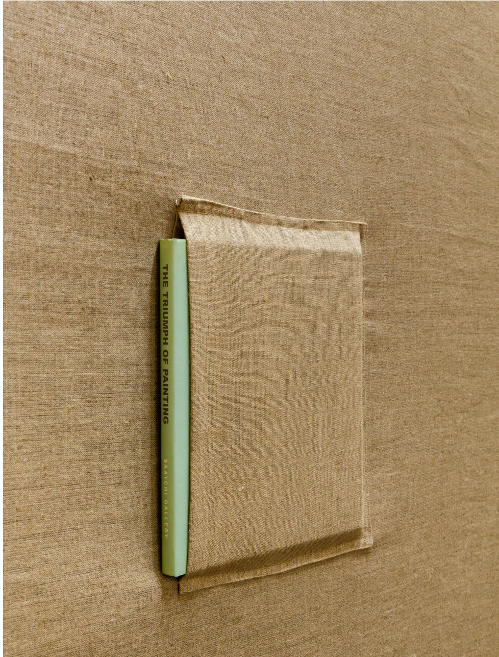
Dry Painting 3 (Hysterical Realism), 2024