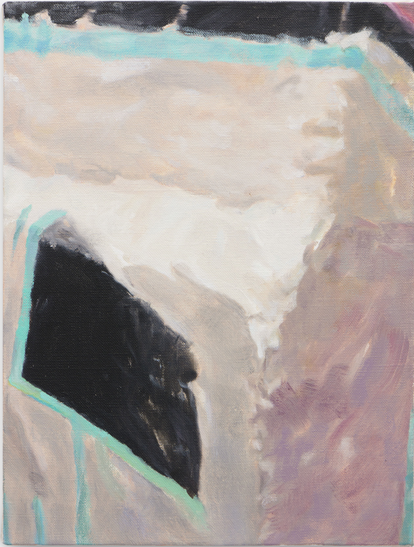
Wall piece #1 (The Flaneur) 2022, Oil on linen 40 × 30 cm