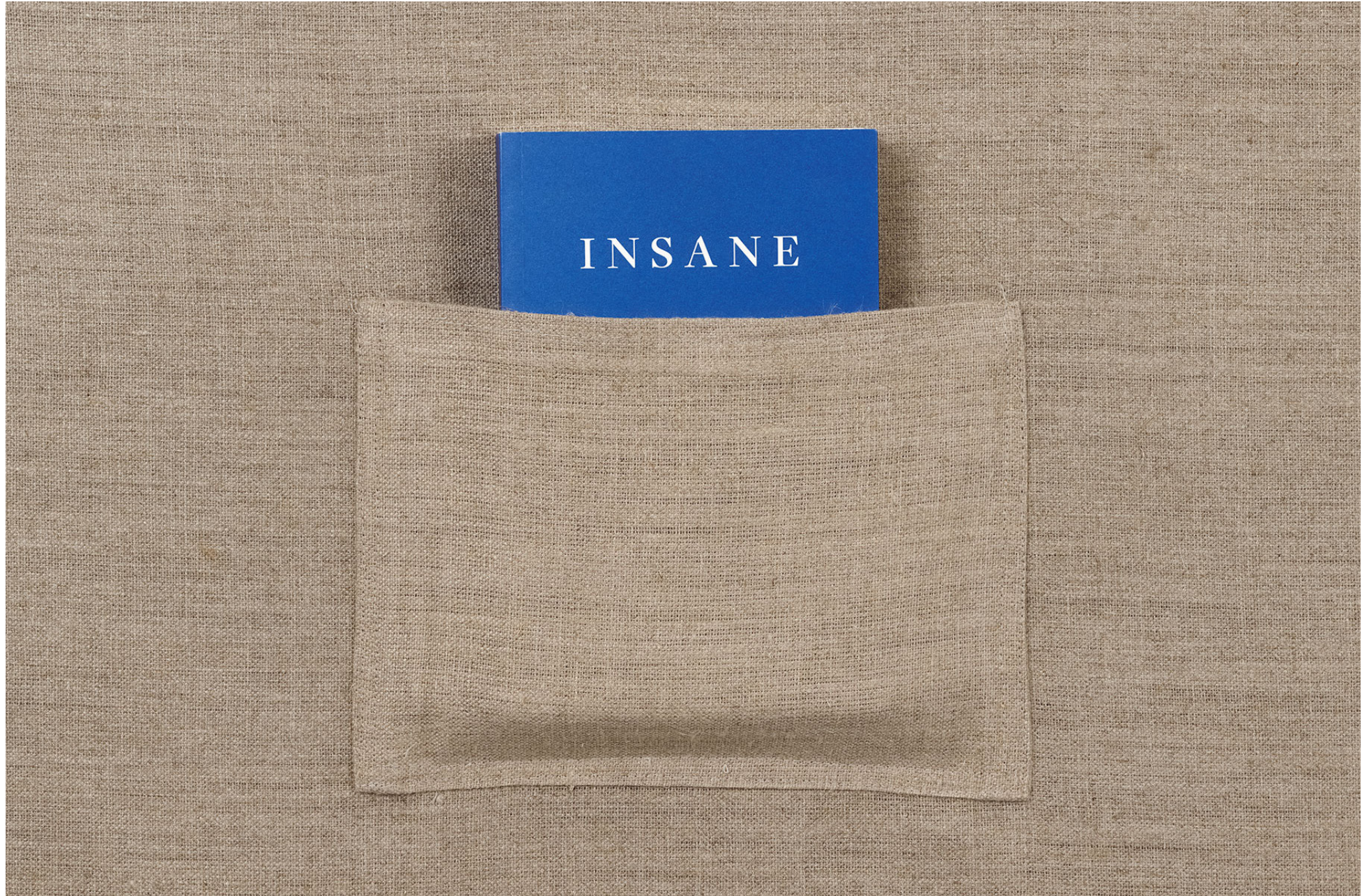
Dry Painting 1 (Vigilance), 2022