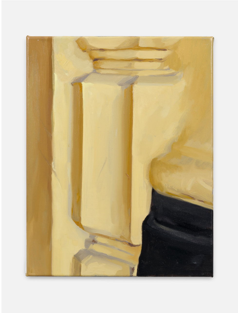
Wall piece #29 (Panama), 2024 Oil on canvas 49 x 38 cm