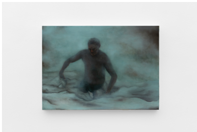
Lewis Hammond untitled (snow beach), 2025 Oil on linen 50 x 70 cm 19 3/4 x 27 1/2 inches