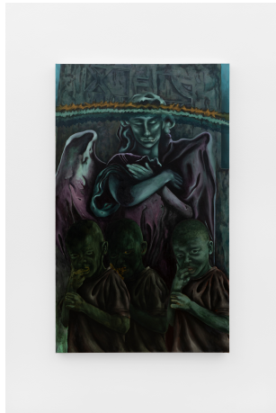
Lewis Hammond No more sorry, 2025 Oil on linen 150 x 90 cm 59 x 35 3/8 inches