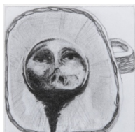
12, 24, 72 h Wahrheit (from the series "Ränder"), 2025 Pencil on paper 5,8 x 5,7 cm, 12,5 x 11 cm (framed)