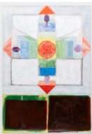
BERBAUÜBERBAUBASISÜBERBAU, 2025 Acrylic, watercolour and crayon on primed stone paper, metal eyelets 200 x 140 cm