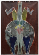
UOsOOon (5 finger hat die hand), 2025 Oil, acrylic and crayon on primed stone paper, metal eyelets 200 x 140 cm