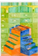
Geistige und körperliche Arbeit, 2024 Grease, watercolour and crayon on primed stone paper, metal eyelets 200 x 140 cm