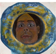
Als gute Mutter, 2024 Watercolour on handmade paper 18 x 19,2 cm