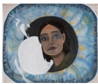
Als gute Mutter, 2024 Watercolour on handmade paper 18,5 x 22,2 cm, 28,5 x 31,5 cm (framed)