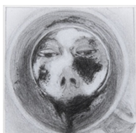
12, 24, 72 h Wahrheit (from the series "Ränder"), 2025 Pencil on paper 5,8 x 6 cm, 11,5 x 11 cm (framed)