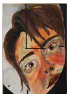
Untitled (beispielhaft), 2024 Watercolour and oil pastels on handmade paper 20,5 x 14,5 cm, 30,5 x 23 cm (framed)