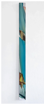
Markus Saile Pipe#46 2024 signed & dated verso oil on wood 200 x 13 cm