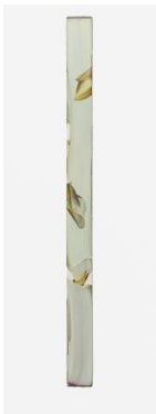
Markus Saile Pipe#38 2023 signed & dated verso oil on wood 190 x 13 cm