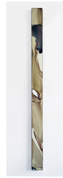
Markus Saile Pipe#45 2024 signed & dated verso oil on wood 200 x 13 cm