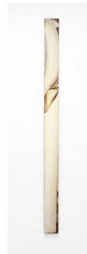
Markus Saile Pipe#43 2024 signed & dated verso oil on wood 200 x 13 cm