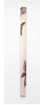
Markus Saile Pipe#40 2024 signed & dated verso oil on wood 200 x 13 cm