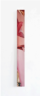
Markus Saile Pipe#48 2024 signed & dated verso oil on wood 137 x 13 cm