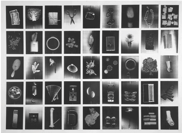
Pati Hill, Alphabet of Common Objects (c. 1975–79), 45 black and white copier prints, each 28 x 21.5 cm

Pati Hill (b. 1921, Ashland, KY, USA, d. 2014, Sens, France). Selected solo exhibitions include: Printed Matter , New York, USA (2023); Onsen Confidential , Air de Paris, France and Take Ninagawa , Tokyo, Japan (2022); Heaven's door is open to us / Like a big vacuum cleaner / O help / O clouds of dust / O choir of hairpins , Air de Paris, Paris, France (2020); Kunsthalle , Zurich, Switzerland (2020); Something Other Than Either , Kunstverein, Munich, Germany (2020); How Something Can Have Been At One Time And In One Place And Nowhere Else Ever Again , Essex Street, New York, USA (2018); Photocopier , Lyman Allyn Museum, New London, CT, USA (2017); Vers Versailles , Musée Lambinet, Versailles, France (2005).