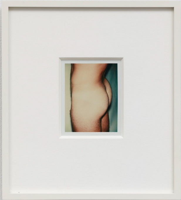
Andy Warhol Nude Male Model (1/2) , 1976-1977 Unique polaroid print (Polacolor Type 108) Artwork: 4 ¼ x 3 ⅜ in (10.8 x 8.6 cm) Frame: 11 x 10 in (28 x 25.4 cm)