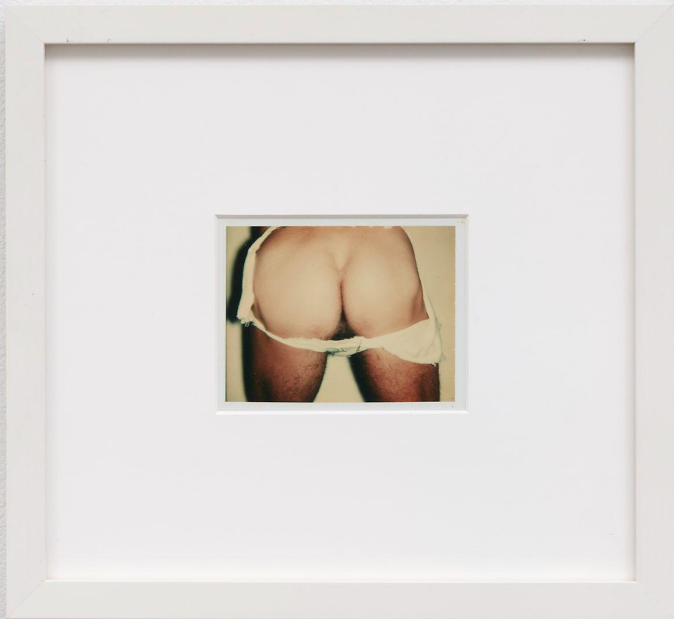
Andy Warhol Nude Male (2/2) , 1977 Unique polaroid print (Polacolor Type 108) Artwork: 3 \frac{3}{8} x 4 \frac{1}{4} in (8.6 x 10.8 cm) Frame: 10 x 11 in (25.4 x 28 cm)