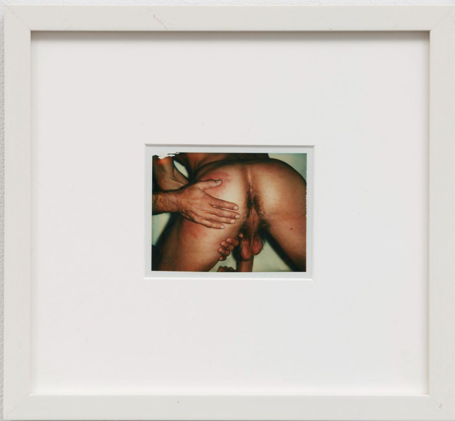
Andy Warhol Nude Male Model (2/2) , 1977 Unique polaroid print (Polacolor Type 108) Artwork: 3 \frac{3}{8} x 4 \frac{1}{4} in (8.6 x 10.8 cm) Frame: 10 x 11 in (25.4 x 28 cm)