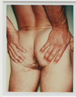
Andy Warhol Nude Male Model (1/3) , 1977 Unique polaroid print (Polacolor Type 108) Artwork: 4 ¼ x 3 ⅜ in (10.8 x 8.6 cm) Frame: 11 x 10 in (28 x 25.4 cm)