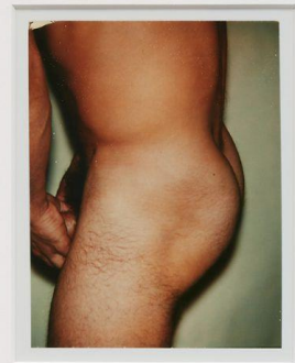
Andy Warhol Nude Male Model (1/2) , 1977 Unique polaroid print (Polacolor Type 108) Artwork: 4 ¼ x 3 ⅜ in (10.8 x 8.6 cm) Frame: 11 x 10 in (28 x 25.4 cm)