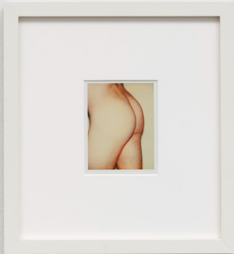
Andy Warhol Torso (2/4) , 1977 Unique polaroid print (Polacolor Type 108) Artwork: 4 ¼ x 3 ⅜ in (10.8 x 8.6 cm) Frame: 11 x 10 in (28 x 25.4 cm)