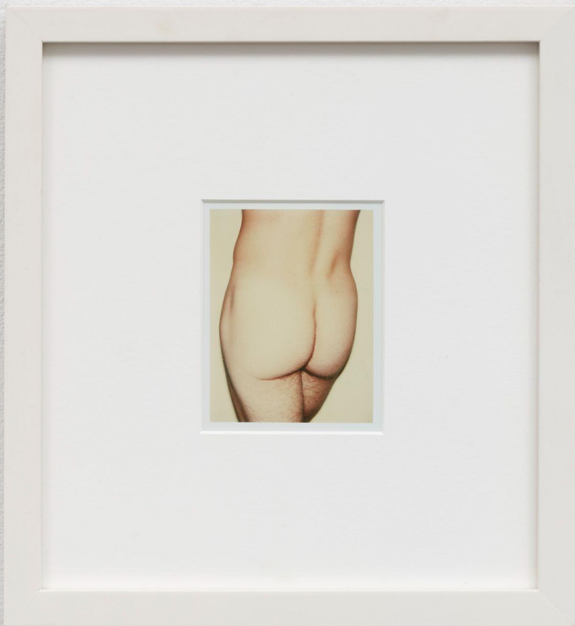
Andy Warhol Nude Male Model (4/4) , 1976-1977 Unique polaroid print (Polacolor Type 108) Artwork: 4 \frac{1}{4} x 3 \frac{3}{8} in (10.8 x 8.6 cm) Frame: 11 x 10 in (28 x 25.4 cm)