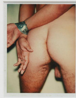
Andy Warhol Nude Male Model (1/2) , 1977 Unique polaroid print (Polacolor Type 108) Artwork: 4 ¼ x 3 ⅜ in (10.8 x 8.6 cm) Frame: 11 x 10 in (28 x 25.4 cm)