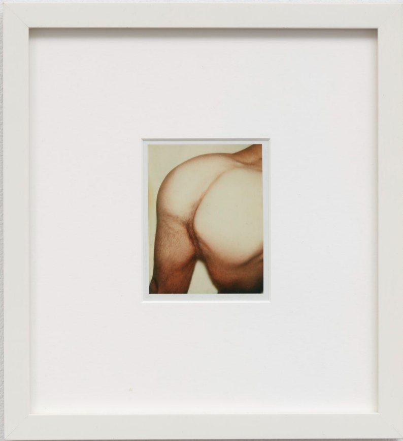
Andy Warhol Nude Male Model (2/3) , 1976 Unique polaroid print (Polacolor Type 108) Artwork: 4 ¼ x 3 ⅜ in (10.8 x 8.6 cm) Frame: 11 x 10 in (28 x 25.4 cm)