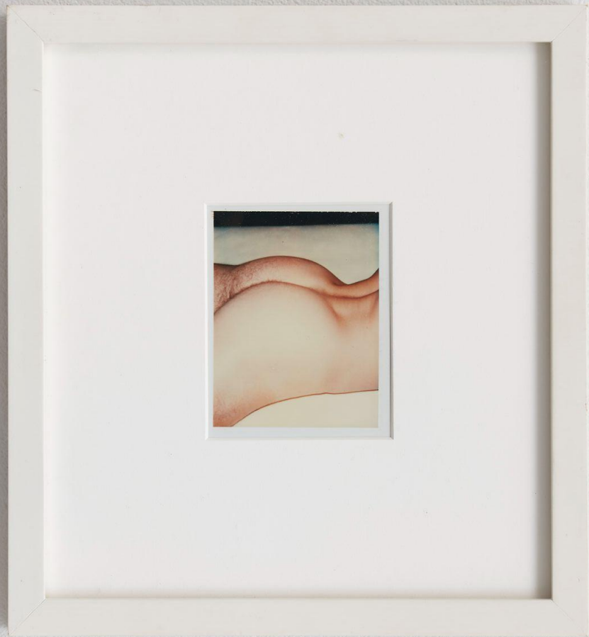
Andy Warhol Nude Male Model (1/2) , 1977 Unique polaroid print (Polacolor Type 108) Artwork: 4 ¼ x 3 ⅜ in (10.8 x 8.6 cm) Frame: 11 x 10 in (28 x 25.4 cm)