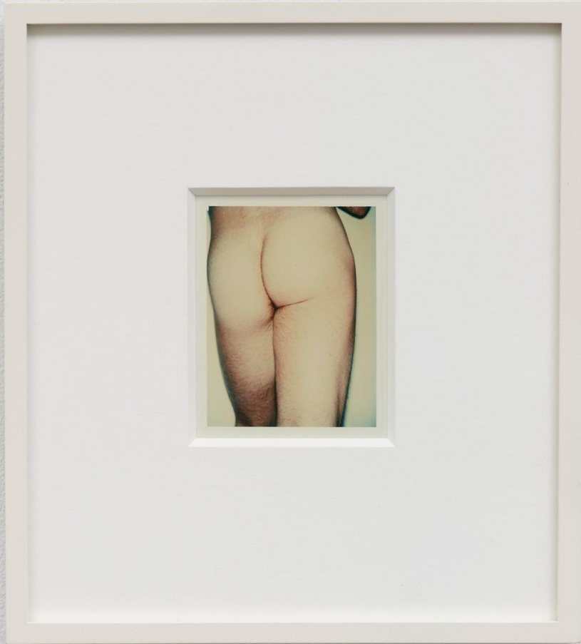
Andy Warhol Nude Male Model (2/4) , 1976-1977 Unique polaroid print (Polacolor Type 108) Artwork: 4 \frac{1}{4} x 3 \frac{3}{8} in (10.8 x 8.6 cm) Frame: 11 x 10 in (28 x 25.4 cm)