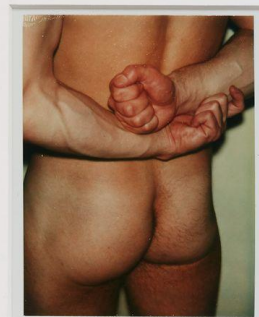
Andy Warhol Nude Male Model (3/3) , 1977 Unique polaroid print (Polacolor Type 108) Artwork: 4 ¼ x 3 ⅜ in (10.8 x 8.6 cm) Frame: 11 x 10 in (28 x 25.4 cm)