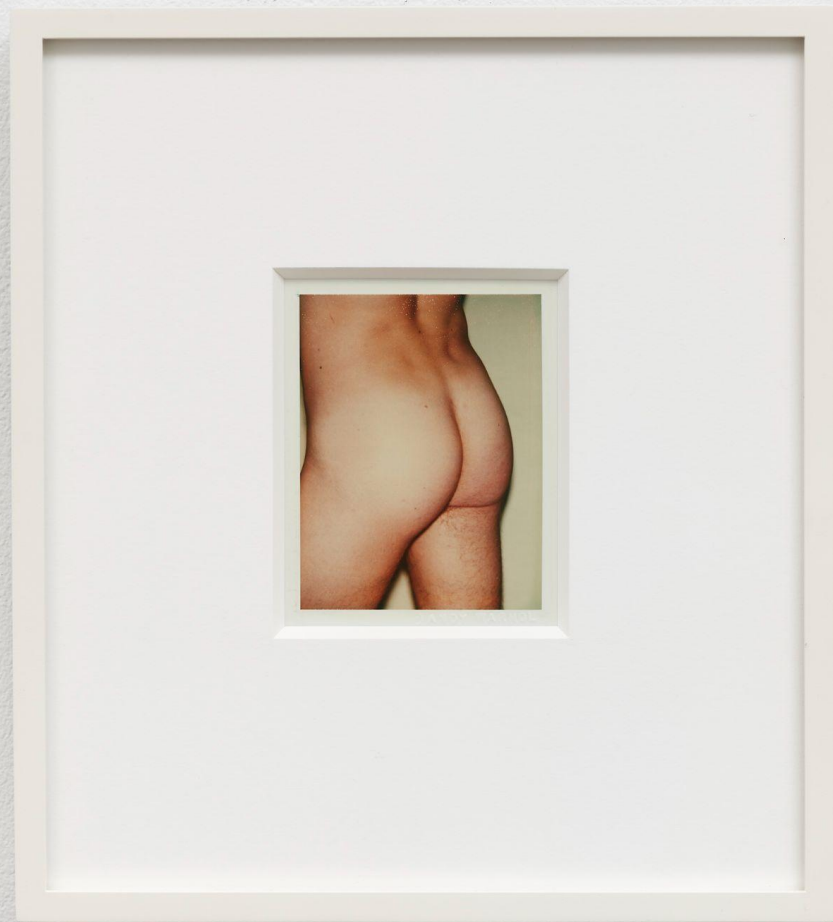
Andy Warhol Torso (1/4) , 1976 Unique polaroid print (Polacolor Type 108) Artwork: 4 ¼ x 3 ⅜ in (10.8 x 8.6 cm) Frame: 11 x 10 in (28 x 25.4 cm)