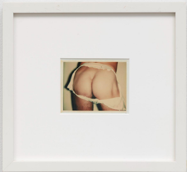
Andy Warhol Nude Male (1/2) , 1977 Unique polaroid print (Polacolor Type 108) Artwork: 3 \frac{3}{8} x 4 \frac{1}{4} in (8.6 x 10.8 cm) Frame: 10 x 11 in (25.4 x 28 cm)