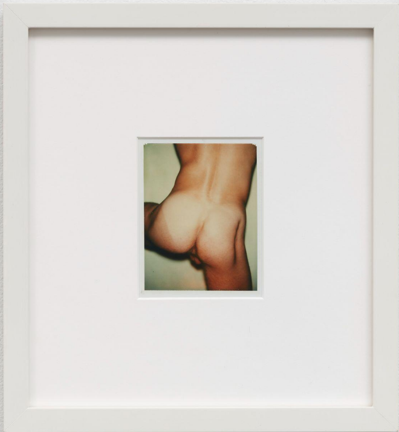
Andy Warhol Nude Male Model (1/3) , 1977 Unique polaroid print (Polacolor Type 108) Artwork: 4 \frac{1}{4} x 3 \frac{3}{8} in (10.8 x 8.6 cm) Frame: 11 x 10 in (28 x 25.4 cm)