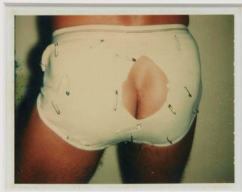
Andy Warhol Torso (1/2) , 1977 Unique polaroid print (Polacolor Type 108) Artwork: 4 ¼ x 3 ⅜ in (10.8 x 8.6 cm) Frame: 10 x 11 in (25.4 x 28 cm)