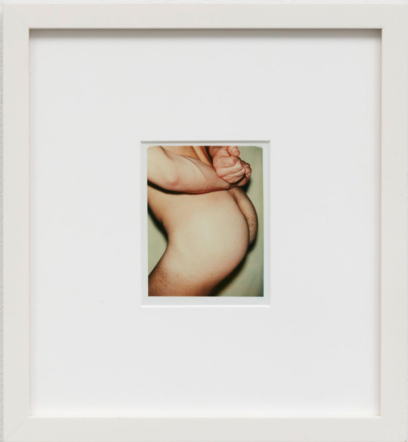
Andy Warhol Nude Male Model (2/3) , 1977 Unique polaroid print (Polacolor Type 108) Artwork: 4 ¼ x 3 ⅜ in (10.8 x 8.6 cm) Frame: 11 x 10 in (28 x 25.4 cm)