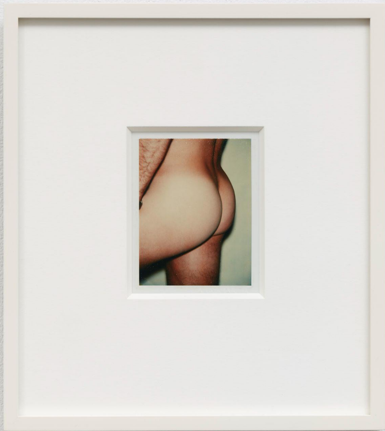
Andy Warhol Nude Male Model (2/2) , 1977 Unique polaroid print (Polacolor Type 108) Artwork: 4 \frac{1}{4} x 3 \frac{3}{8} in (10.8 x 8.6 cm) Frame: 11 x 10 in (28 x 25.4 cm)