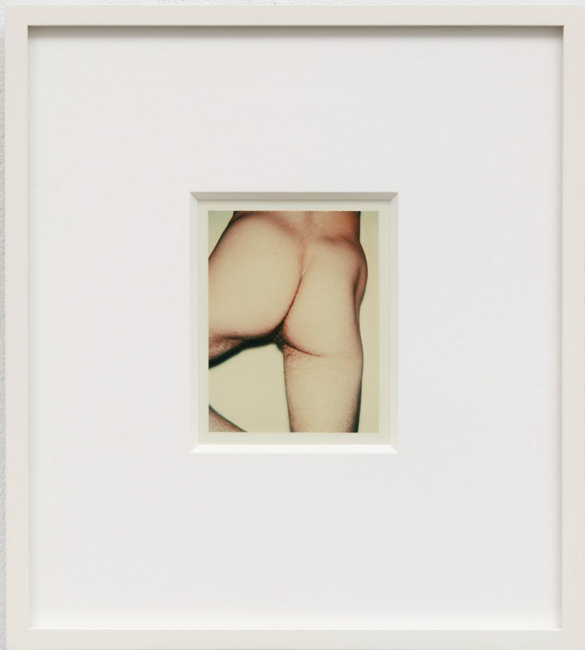
Andy Warhol Nude Male Model (1/4) , 1976-1977 Unique polaroid print (Polacolor Type 108) Artwork: 4 ¼ x 3 ⅜ in (10.8 x 8.6 cm) Frame: 11 x 10 in (28 x 25.4 cm)