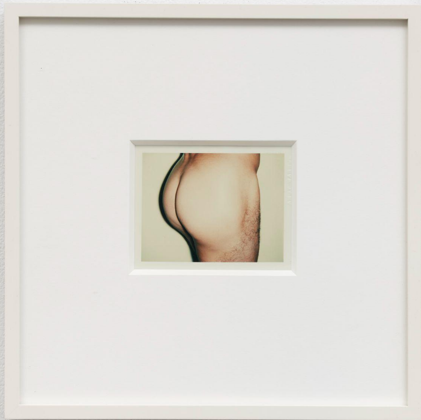
Andy Warhol Nude Model (Male) , 1977 Unique polaroid print (Polacolor Type 108) Artwork: 3 5/8 x 4 1/4 in (8.6 x 10.8 cm) Frame: 11 x 11 in (28 x 28 cm)