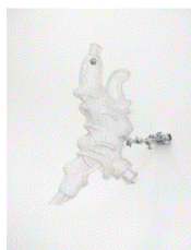
Berenice Olmedo Canek, 2023 ThermoLyn orthoprosthesis, suction valve for prosthesis, tom holders 117 x 52 x 40 cm

Courtesy alexander levy and the artist, photo: Marcus Schneider