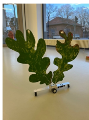
Anne Duk Hee Jordan Wild leaves, 2024 Motors, aluminium, acrylic, sensors 60,8 x 70,5 x 4 cm