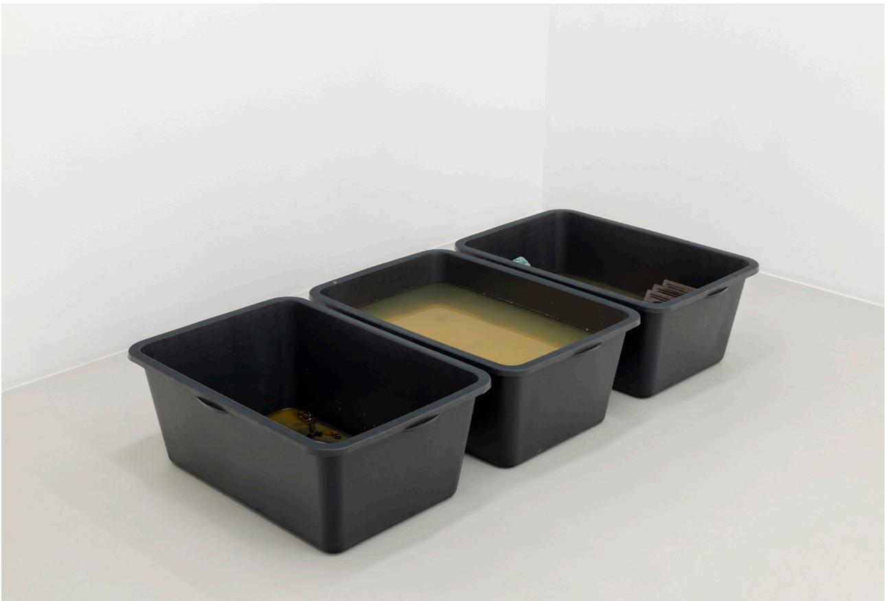
Laurence Sturla: Drives My Green Age (3 stacks) . 2025. Plastic rubble container, overfired ceramic fragments, ceramic slurry, salt water, rust, metal fixings, anti-fouling paint, studio detritus. 78 x 150 x 30 cm. Courtesy of the artist & Gianni Manhattan, Vienna