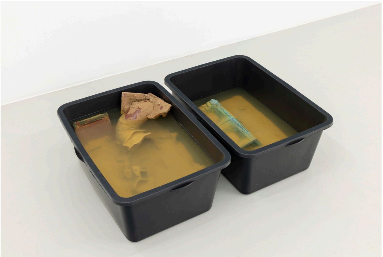
Laurence Sturla: Drives My Green Age (2 stacks) . 2025. Plastic rubble container, overfired ceramic fragments, ceramic slurry, salt water, rust, metal fixings, anti-fouling paint, studio detritus. 78 x 100 x 30 cm. Courtesy of the artist & Gianni Manhattan, Vienna