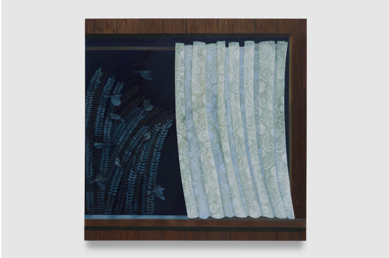
Gail Spaien Night Curtain , 2024 Acrylic on Linen 48 x 48 inches (GSp_002)