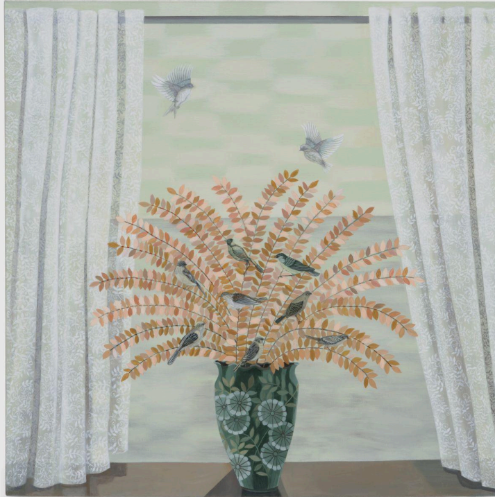
Gail Spaien Untitled, 2024 Acrylic on Linen 48 x 48 inches 121.9 x 121.9 cm (GSp_004)