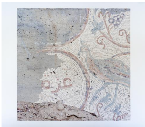
Gaza Mosaic, 38"X38" Photo Collage, 2024