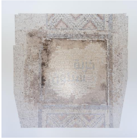
Khirbet Seilun, 38"X38" Photo collage, 2024