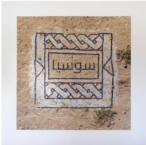
Khirbet Susya, 38"X38" Photo collage, 2024