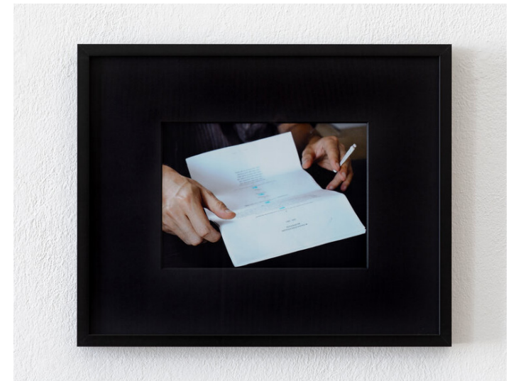
Luzie Meyer, unidentified IV , 2020, Framed c-print, 4 x 30 cm (9 1/2 x 11 3/4 in)