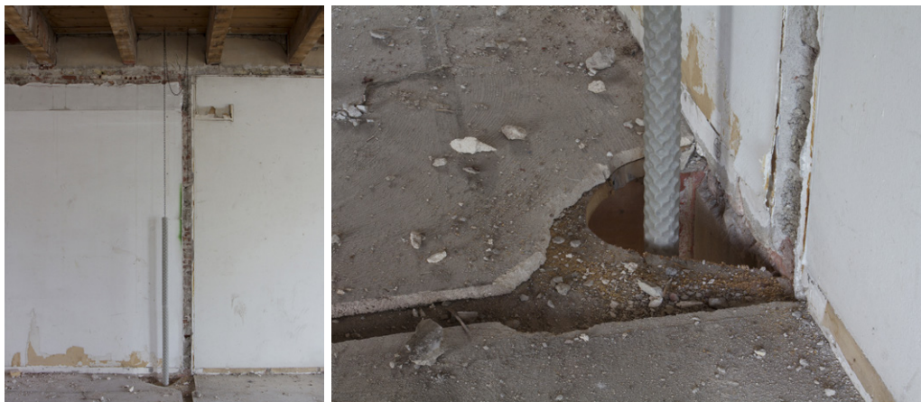
Becket MWN, The inside of my inside is my outside , 2020