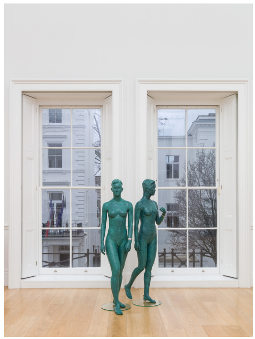
Lucy McKenzie, Faux Verdigris Statue (Zoya) I & II , 2024. Fiberglass, acrylic and oil paint, wax, stand, 175 x 49 x 40 cm / 178 x 48 x 69 cm. Courtesy of the artist, Galerie Buchholz, Berlin/Cologne/New York and Cabinet, London. Photo: Mark Blower.

For this work, McKenzie transformed two window mannequins into classical statues similar to those found in public spaces. She has long been interested in how mannequins reflect the evolving standards of female beauty, particularly in the context of a capitalist economy. Here, McKenzie replaced the anonymous heads of the mannequins with that of Zoya Kosmodemyanskaya, a Soviet resistance fighter who became a folk hero after her death. In doing so, McKenzie contrasts capitalist and communist representations of women. Kosmodemyanskaya's likeness has been immortalized in many monuments, which is notable given that most public statues commemorate men. To enhance the statuesque quality of the mannequins, McKenzie used faux verdigris to suggest a bronze patina.