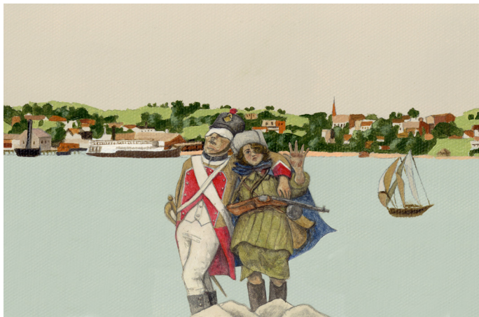
Lucy McKenzie, Re-enactors (detail from Miniature Moving Panorama), 2024. Digital print on paper, 380 x 250 cm. Courtesy of the artist, Galerie Buchholz, Berlin/Cologne/New York and Cabinet, London.

Take a seat in the train carriage. The design evokes the way trains and carnival rides are often depicted as secret meeting places in films.