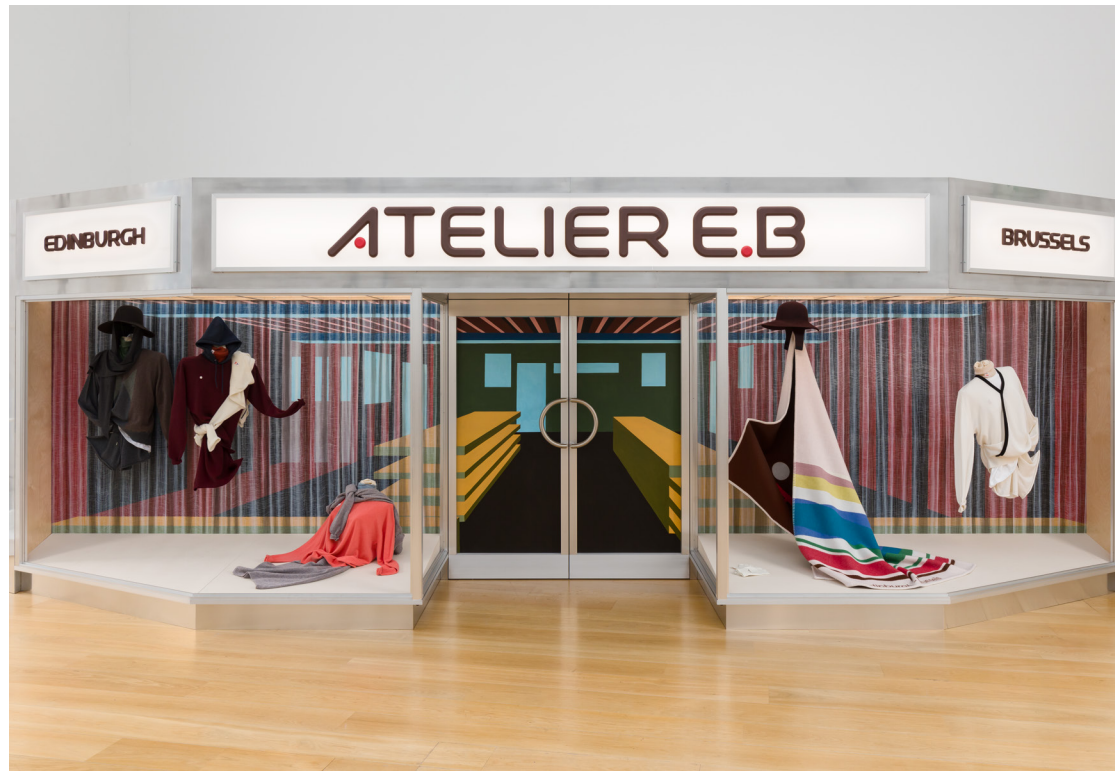
Atelier E.B (Beca Lipscombe & Lucy McKenzie), Sports Shop , 2024. Acrylic and oil on canvas, steel, wood, Perspex, aluminum and textiles, 700 x 100 x 230 cm. Courtesy of the artist and Galerie Buchholz, Berlin/Cologne/New York. Photo: Mark Blower.

By drawing attention to the transient nature of window displays, Atelier E.B reflects on the relationship between visual art and mass culture. For Sports Shop , the duo collaborated with artist and furniture maker Steff Norwood and window dressers Barbara Kelly and Howard Tong. McKenzie painted the illusionistic backdrop of the interior in oil and acrylic on canvas.