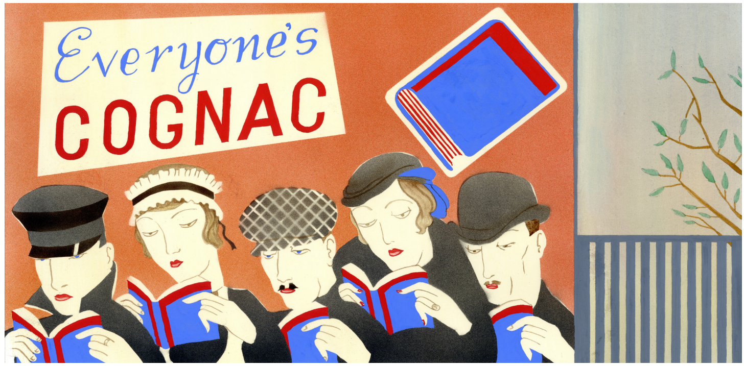
Lucy McKenzie, Pleasure's Inaccuracies Billboard II , 2020. Offset print on paper, 600 x 300 cm. Commissioned by Art on the Underground. Courtesy of the artist and Cabinet, London.

McKenzie's billboard advertises a fictional book promoted as 'Everyone's Cognac', which targets people from different social strata of the interwar period. Up close, the billboards reveal themselves to be reproductions of McKenzie's drawings, complete with minor imperfections.