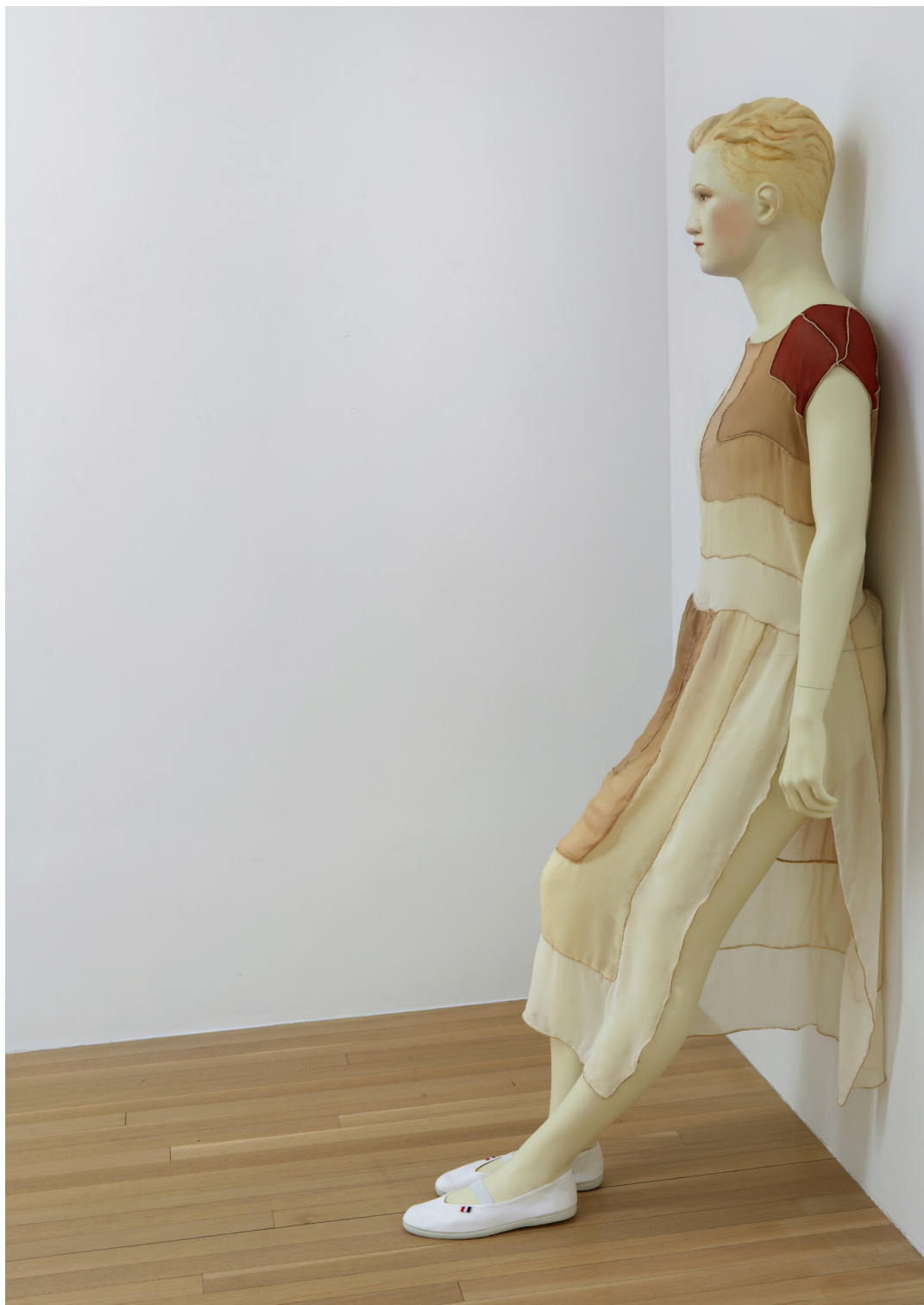
Lucy McKenzie, Leaning Mannequin (Roman Statue/ l'Orage) , 2021. Fiberglass, acrylic and oil paint, silk dress with gold braid, gym shoes, 70 x 57 x 166 cm.

The changing iconography of female beauty is also reflected in the skin tones, which represent three art historical styles: the terracotta of a classical Greek vase, the eggplant hue of a Roman marble statue and the pale cast of a medieval European sculpture.