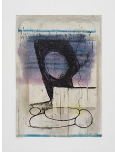
Erwin Bohatsch "Untitled", 2020 Mixed media on paper 29.7 x 21 cm