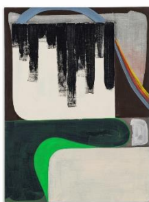
Erwin Bohatsch "Untitled", 2023 Acrylic, oil on canvas 135 x 100 cm

Tue-Sat 11:00 – 19:00 Closed on Sun, Mon, and National Holidays