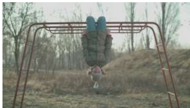
Eva Kot'átková, "Stomach of the World", 2017