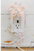
Tiziana La Melia Wand , 2020 nightlight, ribbon, found object 4 x 4 x 2 in.