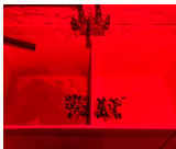
Craig Jun Li F.F.1.1, F.F.1.2 & F.F.1.3 , 2025 SX-70 films, furniture nails, glass marbles, cast white brass, jewelry trays, acrylic paint, MDF, joint compound, found styrofoam packagings, vintage Kodak Polymax II RC F photo paper, medical tapes, bubble levels, ink drawings on plexiglass Installed under darkroom safelights 27 x 30 x 11 in. each