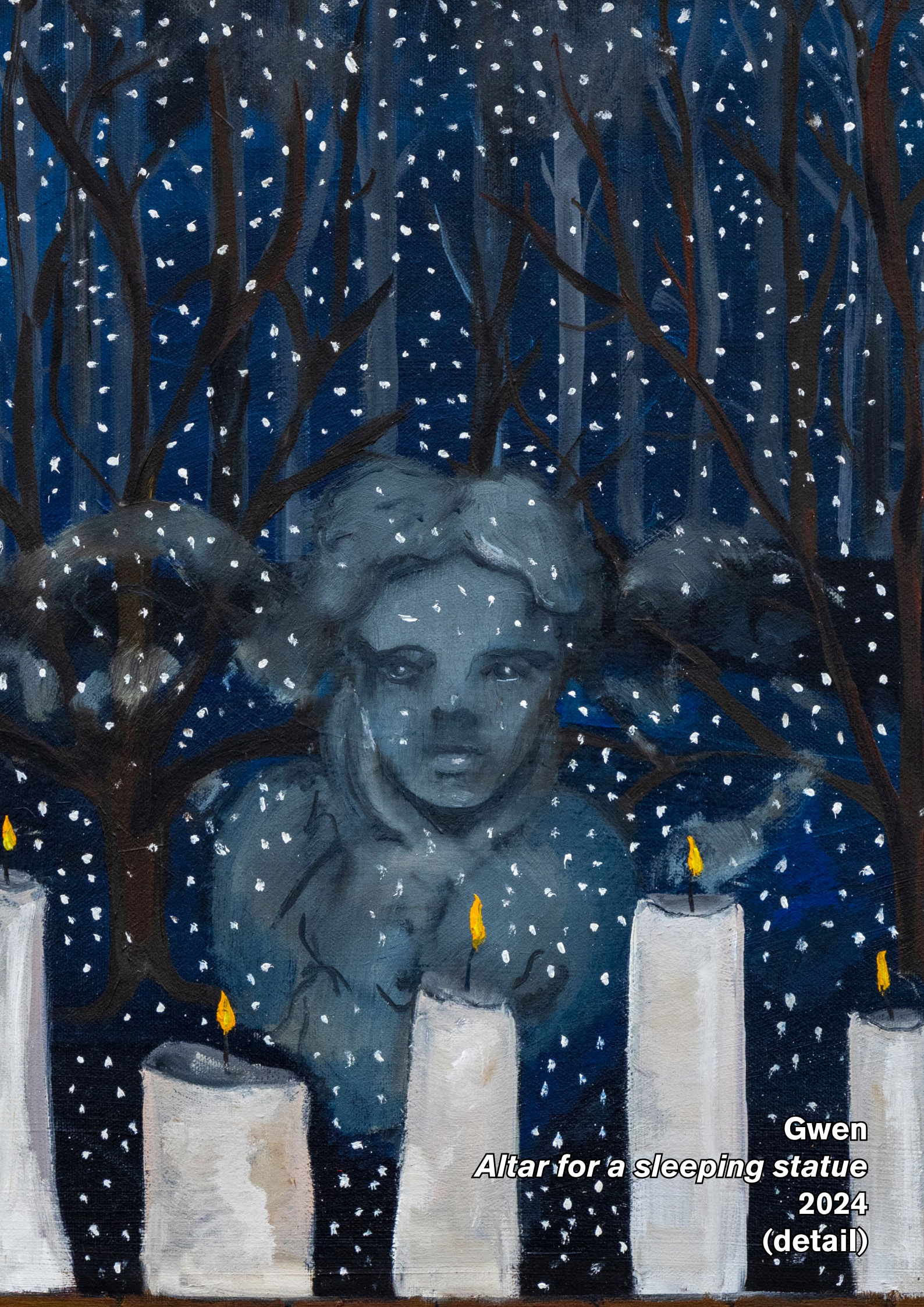
Gwen Altar for a sleeping statue 2024 (detail)