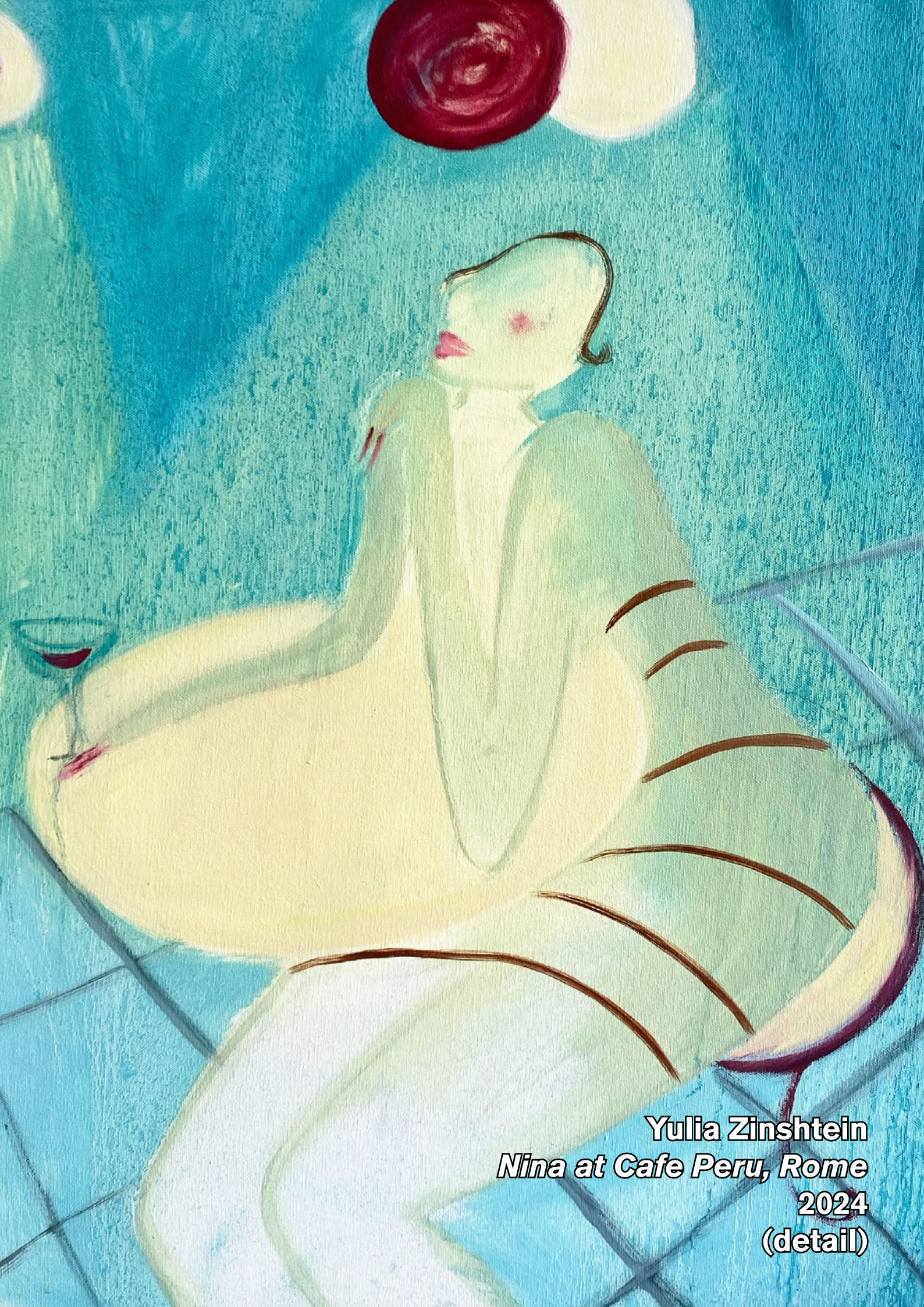
Yulia Zinshtein Nina at Cafe Peru, Rome 2024 (detail)