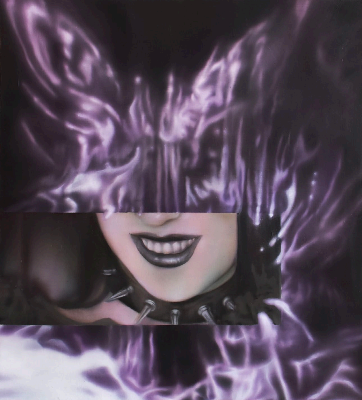
Margherita Mezzetti Grace 2024 oil on board cm 41.5 x 36