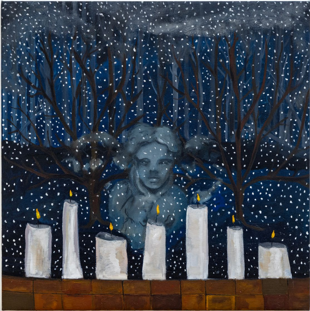
Gwen Altar for a sleeping statue 2024 oil on canvas cm 60 x 60