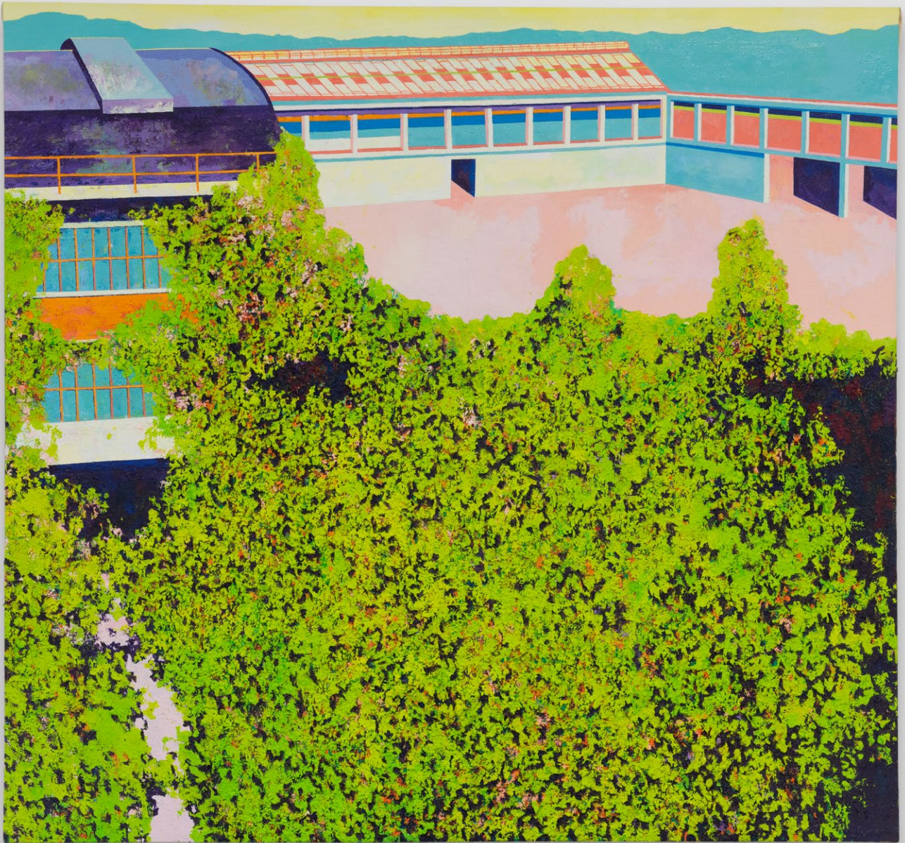
Miriam Marafioti Bosco in fabbrica 2024 mixed media on canvas cm 92 x 98