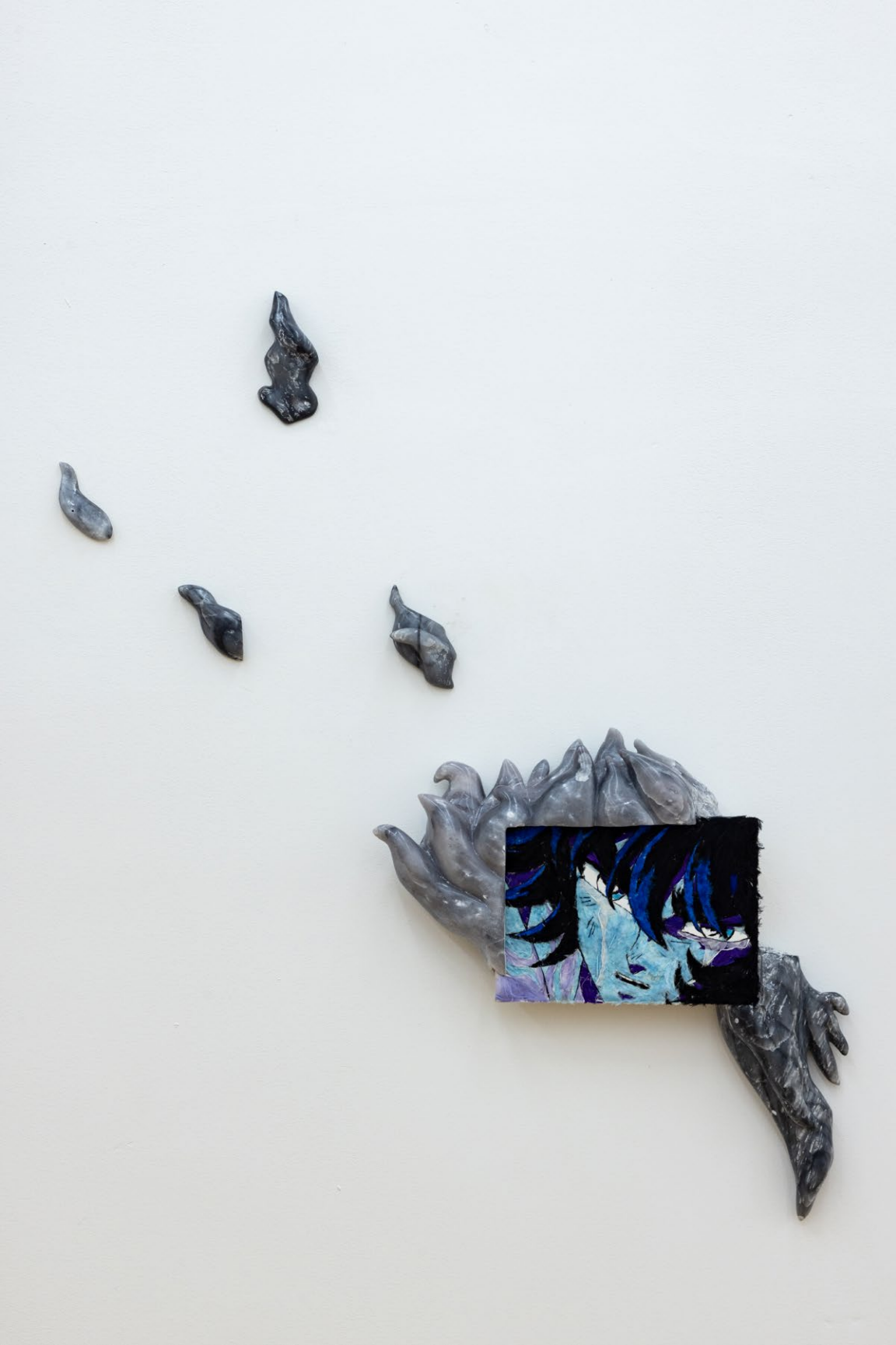
Omar Castillo Alfaro Manga crying - Phénix Pico (Amantecas, chapter 1: Pedro, series) 2024 natural bird feather, soapstone, cotton paper and wood cm 52.5 x 43 x 8