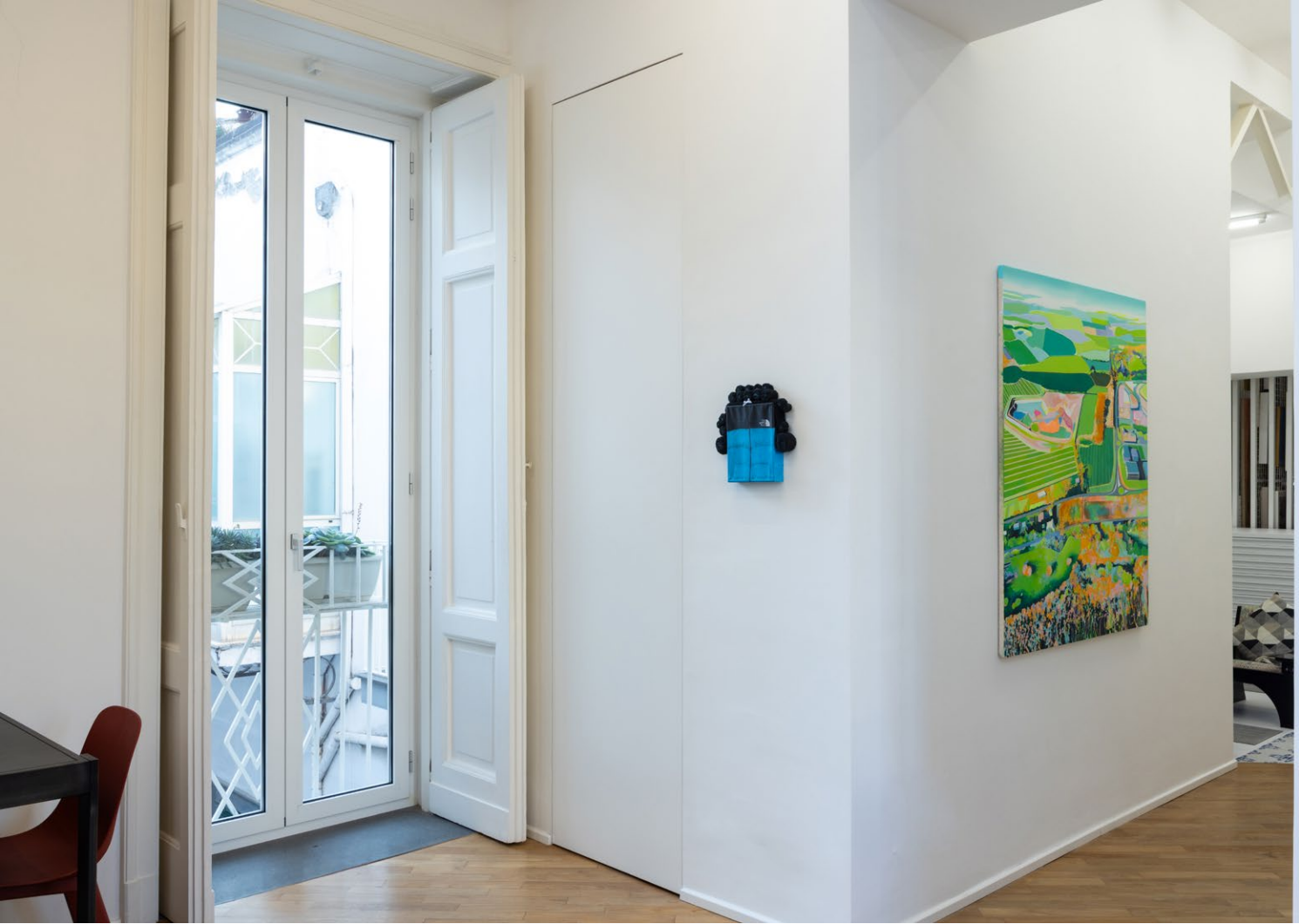
Our Souls at Night , 2025, exhibition view at Umberto Di Marino, Naples, IT