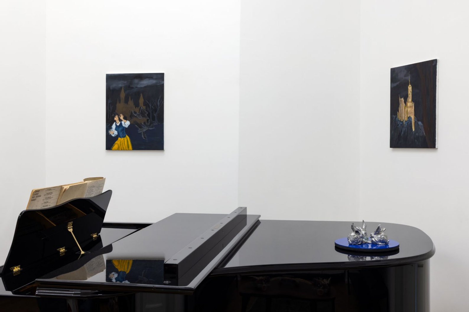
Our Souls at Night , 2025, exhibition view at Umberto Di Marino, Naples, IT