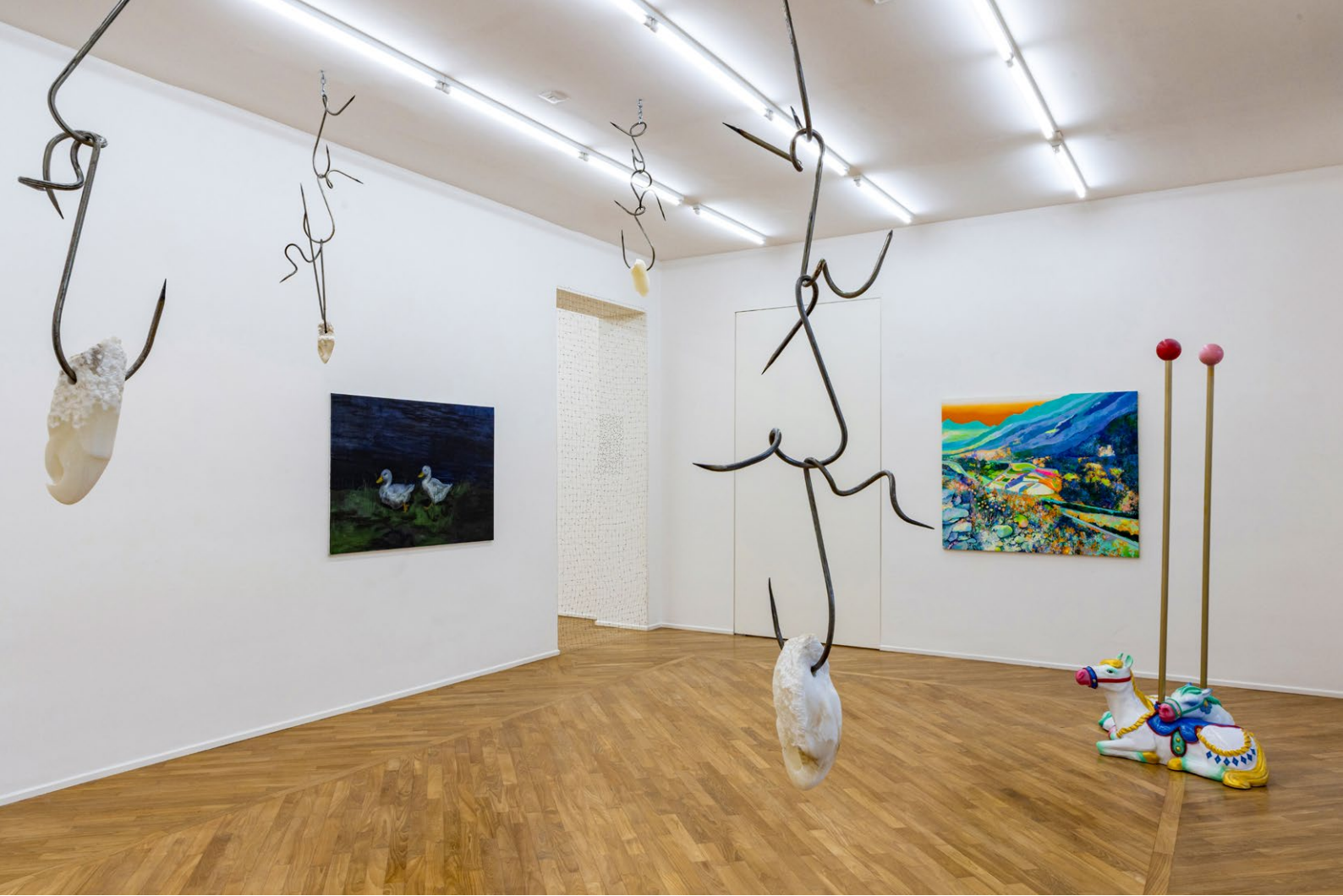
Our Souls at Night , 2025, exhibition view at Umberto Di Marino, Naples, IT