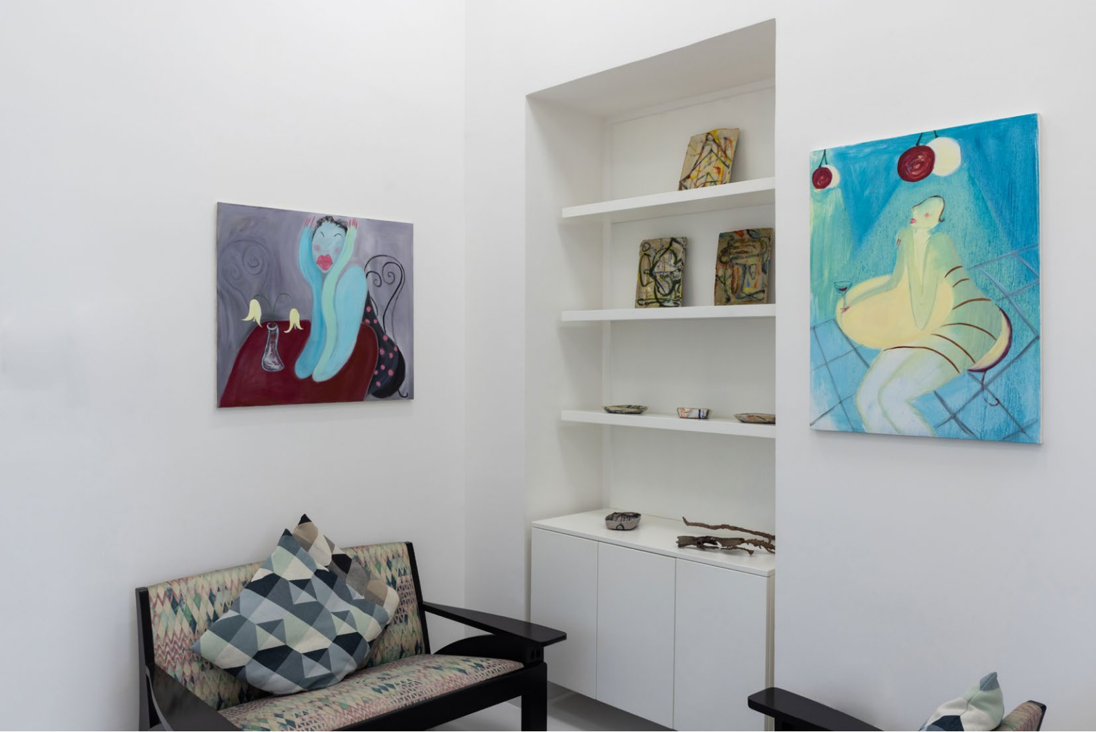
Our Souls at Night , 2025, exhibition view at Umberto Di Marino, Naples, IT