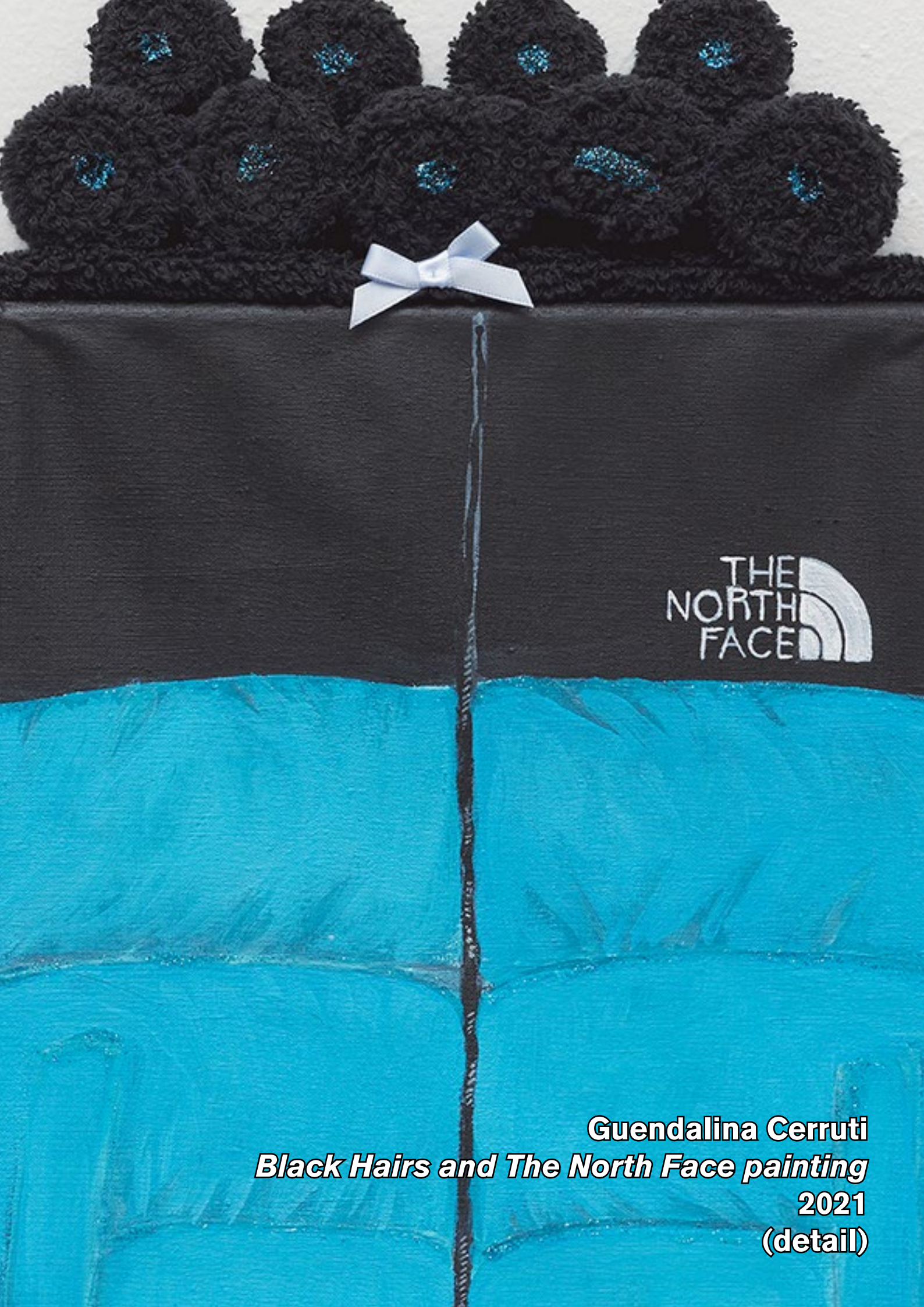
Guendalina Cerruti Black Hairs and The North Face painting 2021 (detail)