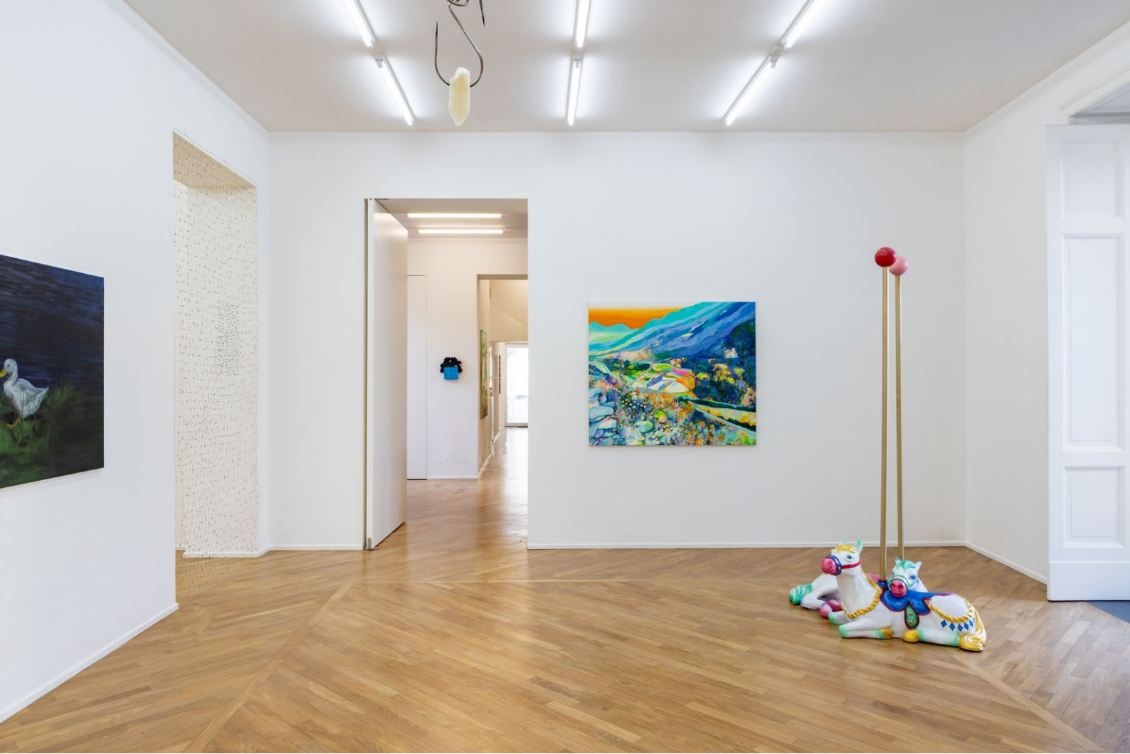
Our Souls at Night 2025 exhibition view at Umberto Di Marino, Naples, IT