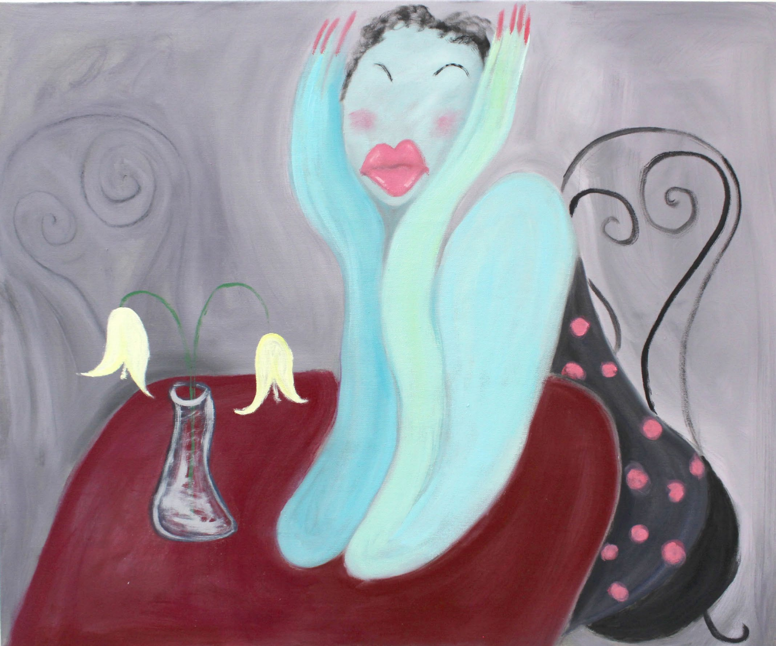
Yulia Zinshtein How soon is now 2024 oil and pastel on canvas cm 71 x 81