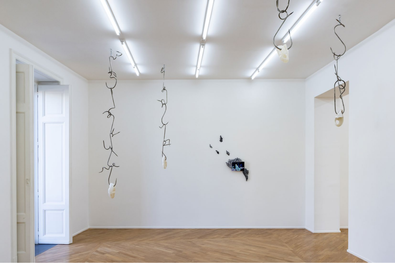
Our Souls at Night 2025 exhibition view at Umberto Di Marino, Naples, IT