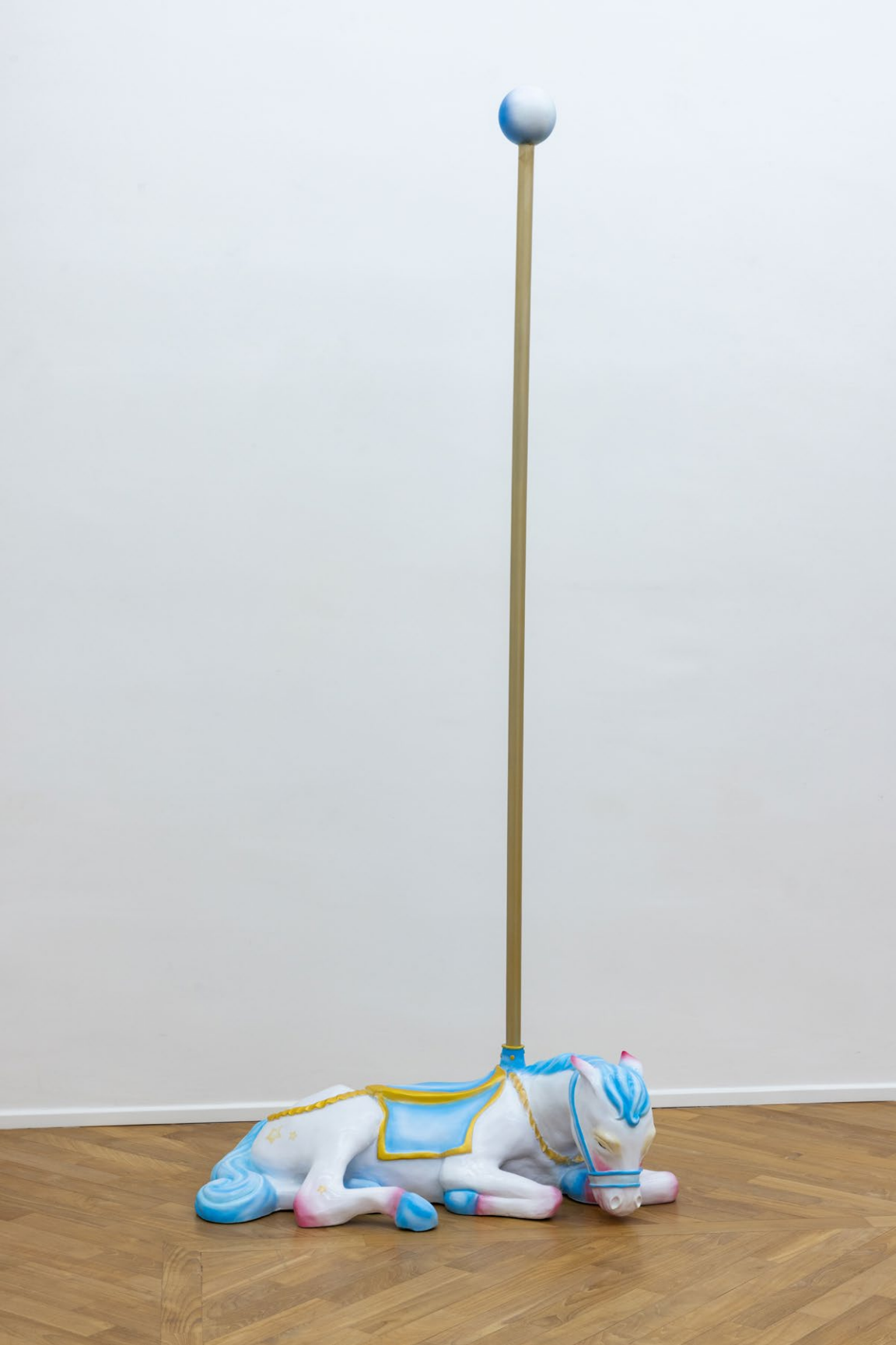
Gabriella Siciliano Mi manchi, Principe 2022 acrylic resin and varnish cm 32 x 100 x 47