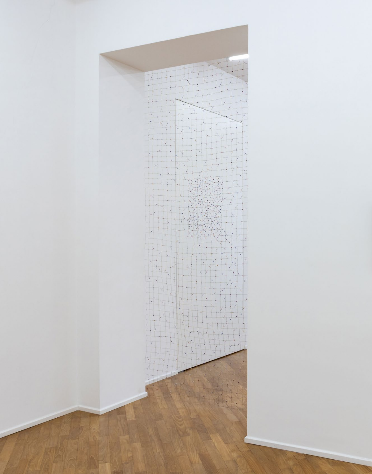
Guendalina Cerruti Tin Butterflies 2025 brass, tin, acrylic colours cm 300 x 140