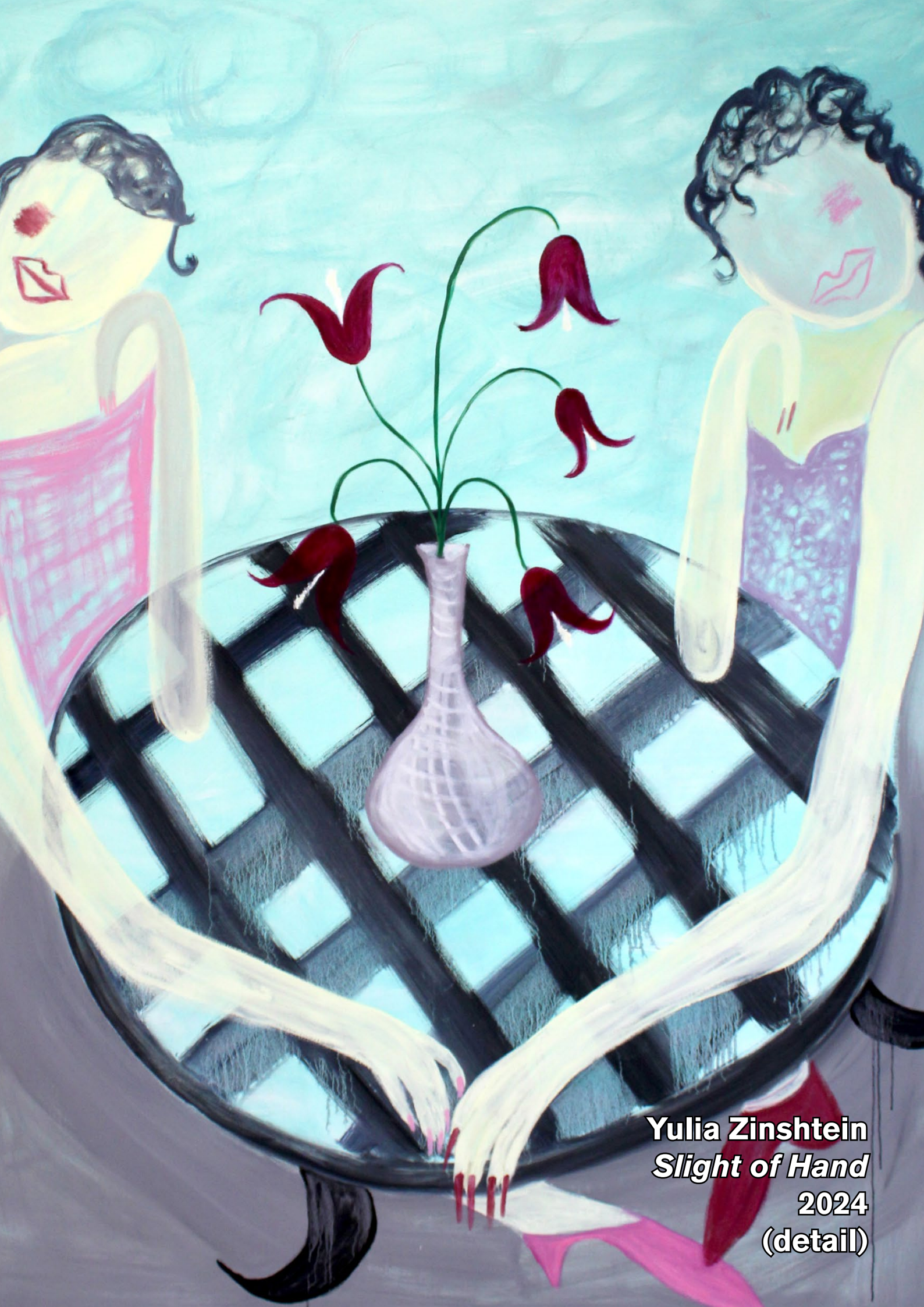
Yulia Zinshtein Slight of Hand 2024 (detail)