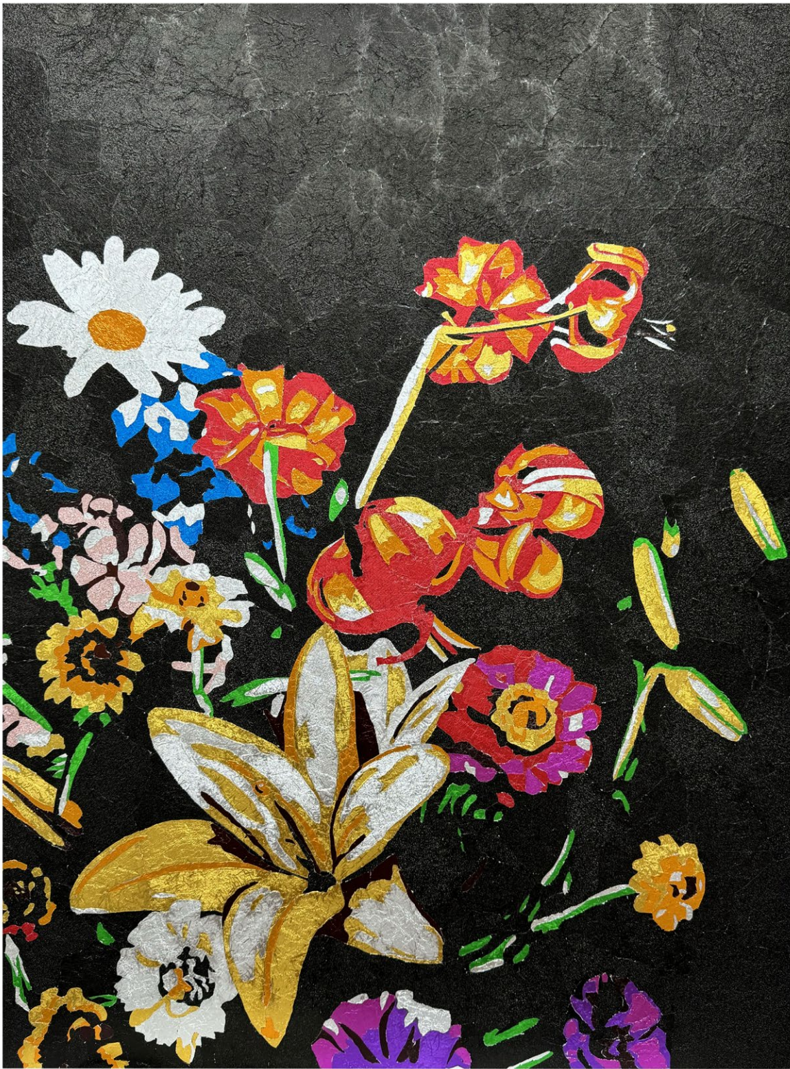
Gabriella Siciliano Easter '97 #2 2024 colored aluminum foil wrappers for chocolates, glue, PVC board cm 80 x 50