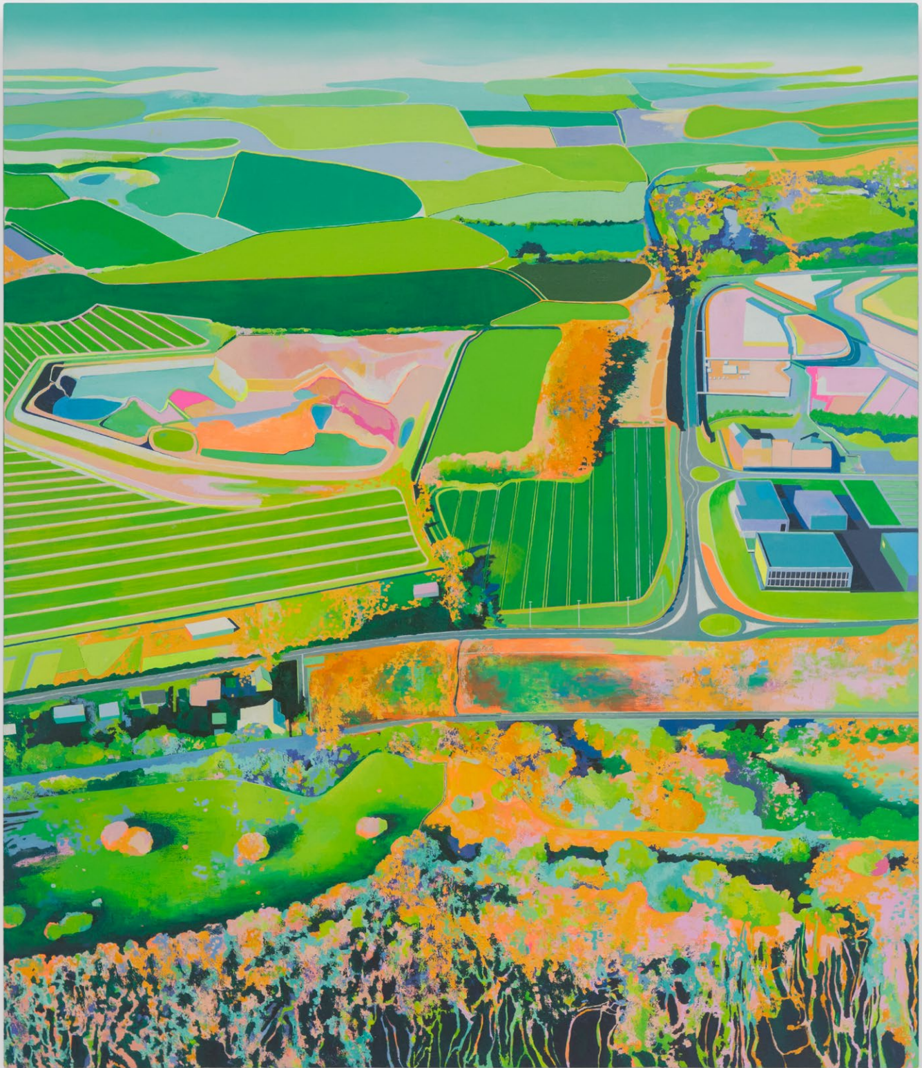
Miriam Marafiori Dopo la Manica #1 2024 mixed media on canvas cm 140 x 120