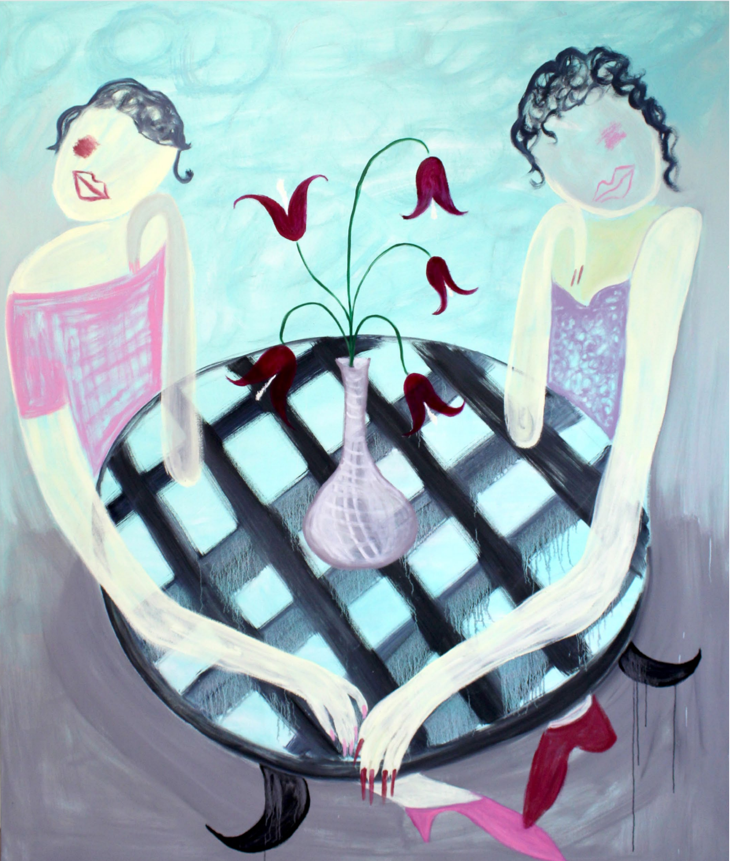
Yulia Zinshtein Slight of Hand 2024