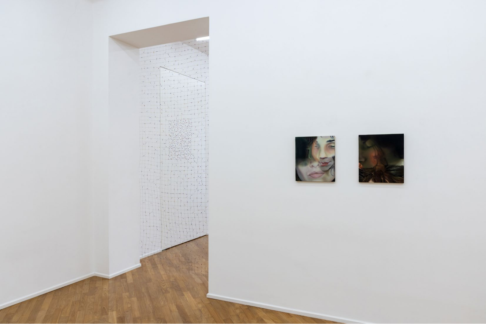
Our Souls at Night 2025 exhibition view at Umberto Di Marino, Naples, IT