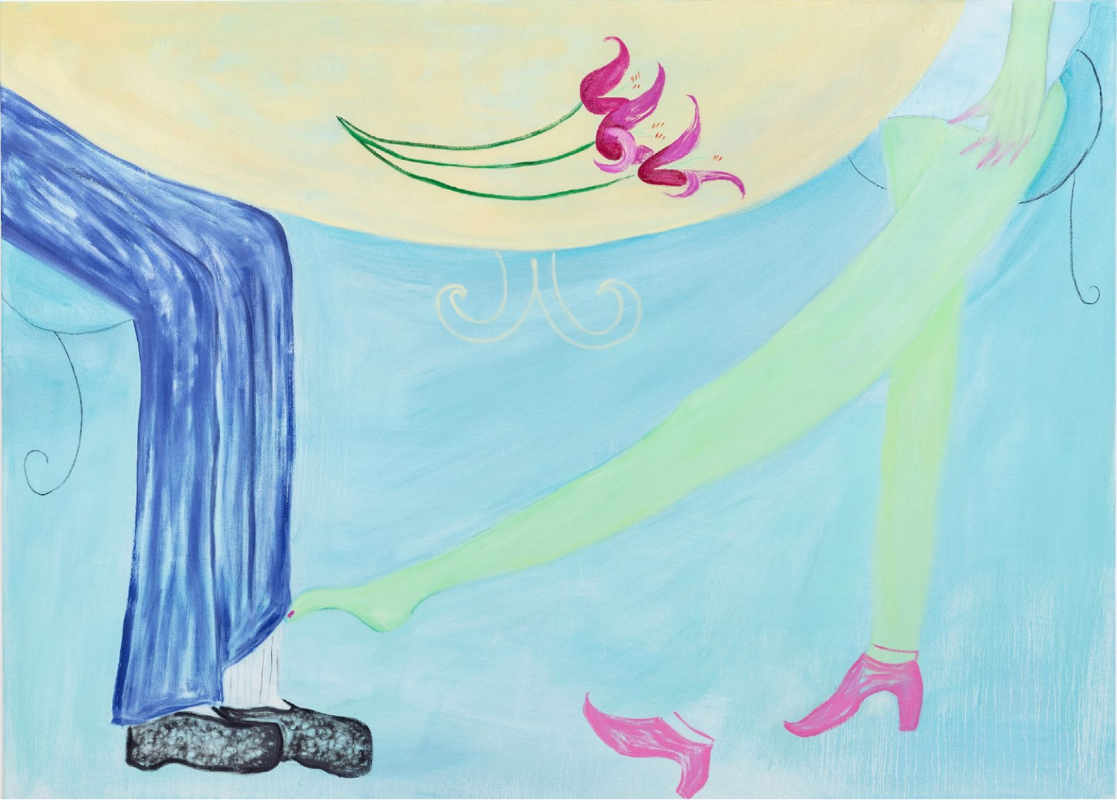
Yulia Zinshtein Footies 2024 oil and pastel on canvas cm 130 x 180