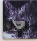
Our Souls at Night 2025 exhibition view at Umberto Di Marino, Naples, IT