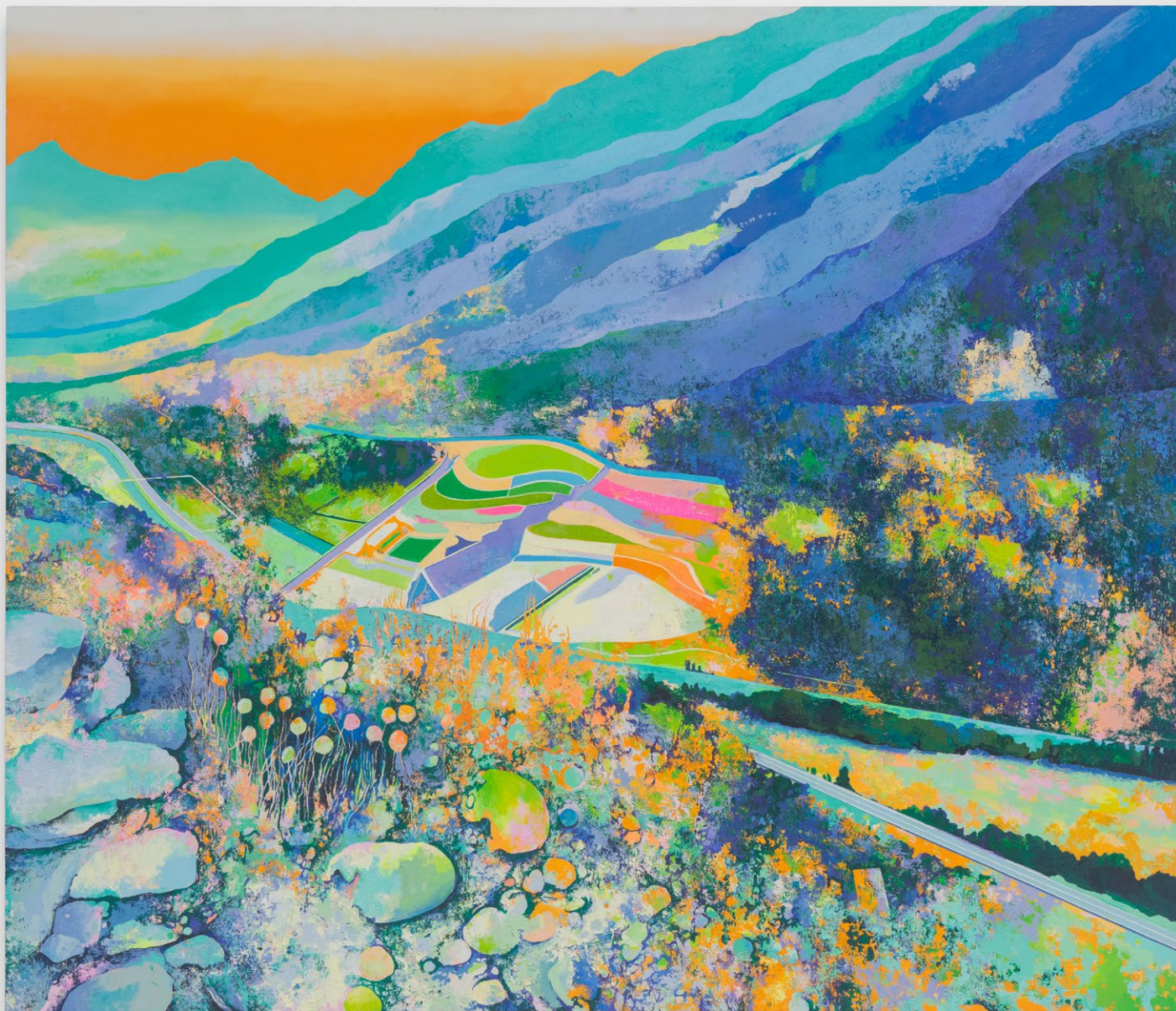
Miriam Marafioti A/In Valle 2024 mixed media on canvas cm 120 x 140