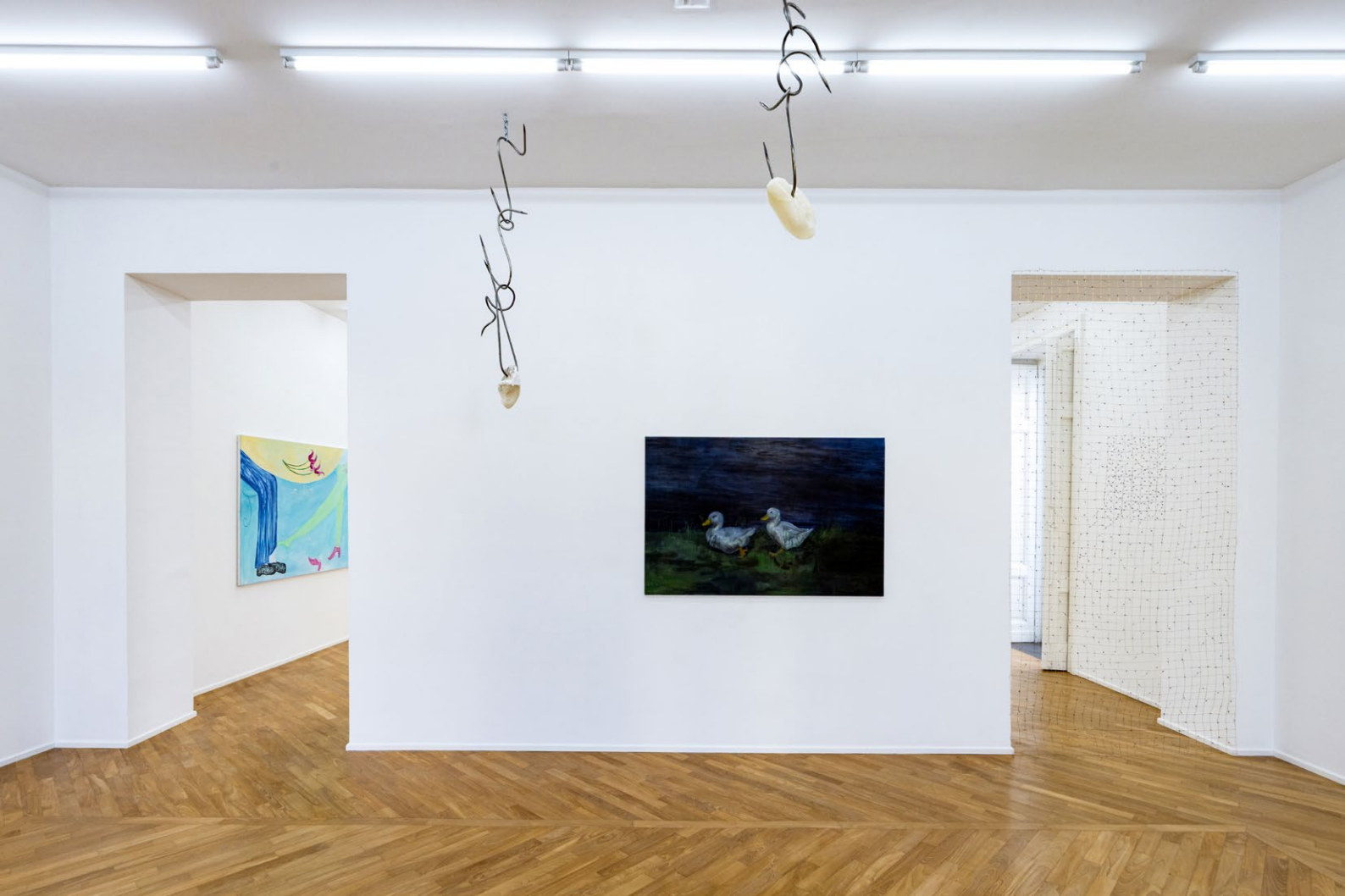
Our Souls at Night , 2025, exhibition view at Umberto Di Marino, Naples, IT