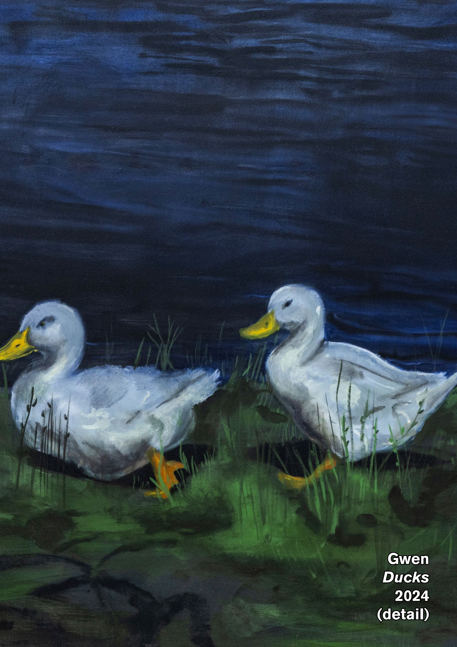
Gwen Ducks 2024 (detail)