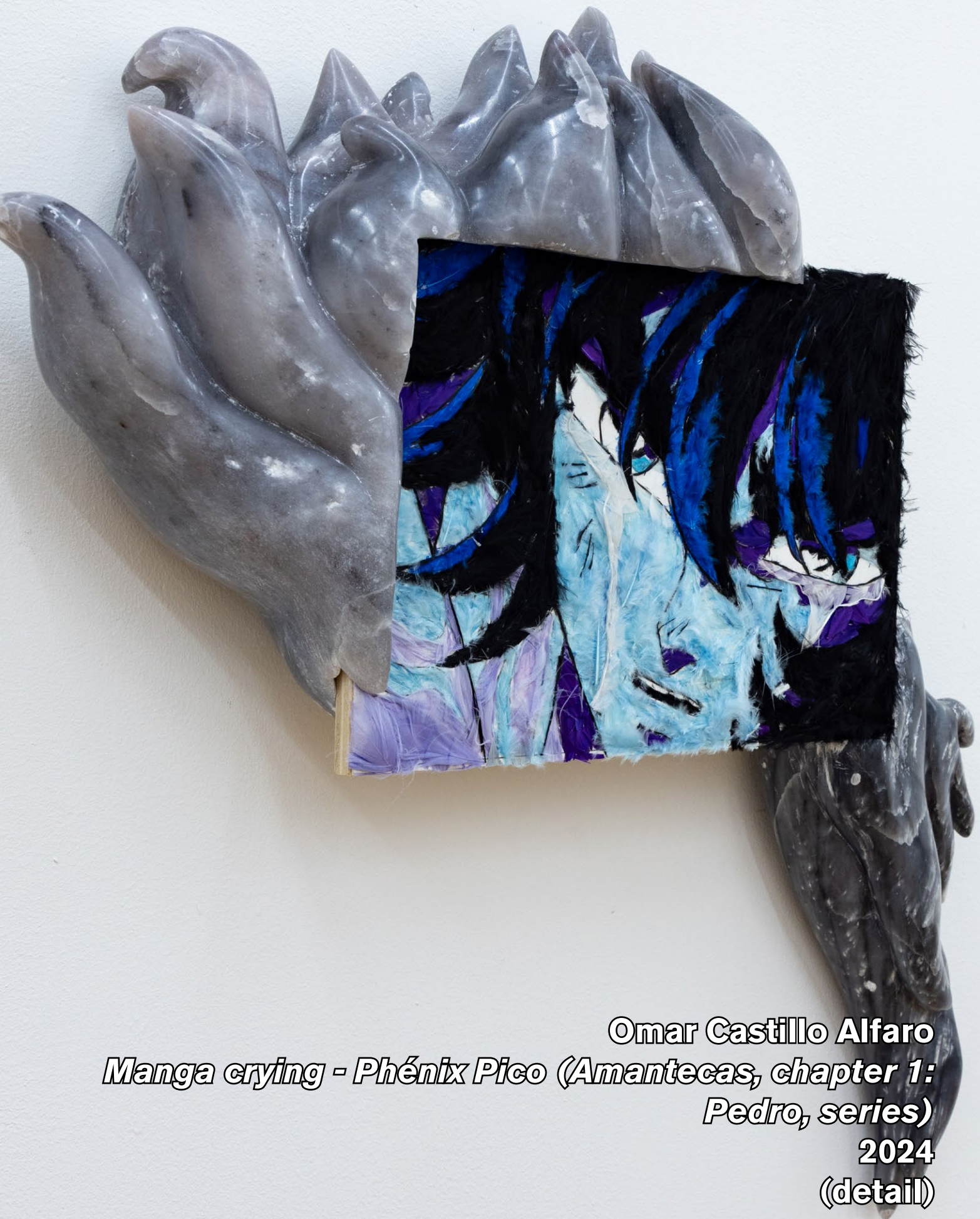
Omar Castillo Alfaro Manga crying - Phénix Pico (Amantecas, chapter 1: Pedro, series) 2024 (detail)