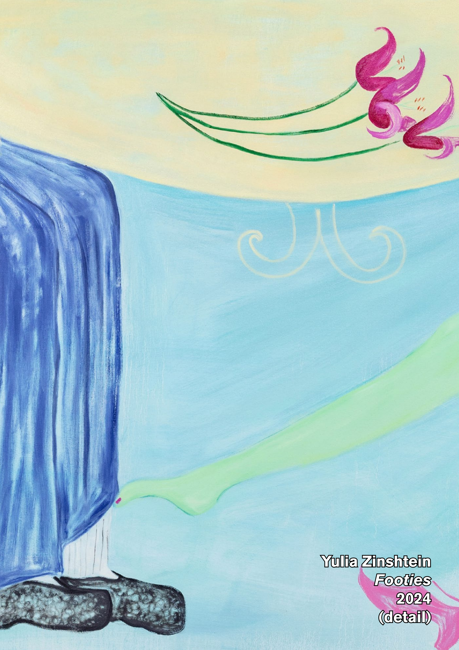
Yulia Zinshtein Footies 2024 (detail)