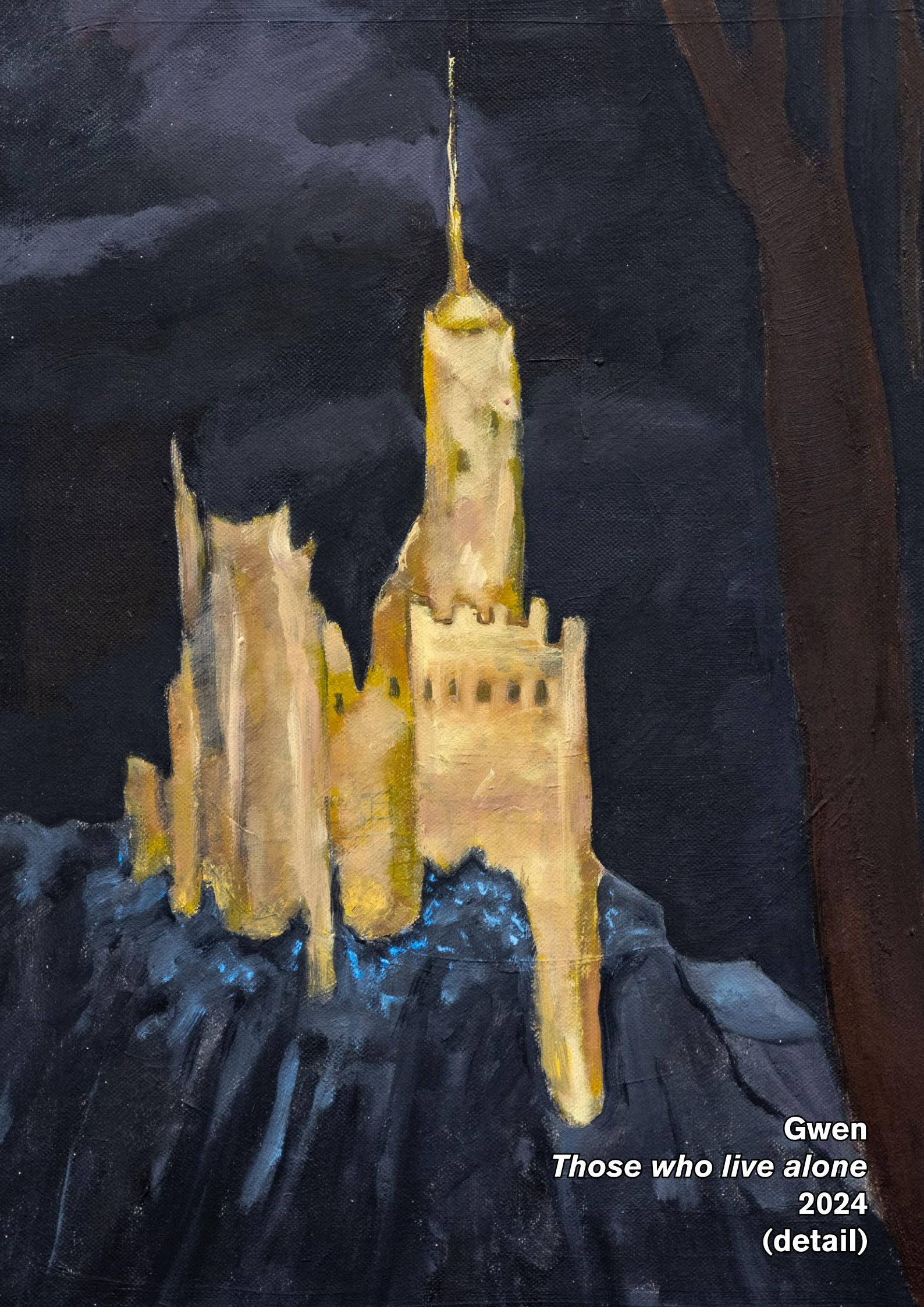
Gwen Those who live alone 2024 (detail)