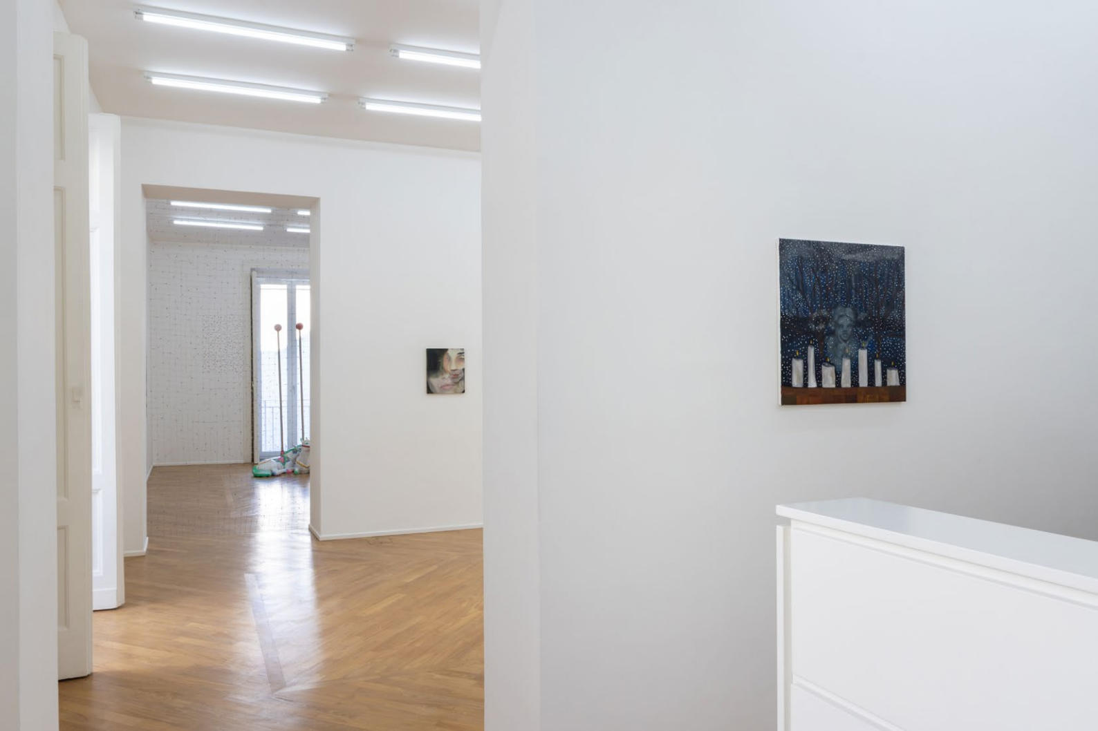
Our Souls at Night 2025 exhibition view at Umberto Di Marino, Naples, IT