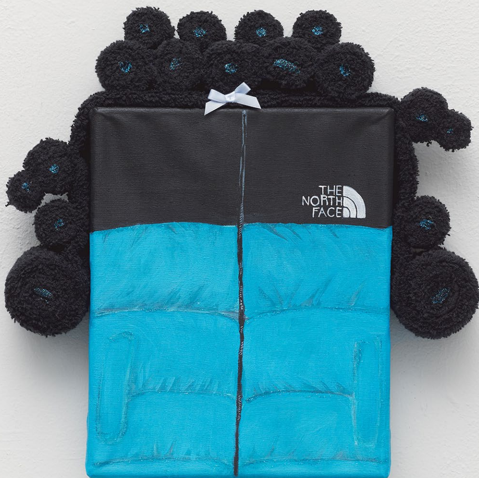
Guendalina Cerruti Black Hairs and The North Face painting 2021

acrylic paint on canvas, glitters, towel fabric, ribbon cm 30 x 30