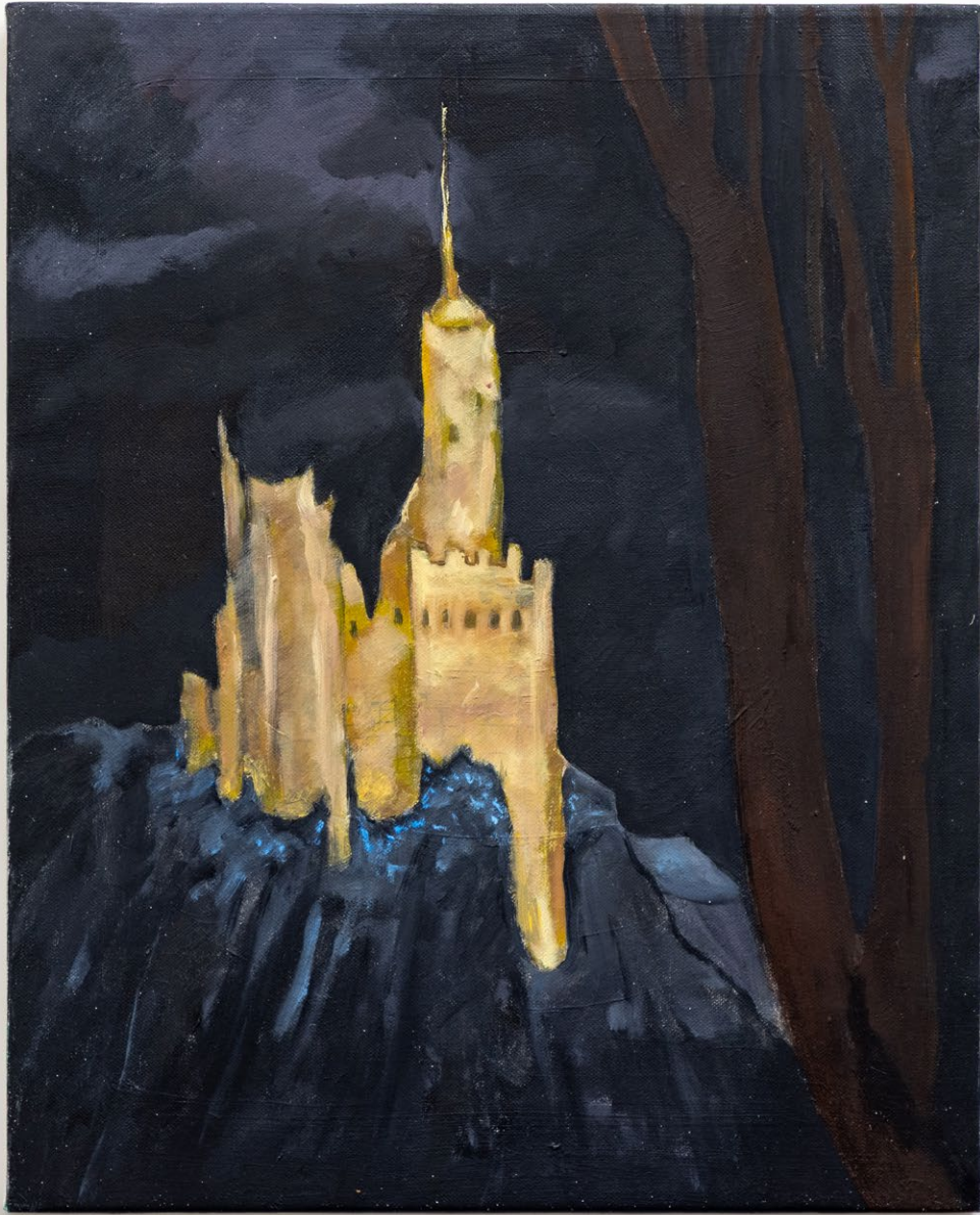
Gwen Those who live alone 2024 oil on canvas cm 50 x 40