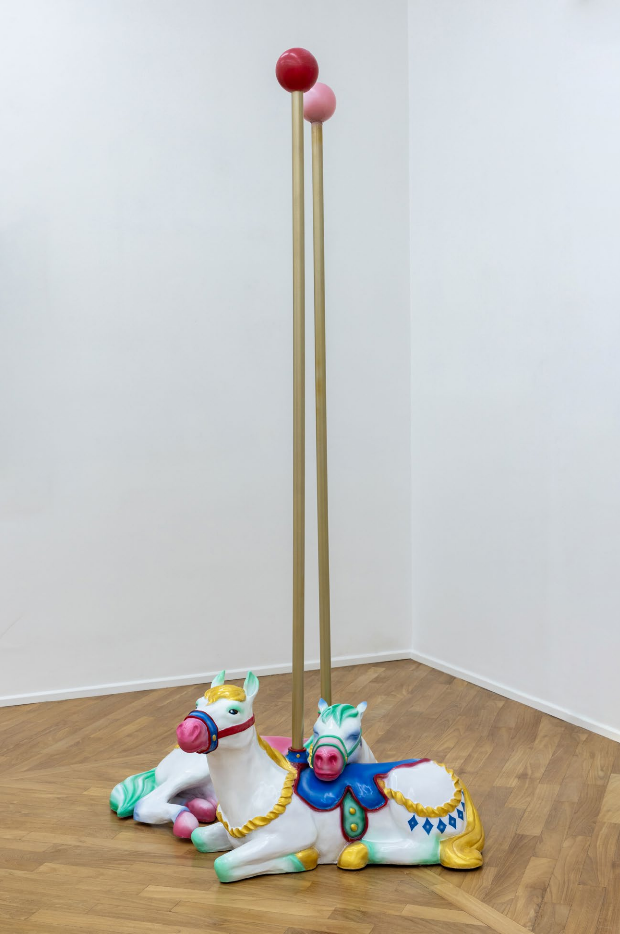
Gabriella Siciliano Mi manchi, Capitan America e Confetta 2022 acrylic resin and varnish cm 115 x 58 x 85