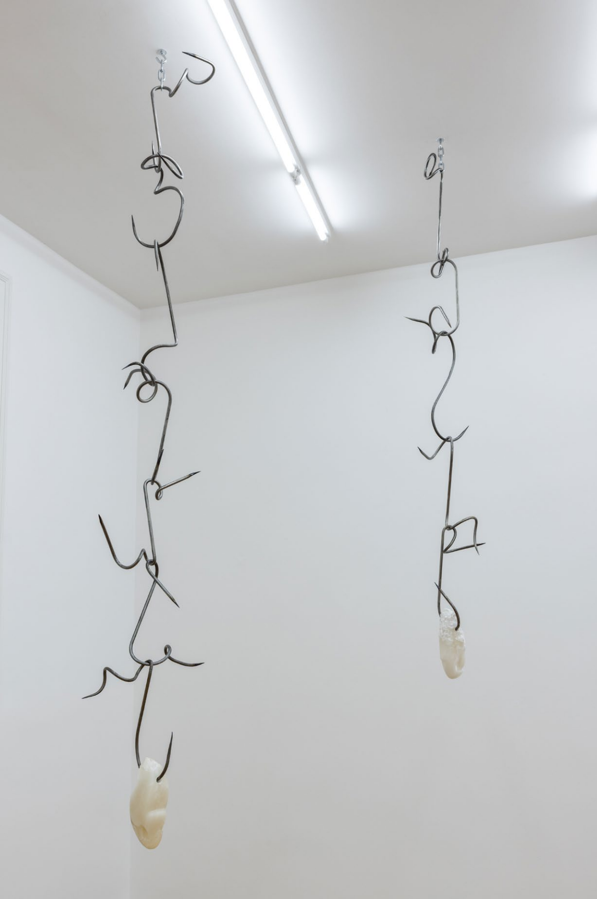
Omar Castillo Alfaro Chute 3/5 - Pedro (Amantecas, chapter 1: Pedro, series) 2024 alabaster and metal dimensions variable