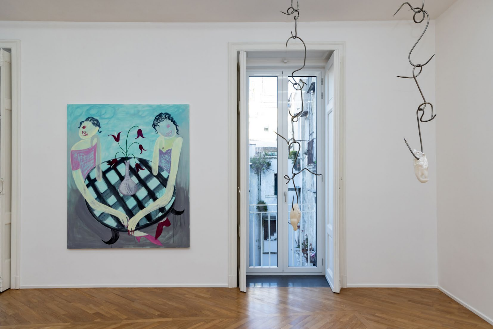
Our Souls at Night 2025 exhibition view at Umberto Di Marino, Naples, IT