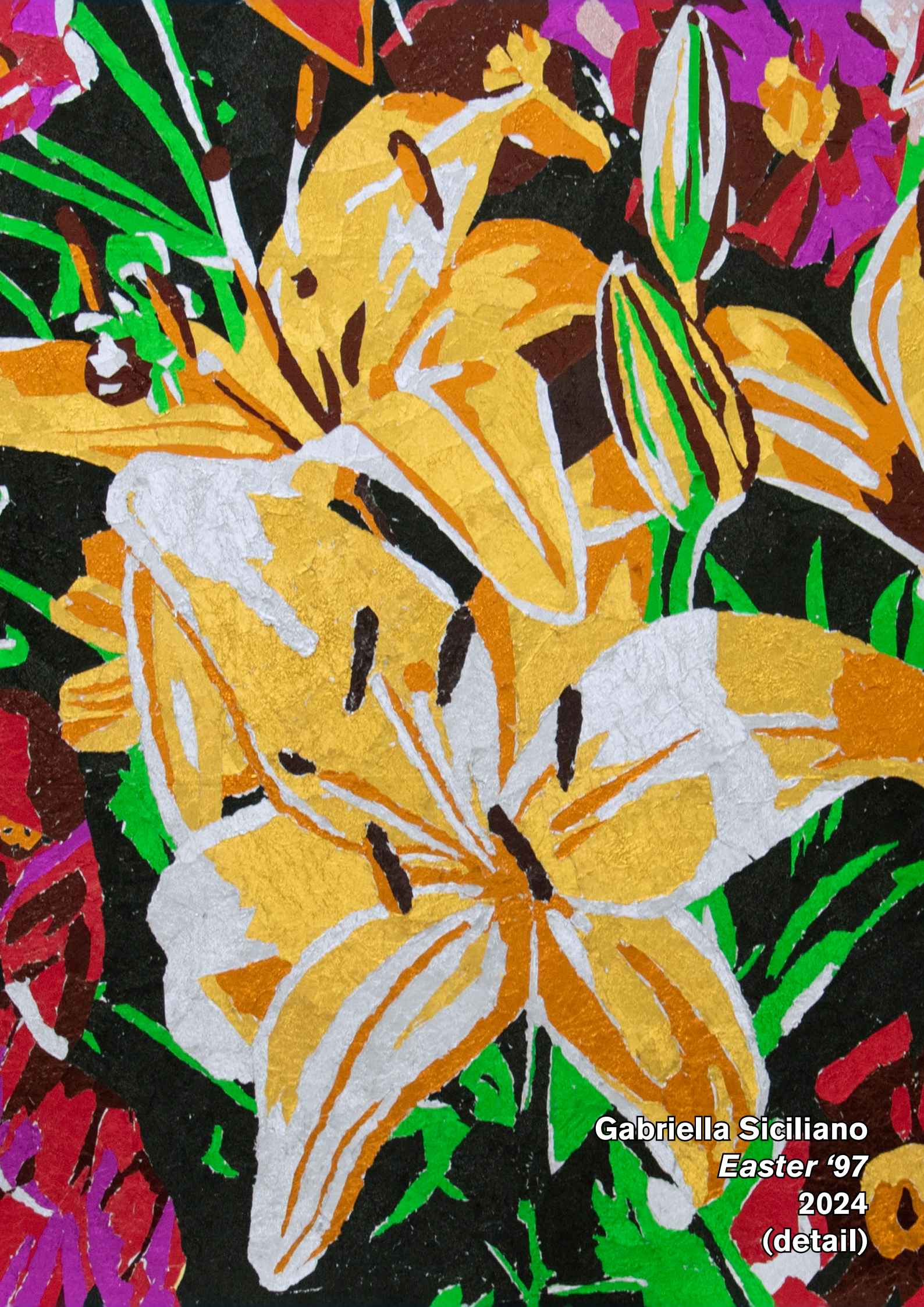
Gabriella Siciliano Easter '97 2024 (detail)