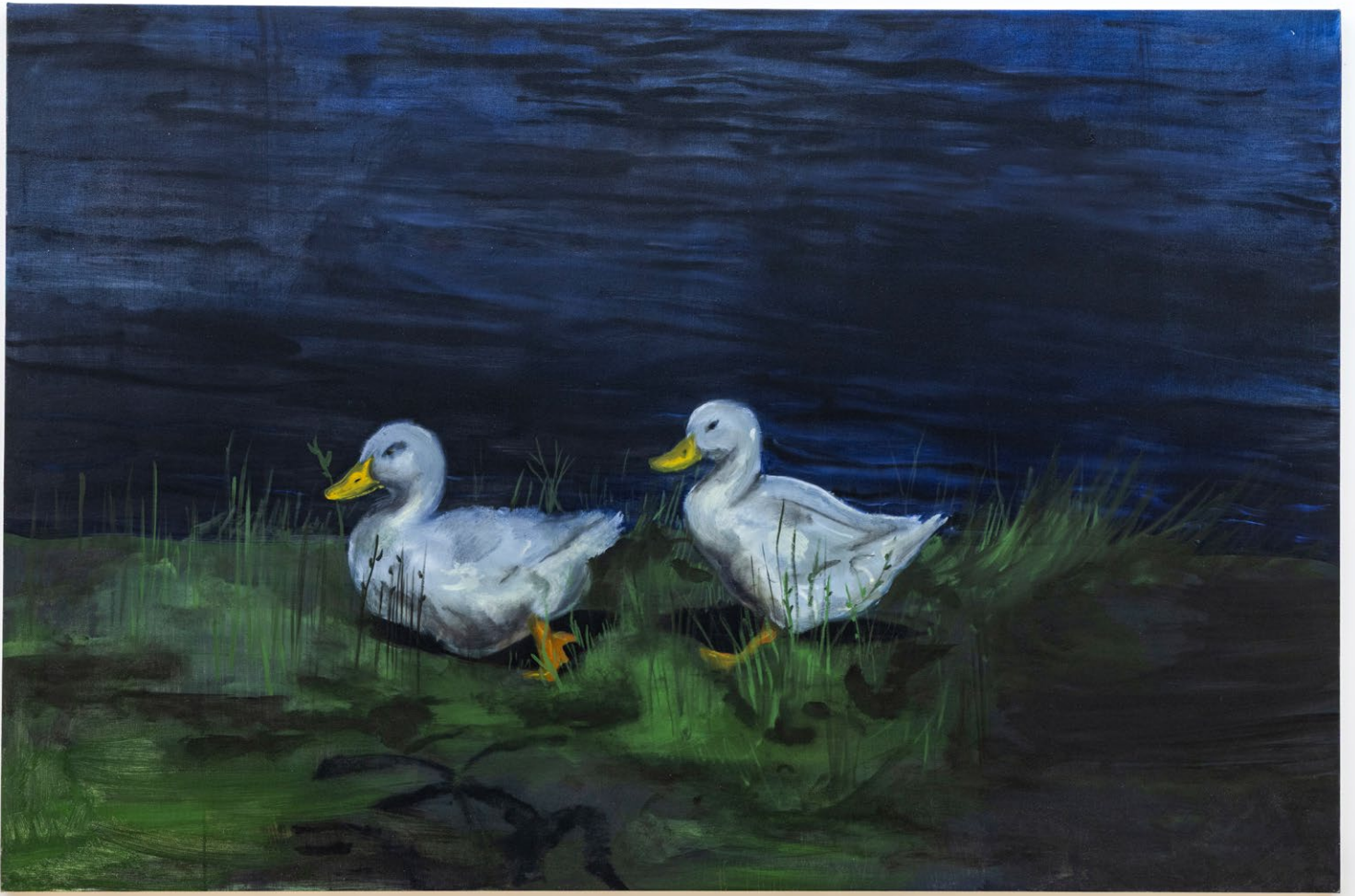
Gwen Ducks 2024 oil on canvas cm 98 x 148