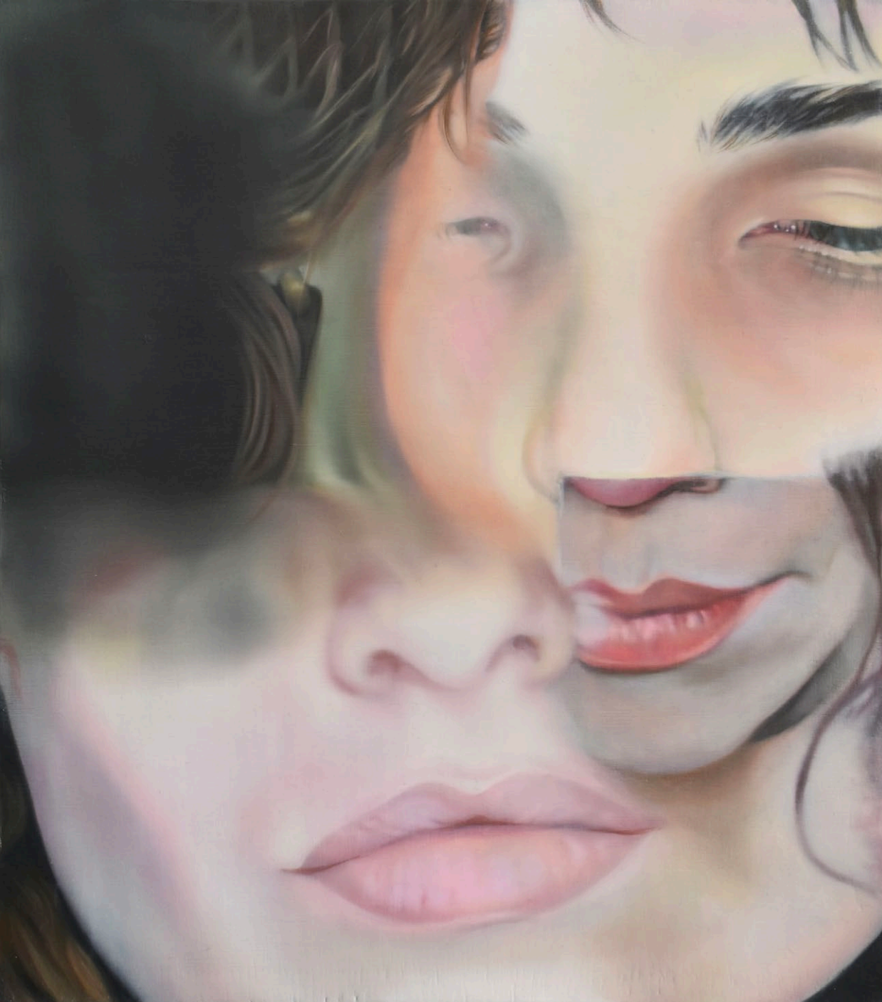
Margherita Mezzetti Fortuna 2024 oil on board cm 41.5 x 36