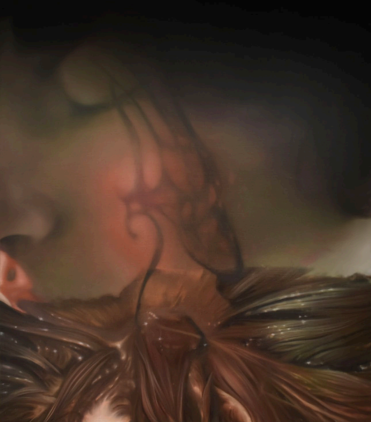
Margherita Mezzetti Butterfly 2024 oil on board cm 41.5 x 36