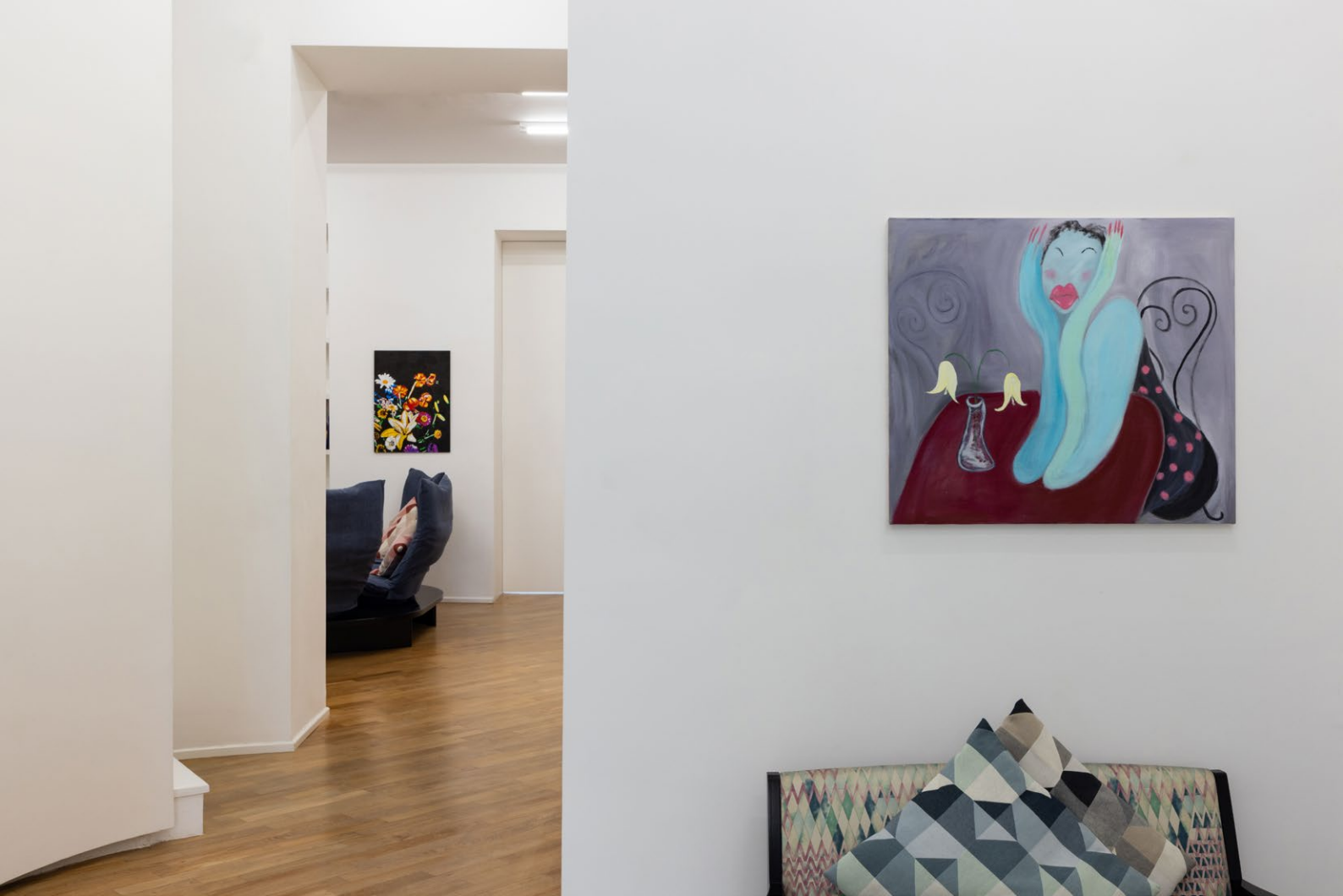
Our Souls at Night 2025 exhibition view at Umberto Di Marino, Naples, IT