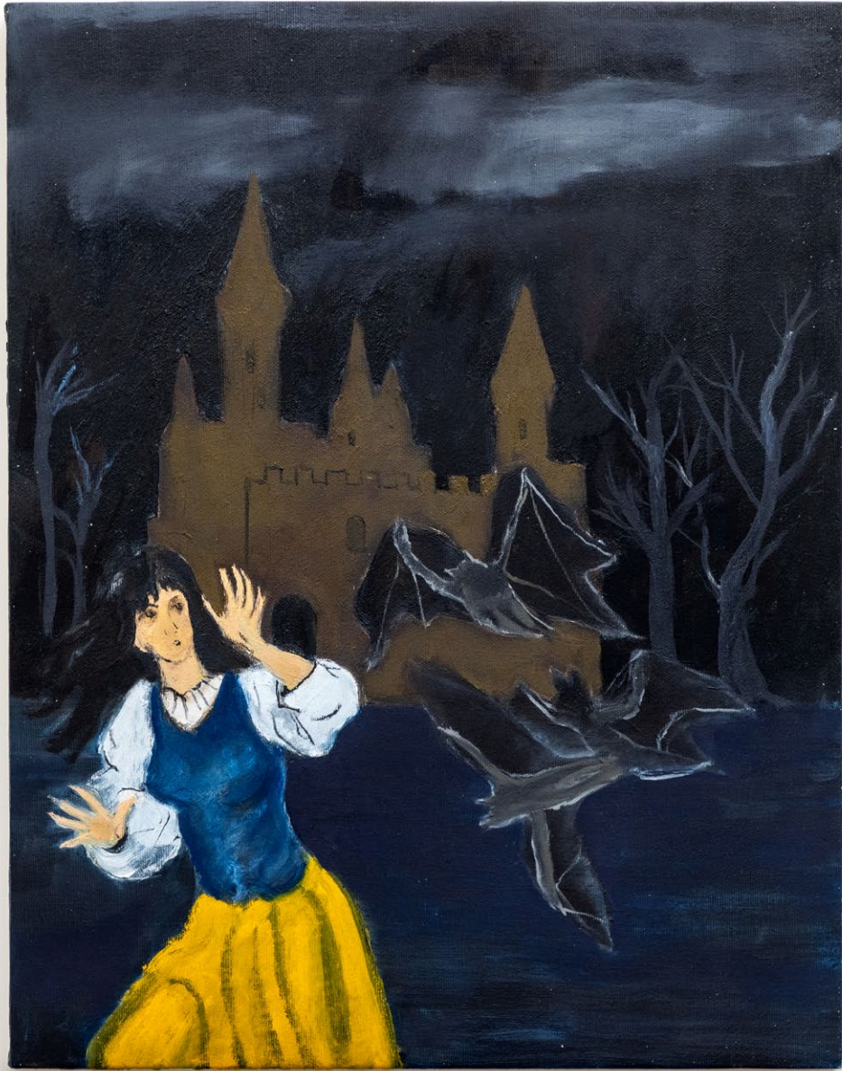
Gwen White loses her mind 2024 oil on canvas cm 50 x 40