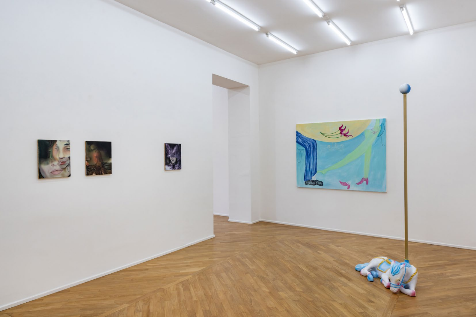
Our Souls at Night, 2025 , exhibition view at Umberto Di Marino, Naples, IT