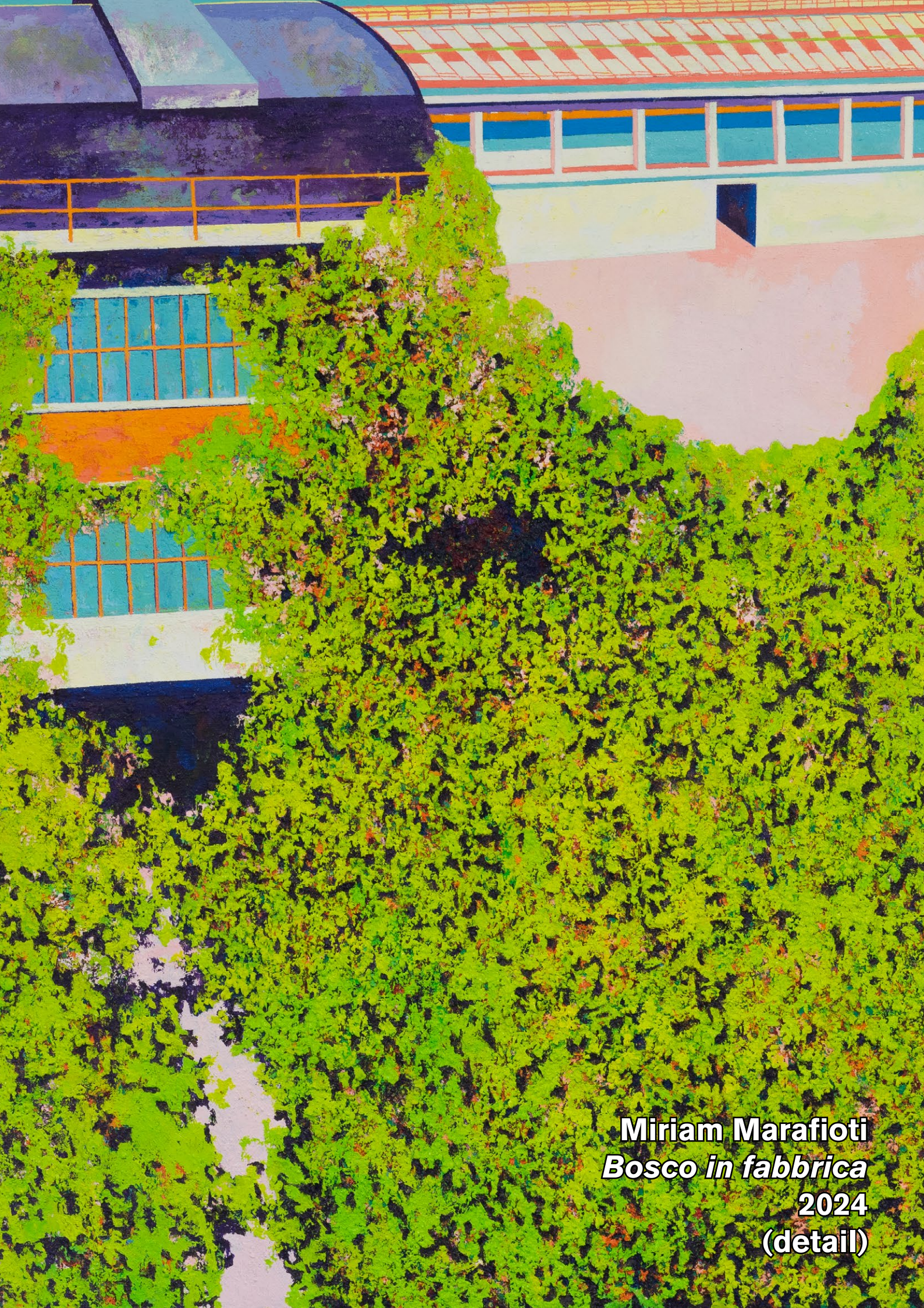
Miriam Marafioti Bosco in fabbrica 2024 (detail)