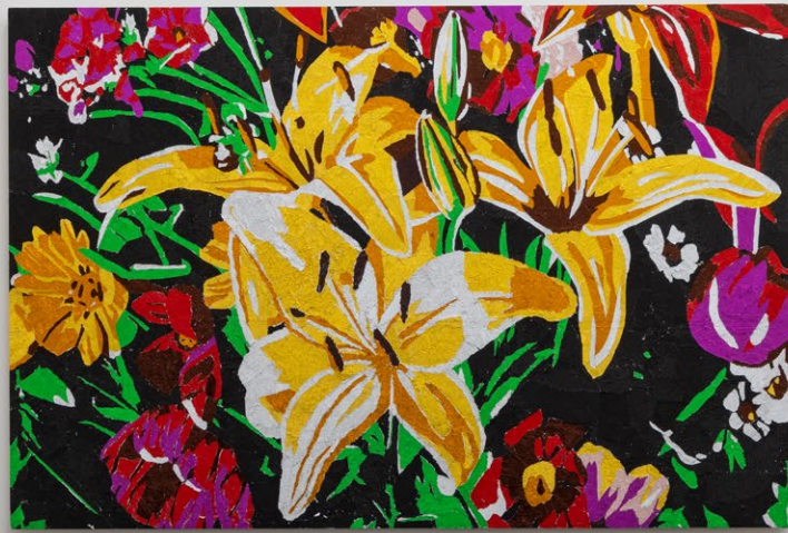
Our Souls at Night 2025 exhibition view at Umberto Di Marino, Naples, IT