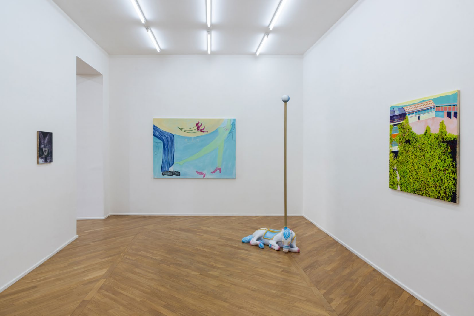
Our Souls at Night 2025 exhibition view at Umberto Di Marino, Naples, IT