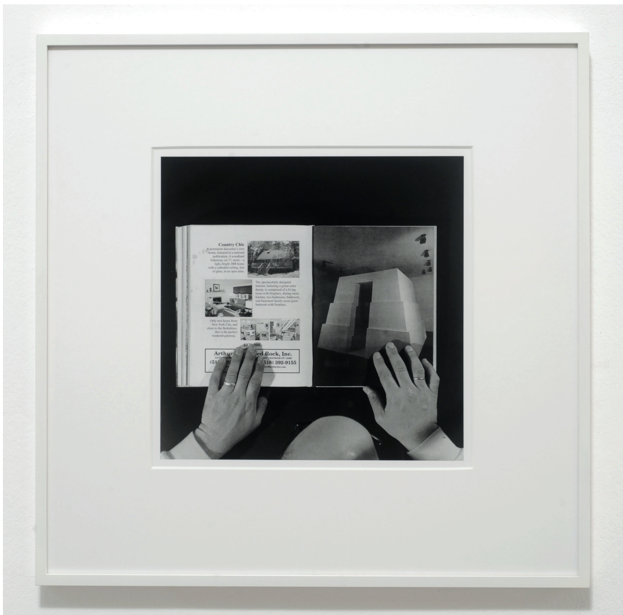
Research Based Practice , 2016 (with Frank Stürmer) Gelatin silver print on baryt paper 27 x 27 cm Edition 1/1 + 2 AP