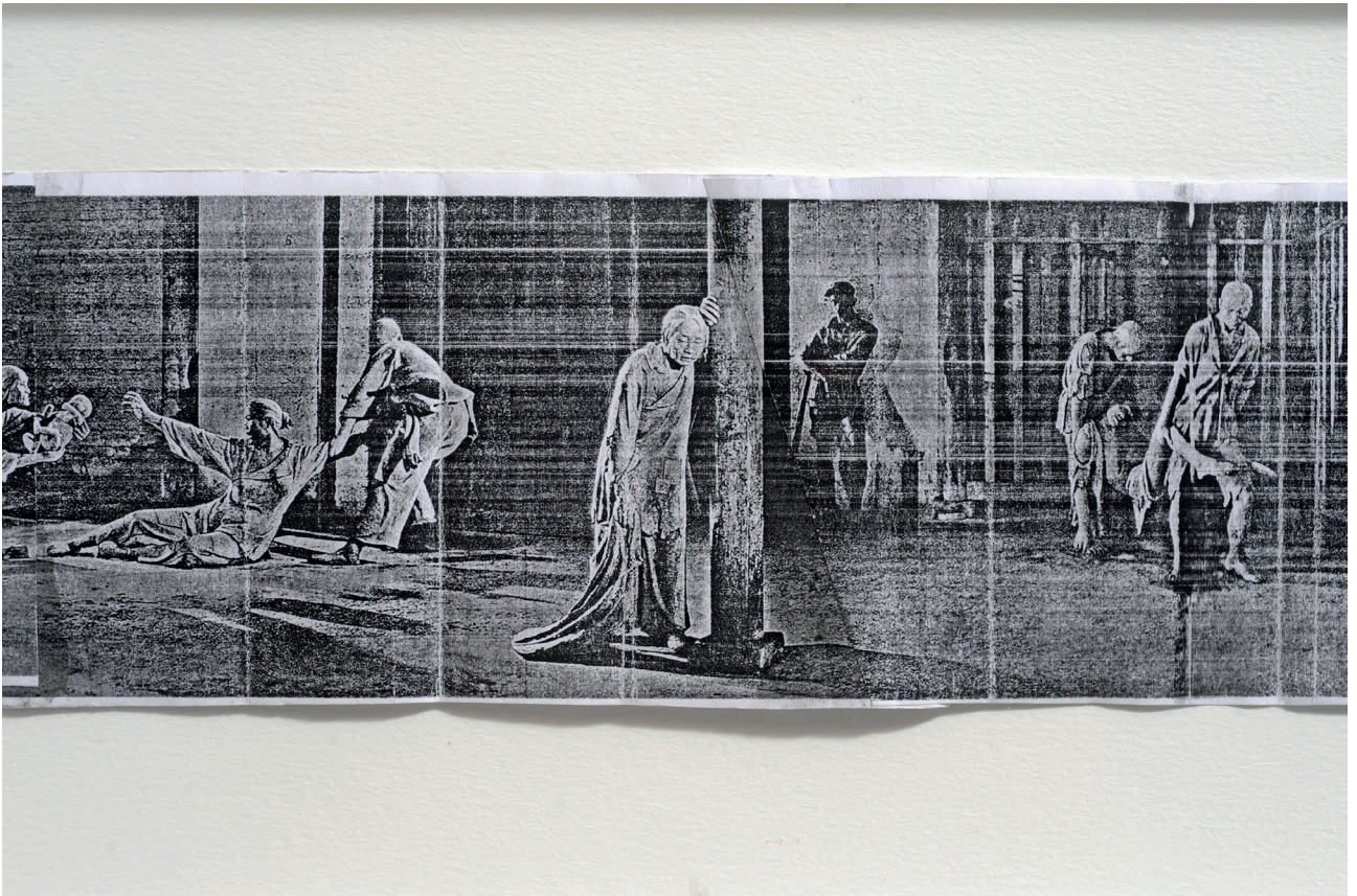
Detail from Samizdat , 2015 (Detail)