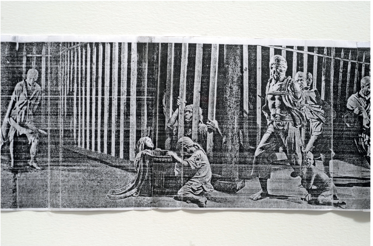
Samizdat, 2015 (Detail)