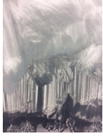
Oder das Licht geht aus , 2016 Chalk base, egg tempera, pigmented shellac 22,5 x 15 x 4 cm