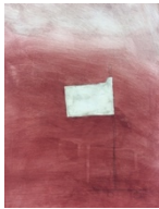
Lonely flag in the mountains , 2016 Chalk base, egg tempera, pigmented shellac 47 x 36,5 x 4 cm