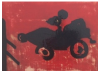
Crash , 2016 Chalk base, egg tempera, pigmented shellac 36,5 x 48,5 x 4 cm