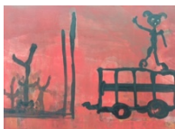
Schnabeltassen für Alle – Ich wandre aus nach Mexiko , 2016 Chalk base, egg tempera, pigmented shellac 33 x 47 x 4 cm