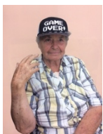
Game over , 2016 Photo print, spray paint 42 x 29,8 cm