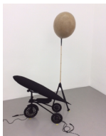
Jerk bomb with balloon , 2016 Metal, wood, epoxy, fiberglass, rubber 185 x 120 x 75 cm