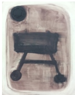
Jeder klatscht für sich allein , 2016 Chalk base, egg tempera, pigmented shellac 47 x 36,5 x 4 cm