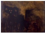
Kerzen machen es wohnlicher , 2016 Chalk base, egg tempera, pigmented shellac 37,5 x 47 x 4 cm