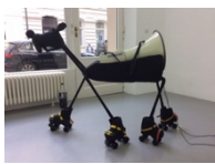
Yes I can , 2016 Metal, K1 foam, leather, PE, epoxy, rubber, linen tape 100 x 200 x 70 cm

1st Room „The smallest circle parade off the world“ (from left to right)