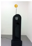
A fried goat kid talks about today, yesterday and tomorrow , 2016 Wood, glas, metal, fabric, linen tape 245 x 60 x 32 cm