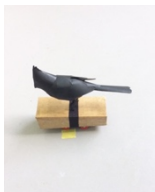
I'm not a sparrow , 2016 Wood, metal, paper, rubber, styrofoam, shellac 19 x 22 x 7 cm