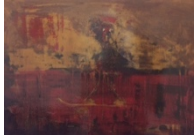
Madison Street 515 , 2016

Chalk base, egg tempera, pigmented shellac 36,5 x 49,5 x 4 cm