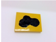
Aus der Ferne ist die Sicht getrübt , 2016 chalk base, egg tempera, pigmented shellac 17,5 x 23 x 4 cm