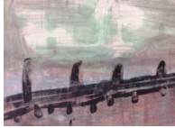
Landscape , 2016 Chalk base, egg tempera, pigmented shellac 36,5 x 47 x 4 cm