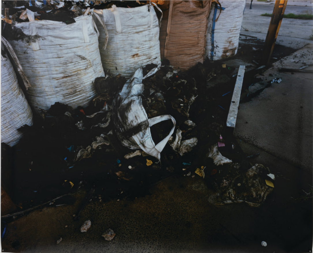
Dylan Marriott, "Refuse Process", 2022 Hand printed chromogenic print 1200 x 1500 mm. Ed 1/3 + 1AP.