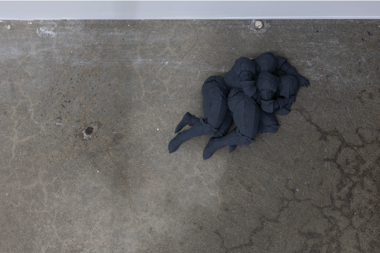
James Little, “youtu.be/L3PAHRzIBnA”, 2025 Inkjet print on glossy photo paper on aluminium panel, steel, PLA 330 x 450 mm