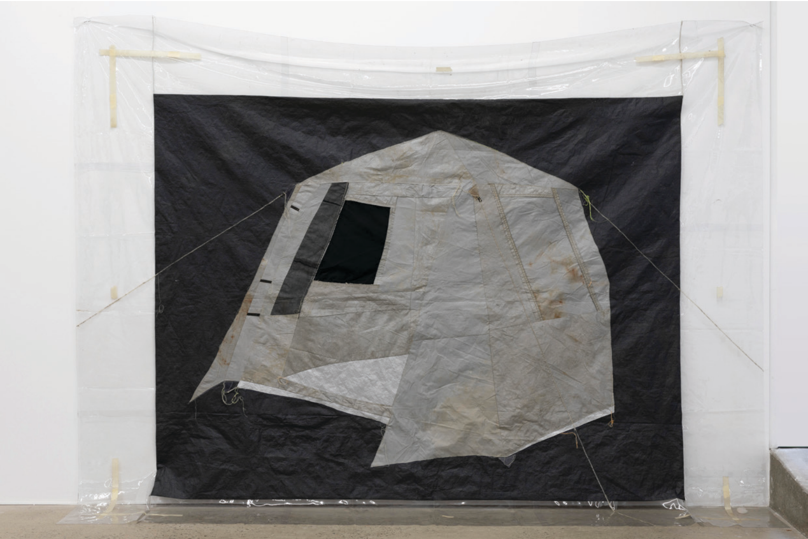
Mitchell Davis, "Crescent reflection", 2024 Tent, tarpaulin, cotton thread, polythene sheeting and masking tape 2250 x 2700 mm