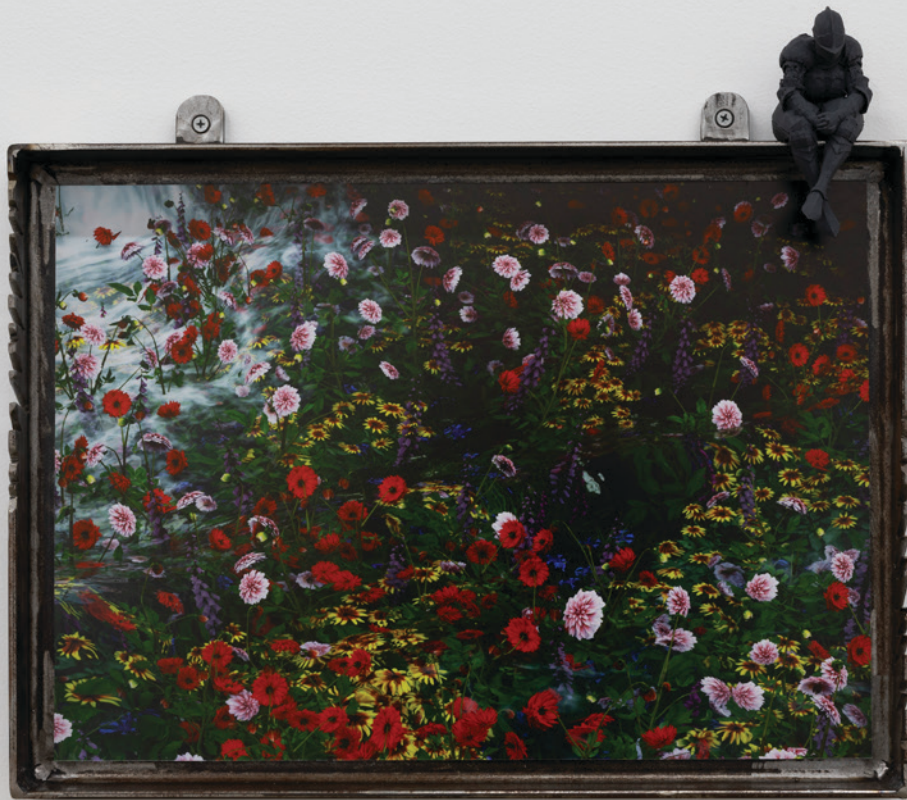
James Little, "youtu.be/z7_LwuuPsAE", 2025 PLA 210 x 220 x 60 mm