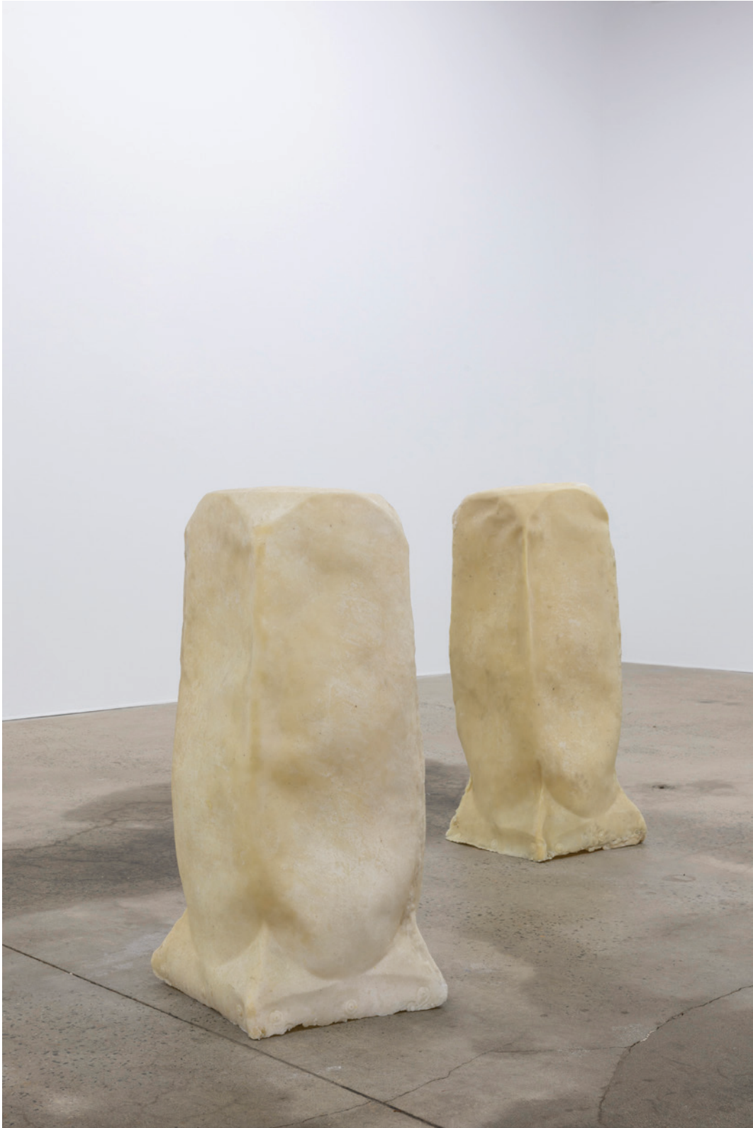
Charlotte Simpson, "Fate of the world", 2023 Beeswax 2 pieces; both 300 x 300 x 850 mm