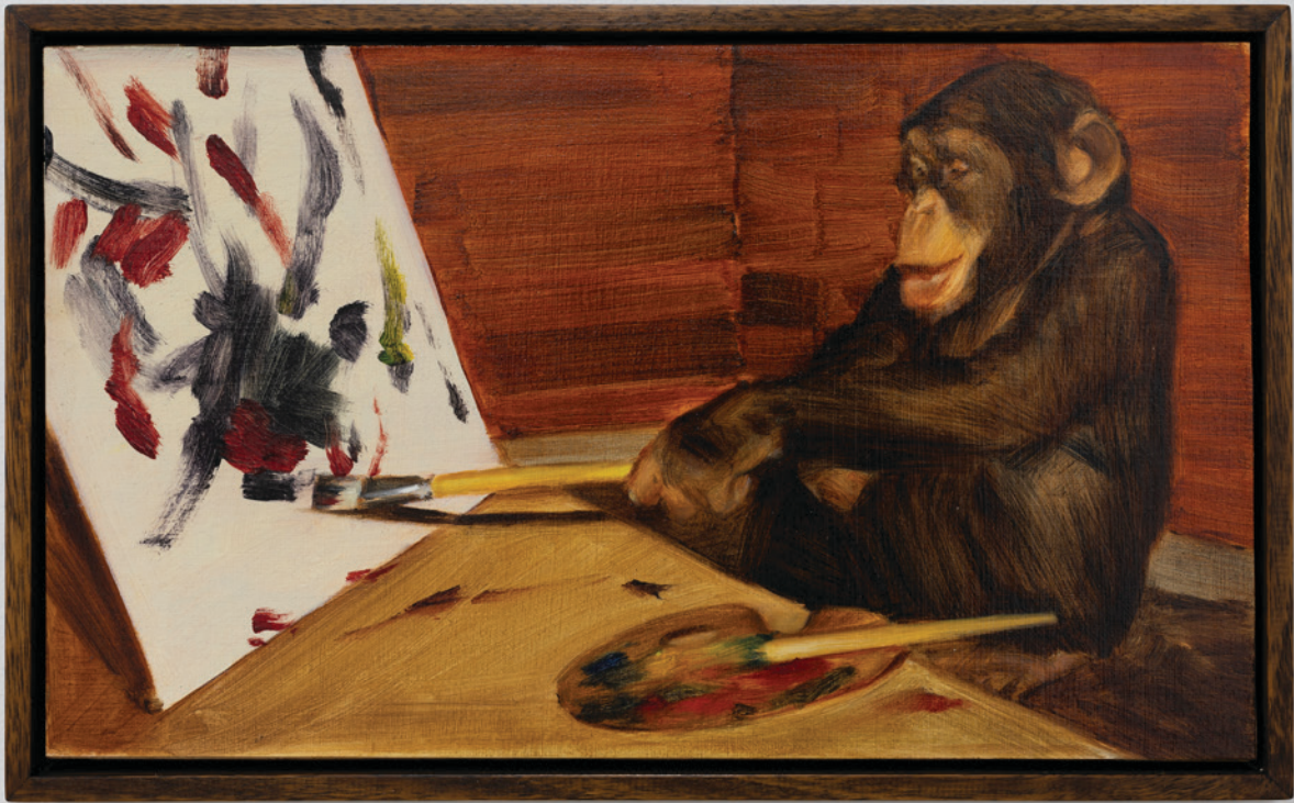
Bridget Stehli, "The Painter", 2025 Oil on mounted paper, artist's frame 240 x 390 mm