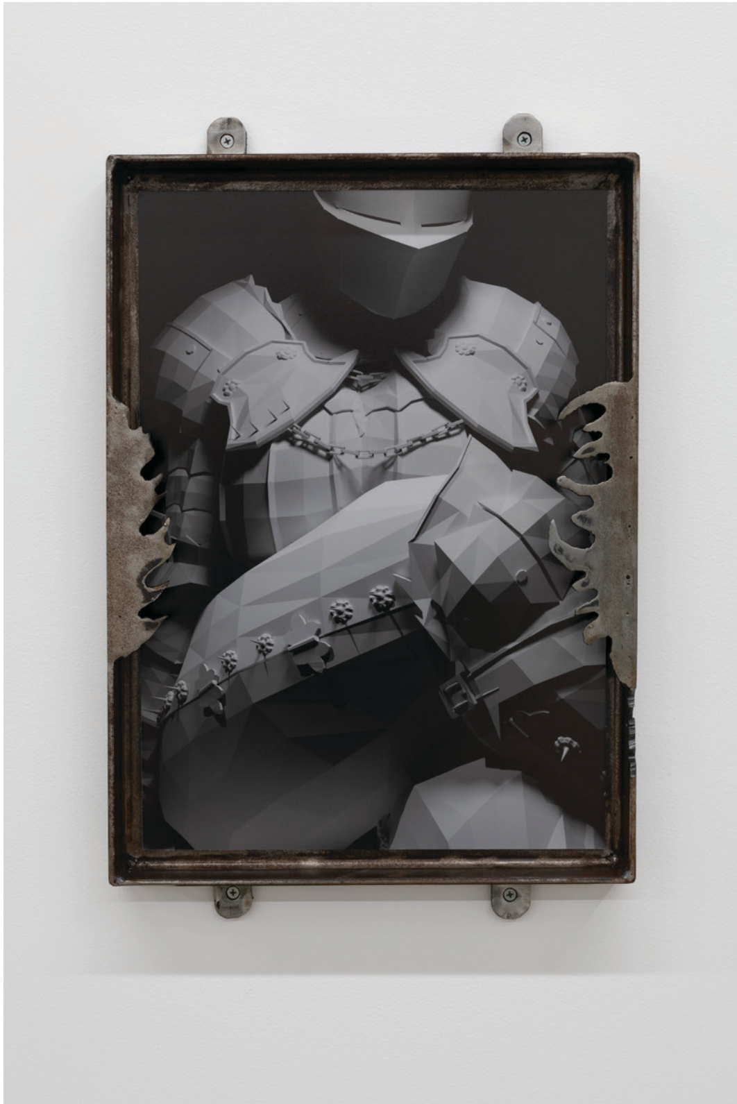
James Little, "youtu.be/mexs39y0lmw", 2025 Inkjet print on glossy photo paper on aluminium panel, steel, PLA 450 x 330 mm