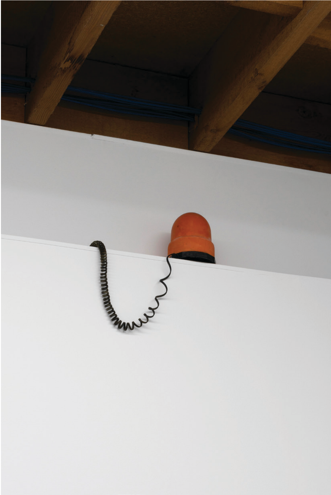
Anthea Duffy, "Doldrum", 2024 Encaustic wax, beeswax, metal swarf, found cord 150 x 680 x 120 mm