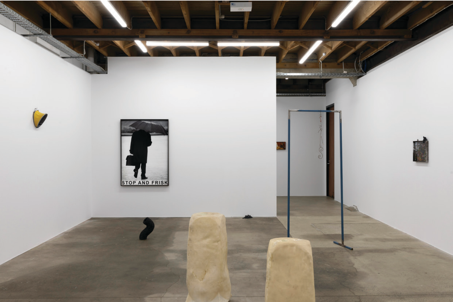
Installation view 'You got this' 8 February - 1 March, 2025