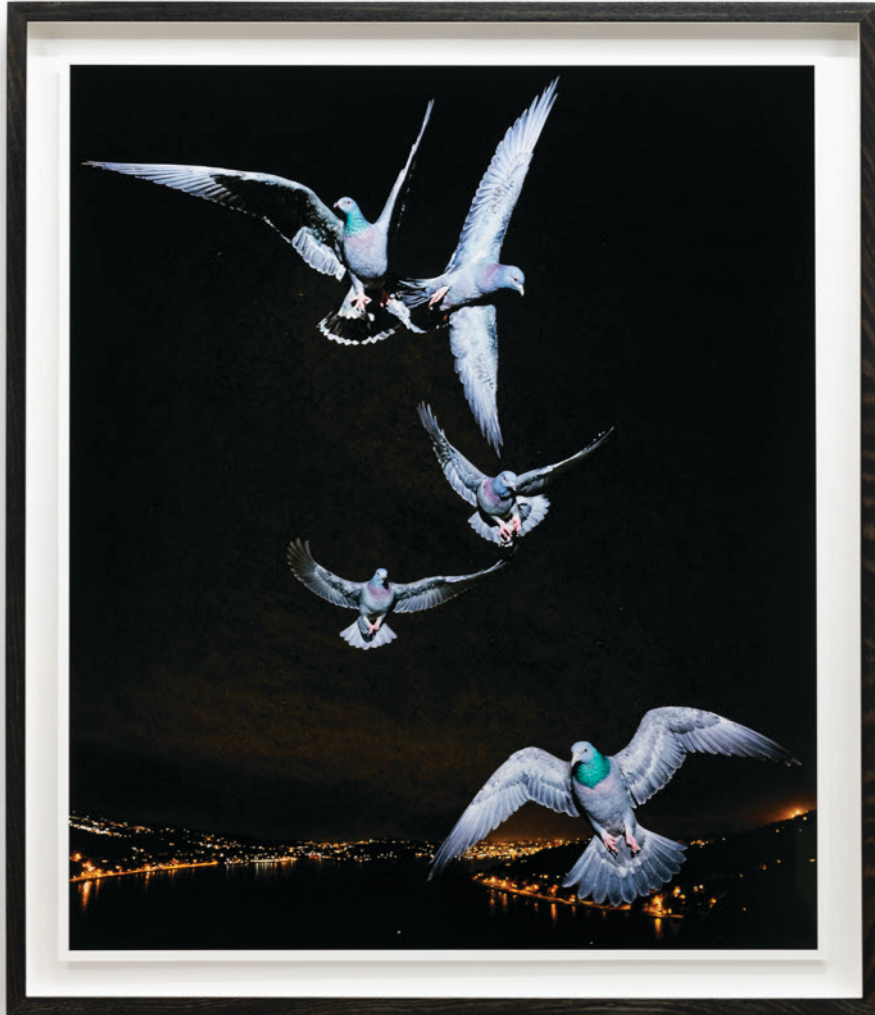
Trent Crawford, "Velocities iii (Tullio Crali)", 2024 Debossed archival inkjet print on baytra paper 840 x 710 mm, 940 x 810 mm (framed). Ed 2/3 + 2AP.