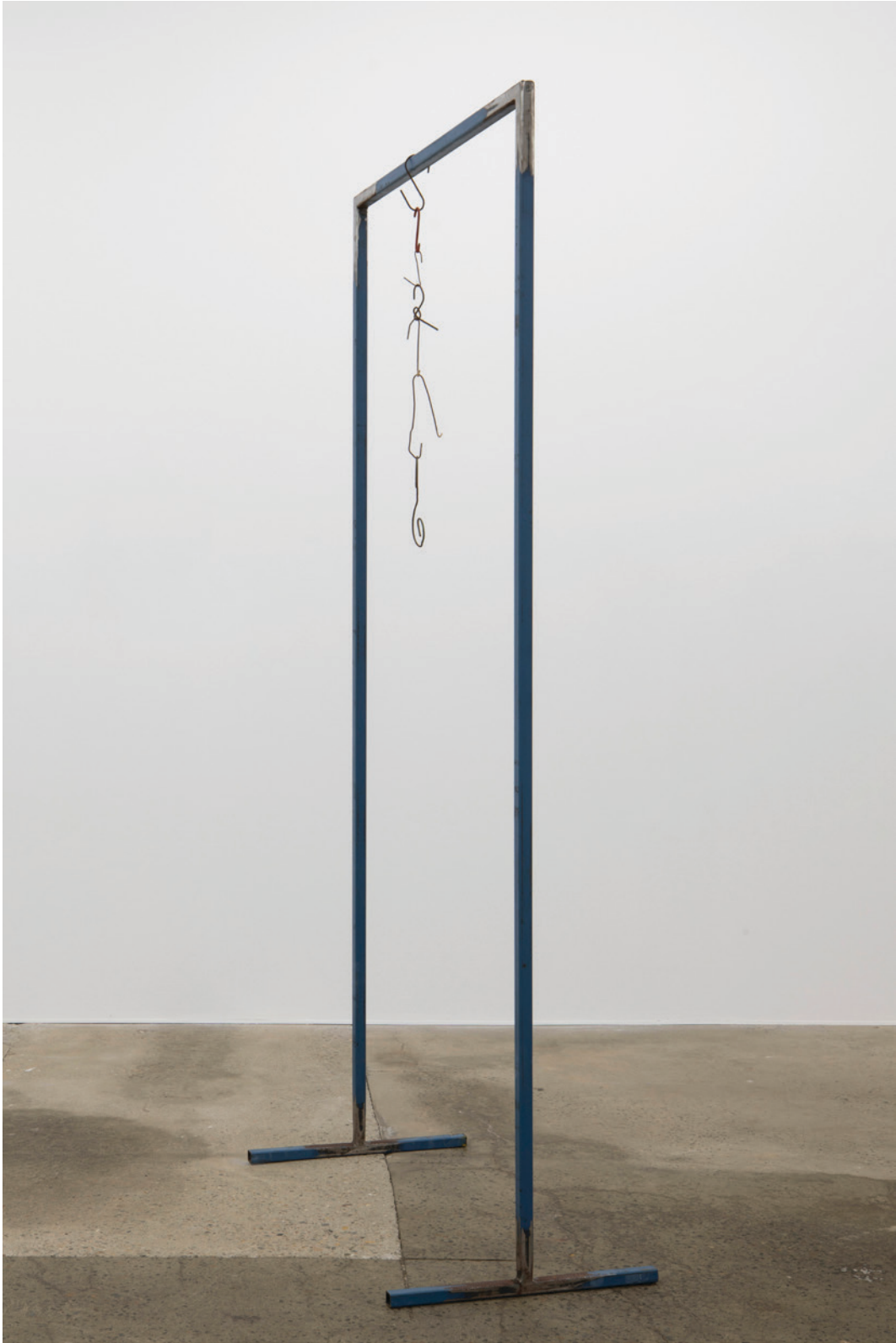
Mitchell Davis, "Sorcerer", 2024 Steel and found hooks 2030 x 870 x 500 mm