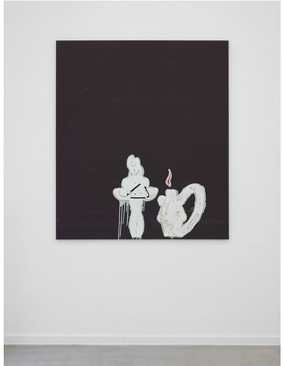
Mitchell Kehe Untitled 4 (the wheel turns) , 2023 Enamel, masking tape, found objects on synthetic fabric 150 x 130 cm