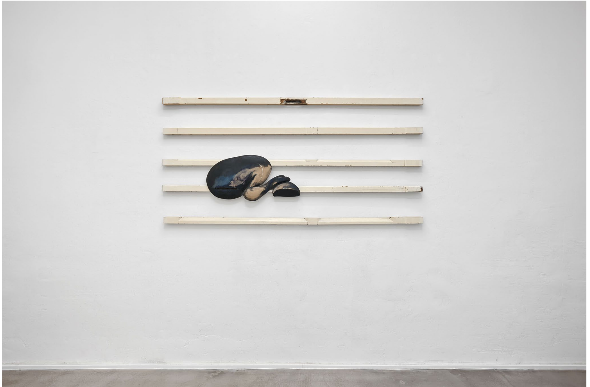
Yoora Park, Red Honey , 2025, modified door, mdf, harmonica comb, blow and draw plate, lacquer, soot ink, 84 x 205 x 11 cm