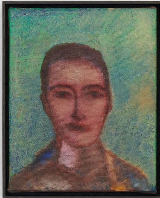
Behrang Karimi, P , 2019, Oil on Canvas, 30 x 24 cm