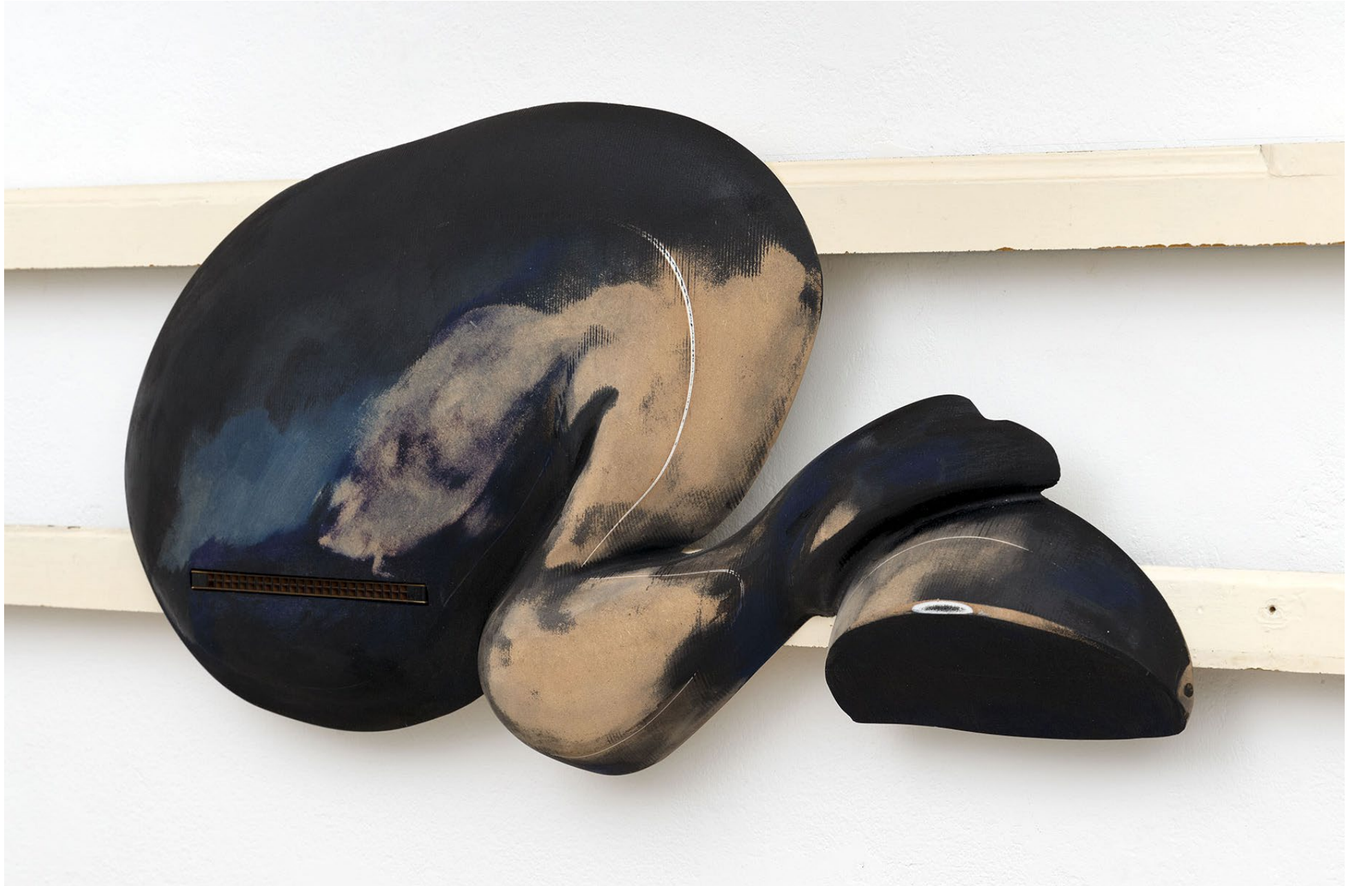
Detail, Yoora Park, Red Honey , 2025