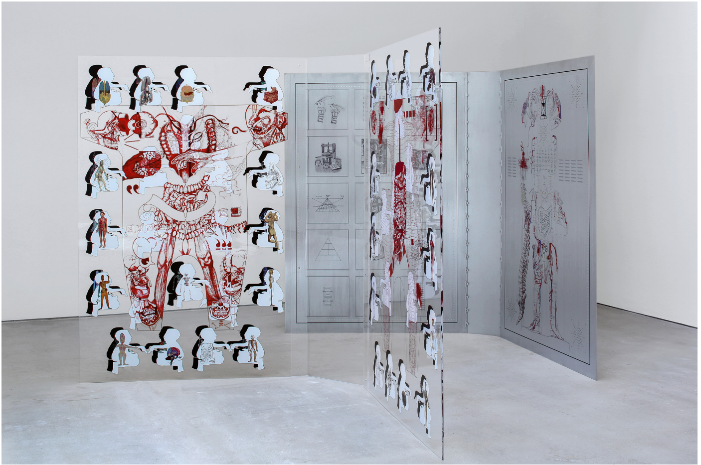
Open Book: Vessel Veins, Installation View Taxispalais Kunsthalle Tirol.