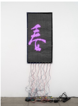
Ei Arakawa-Nash "Untitled (Yoko Ono, Haru [Spring], January 25, 1969)" 2025 48 x 24 in / 122 x 61 cm 6496 LEDs (WS2813, 100 LEDs/m, black) on hand-dyed fabric with grommets, K8000C controller, 2GB SD card with LedEdit 2014 files, 3x 5V 80A power supply with 22 AWG stranded wire