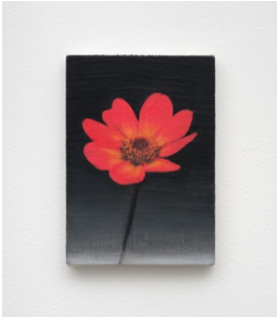
Joseph Jones "Orange Daisy" 2025 oil and acrylic on linen 8 ¼ x 5 7/8 in / 21 x 14.9 cm