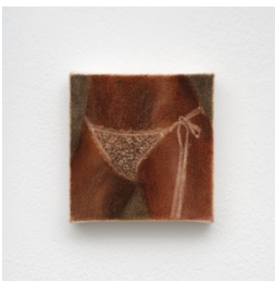
Katelyn Eichwald "Open Window" 2025 oil on canvas 4 x 4 in / 10.2 x 10.2 cm