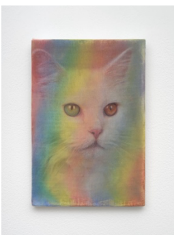
Joseph Jones "Pearl" 2025 oil and acrylic on linen 11 x 7 5/8 in / 28 x 19.4 cm