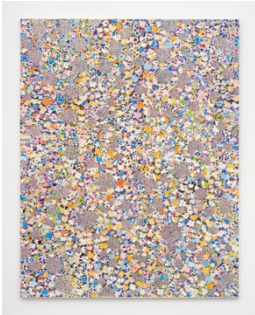
James Harrison "Geraniums" 2024 oil on canvas 82 ½ x 65 in / 209.6 x 165 cm