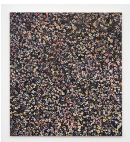
James Harrison "Dress" 2024 oil on canvas 66 x 60 in / 167.6 x 152.4 cm