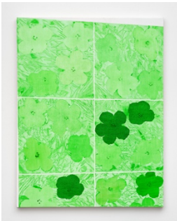
Maggie Friedman "Untitled (Elaine Sturtevant, Nine Warhol Flowers, 1965/69, Matthew Marks Gallery Los Angeles, 2024, right side version 1)" 2025 oil on canvas 58 x 45 in / 147.3 x 114.3 cm