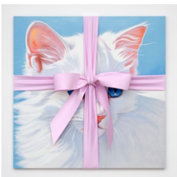
Eliza Douglas "Milk" 2024 oil and mixed media on canvas 67 x 67 x 11 3/4 in / 170 x 170 x 30 cm