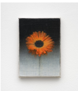
Joseph Jones "Dahlia" 2025 oil and acrylic on linen 7 x 5 in / 17.8 x 12.7 cm