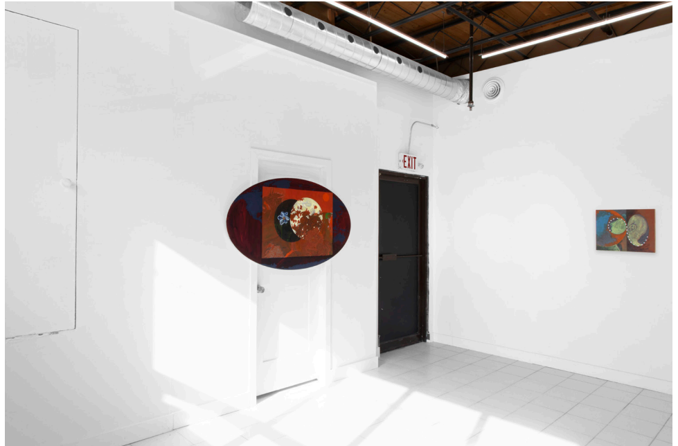
Installation view of Untitled and You are an Image of the Unending World , dimensions variable, 2025.

Pumice Raft is excited to present You are an Image of the Unending World , Kenneth Winterschlade's first solo exhibition in Canada.