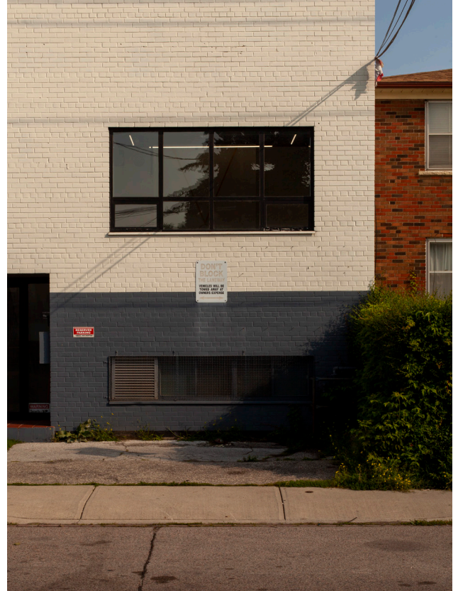
Exterior of 348 Ryding Ave #103, Toronto, ON M6N 1H5, Canada 2nd floor windows show Pumice Raft. 2023.

The physical space of Pumice Raft currently resides on the land of the Haudenosaunee, the Huron-Wendat, and the Anishinabewaki ᐱᐢᐸᐢᐢᐢᐢᐢᐢᐢ. Located on the first floor of a light industrial building at 348 Ryding Avenue , Pumice Raft sits in Toronto's present-day Junction neighbourhood. Nearby to the west, the Humber River (Niwa'ah Onega'gai'h) flows south towards Lake Ontario (Niigani-gichigami).