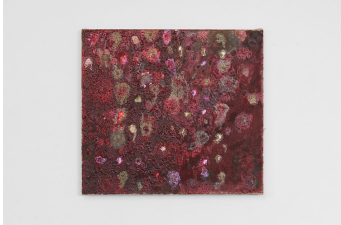
Morten Knudsen Untitled, 2024 Oil, wax, gouache, adhesive stock on canvas 11 3/4 x 13 in | 30 x 33 cm