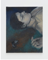
Tommy Xie To be of want of love, To be felt feeling is lack, 2022 Oil on canvas 15.8 x 19.6 inches | 50 x 40 cm