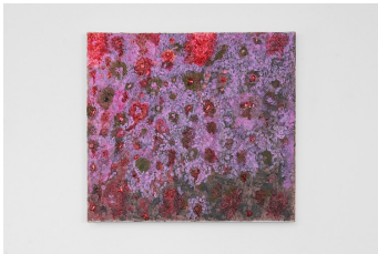
Morten Knudsen Untitled, 2024 Oil, wax, gouache, adhesive stock on canvas 11 3/4 x 13 in | 30 x 33 cm