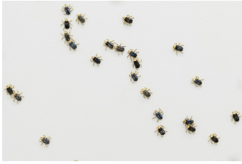
Elizabeth Jaeger Beetles, 2025 Brass, ceramic Variable, set of 30 beetles