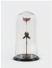
Chris Oh Glory, 2025 Acrylic on rainbow locust, antique candle holder, brass rods, resin 17 1/2 x 4 1/2 x 4 inches