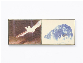
Sang Woo Kim Ways of Seeing 015, 2025 Pigment dye transfer on canvas, artist's frame 12.4 x 32.6 x 1.2 in | 31.6 x 82.8 x 3 cm