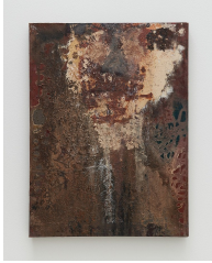
Barbara Wesolowska Begging to Dissolve, 2024 Oil, shellac and gold leaf on linen 25.8 x 17.7 inches