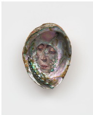
Chris Oh Flood, 2024 Acrylic on seashell 6 1/2 x 4 7/8 x 1 3/4 inches