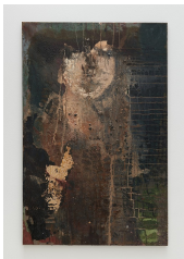
Barbara Wesołowska Appointment, 2024 Oil, shellac and gold leaf on linen 39.4 x 25.6 in | 100 x 65 cm