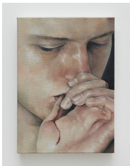
Tommy Xie This Mess We're In, 2025 Oil on canvas 9.8 x 13.8 in | 25 x 35 cm