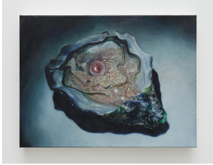
Tommy Xie Blood Pearl , 2025 Oil on canvas 11.8 x 15.75 in | 30 x 40 cm